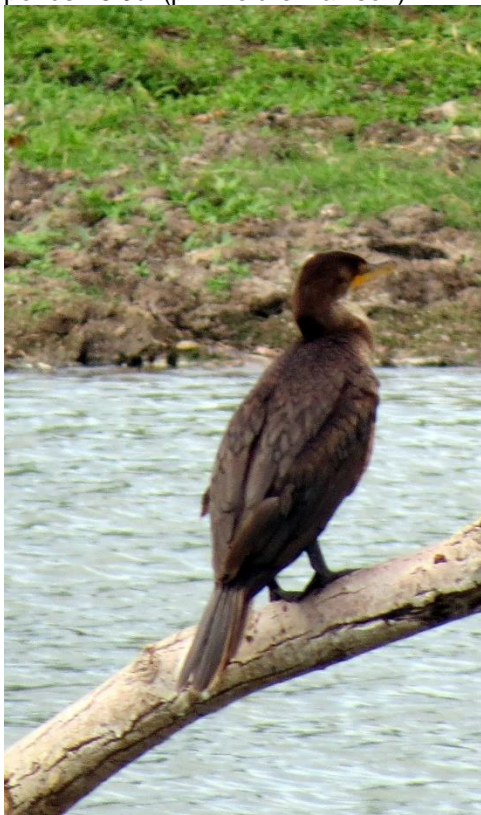
© Deidre Dawson, 25 Jul 2020, Bell County

Double-crested Cormorant – Rare in summer in Bell , a Double-crested Cormorant was at Witter Lane ponds 25 Jul (ph. Deidre Dawson).