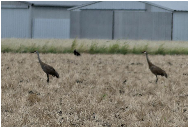
7 Jul 2020, Williamson County

Sandhill Crane – Within the Oaks and Prairies region, Sandhill Cranes are rarely seen in summer months, so the appearance of 2 at Granger Lake, Williamson 7 Jul is surprising.