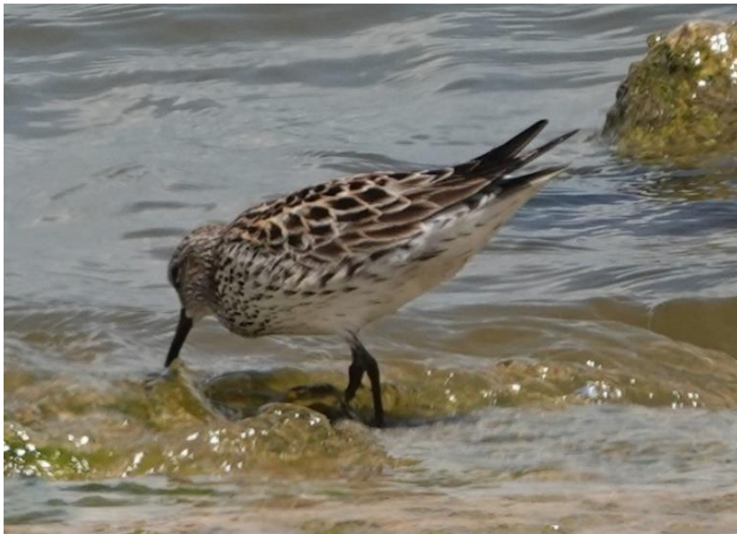
© Jane Tillman, 5 Jun 2020, Washington County

White-rumped Sandpiper – A late spring migrant, a single White-rumped Sandpiper was at Welch Park, Lake Somerville, Washington 5 Jun (ph. Jane Tillman).