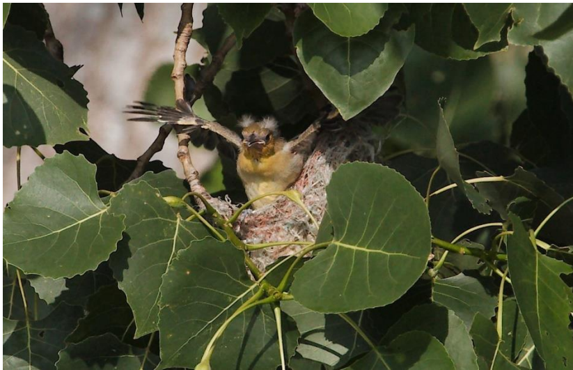
2 Jun 2020, McLennan County

Red-winged Blackbird – High counts of Red-winged Blackbirds for summer in Brazos were an estimated 200 28 Jun–2 Jul (Michael McCloy, Bert Foquet) at Sims Lane.