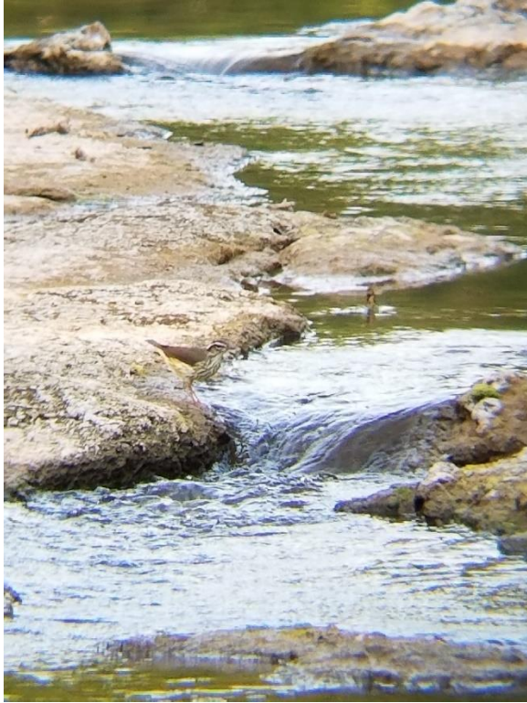
16 Jul 2020, Brazos County