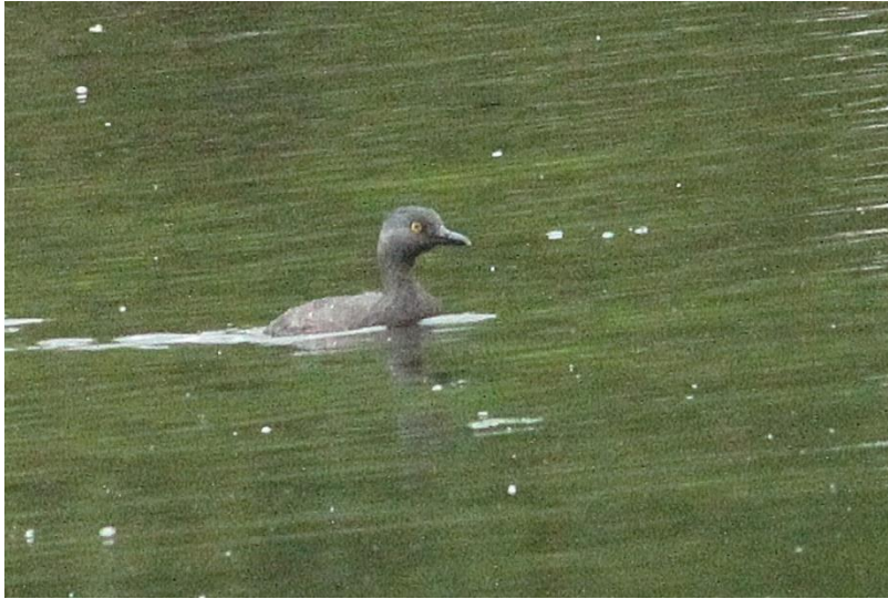
© Randy Pinkston, 26 Jul 2020, Bell County

Least Grebe – A pair of Least Grebes in courtship display were at Witter Lane ponds, Bell 26 Jul (ph. Randy Pinkston).