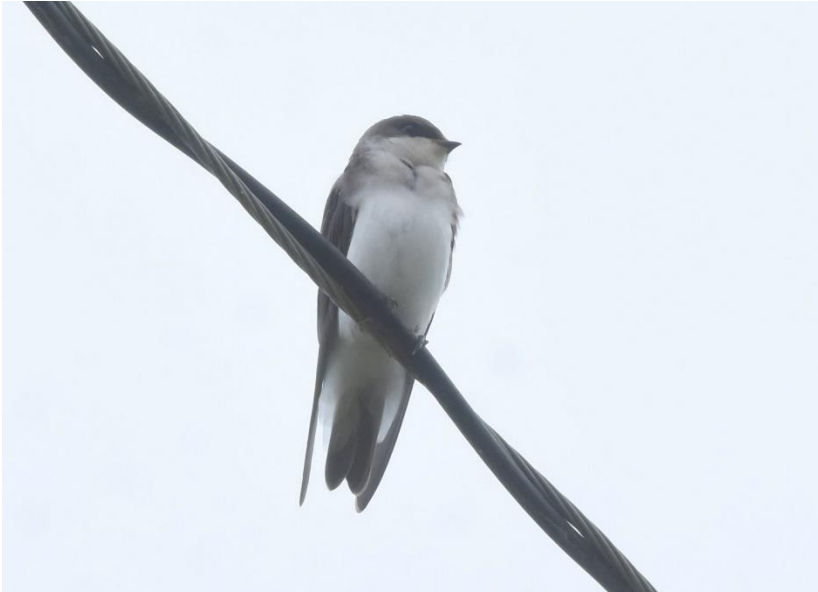
26 Jun 2020, Lee County