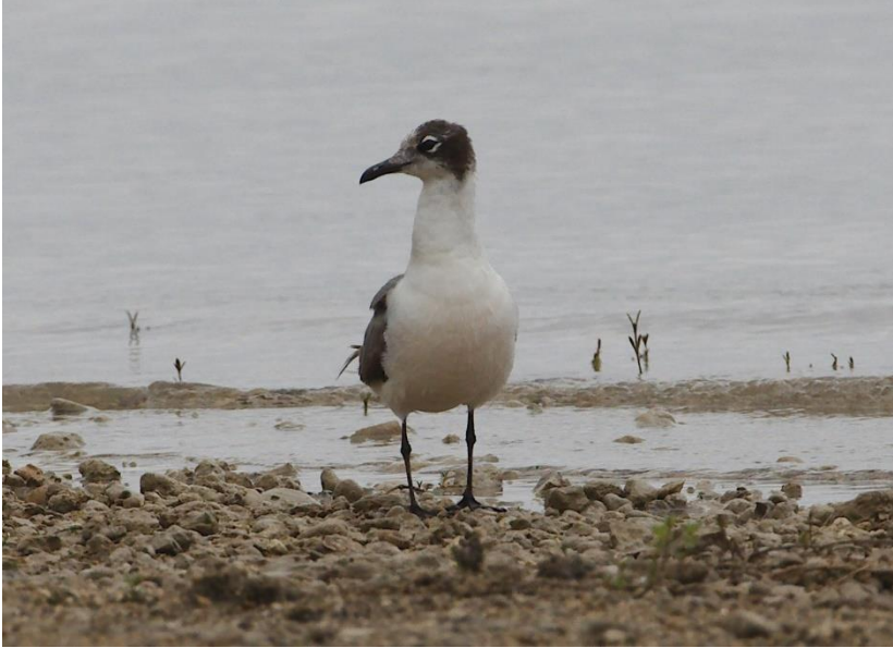
24 Jun 2020, Bell County