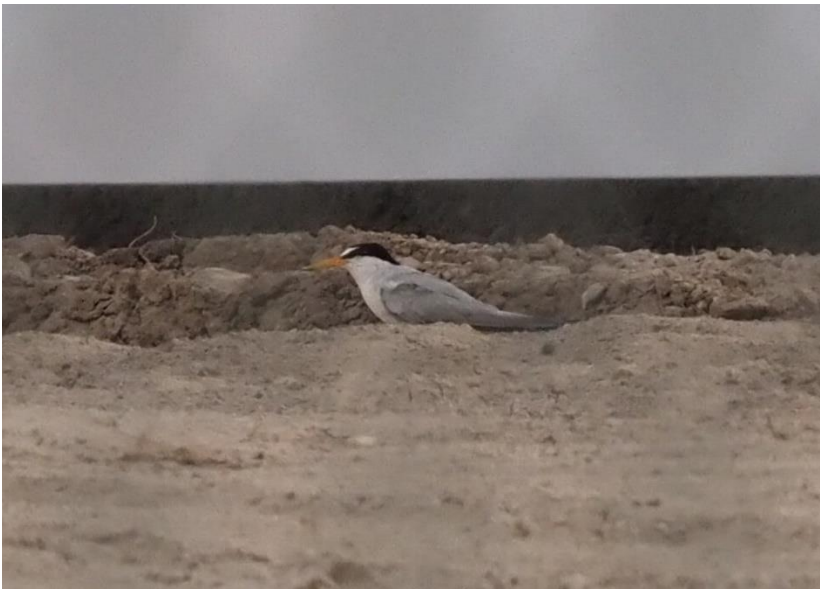
19 Jul 2020, Brazos County

Least Tern – A first record in summer for Brazos and one of only a handful of county records, a single Least Tern was on a pond at Easterwood Airport 17-20 Jul.