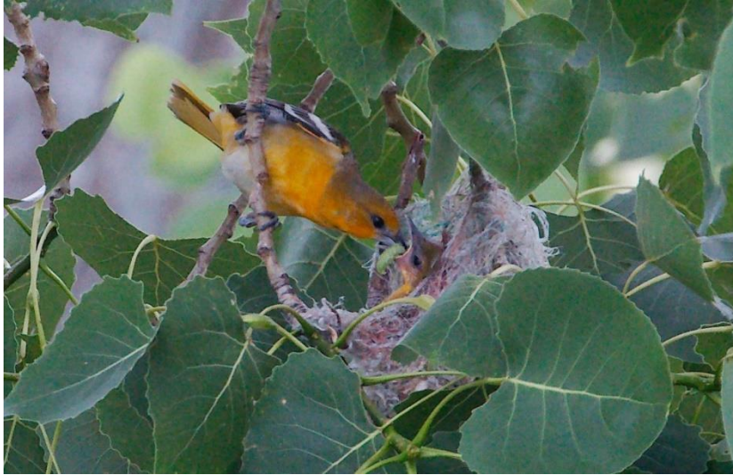
© Gil Eckrich, 1 Jun 2020, McLennan County