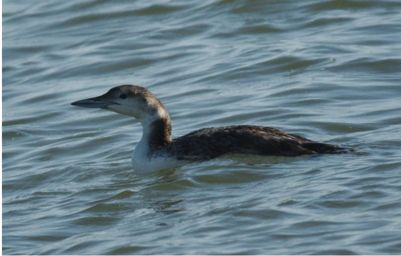
© Gil Eckrich, 11 Jun 2020, Bell County

Common Loon – A very late Common Loon was at Temple Lake Park, Belton Lake, Bell 11 Jun (ph. Gil Eckrich).