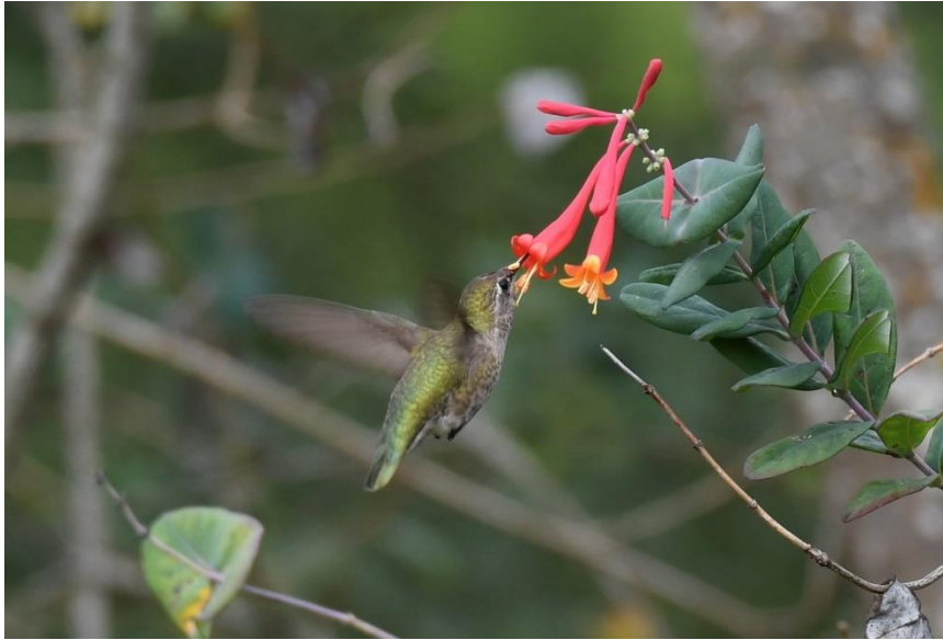
Anna's Hummingbird, 29 Nov 2020, Bryan, Brazos Co.