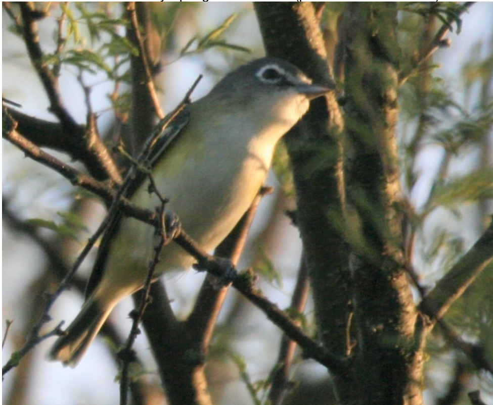
Cassin's Vireo 1 Nov 2020, Bryan City Cemetery, Brazos Co.