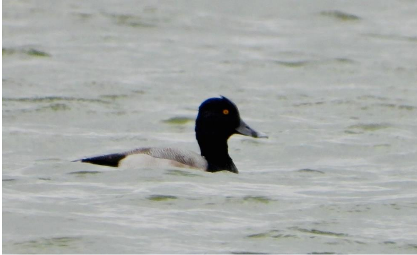
Greater Scaup, 29 Nov 2020, Finfeather Lake, Brazos Co.

Greater Scaup – Greater Scaup are a rarity in the Central Brazos Valley, with less than one sighting per year in the 10-county area. So, quite surprising is to have nine daily reports in Brazos 30 Oct–30 Nov (m.ob.) at Lake Bryan and Finfeather Lake.