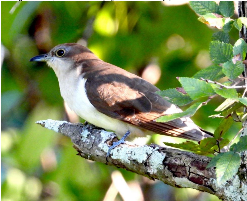
Black-billed Cuckoo, 25 Sep 2020, College Station, Brazos Co. © Vaishali Katju

Black-billed Cuckoo – Extremely rare in fall, a juvenile Black-billed Cuckoo was photographed in College Station, Brazos 25 Sep (ph Vaishali Katju).