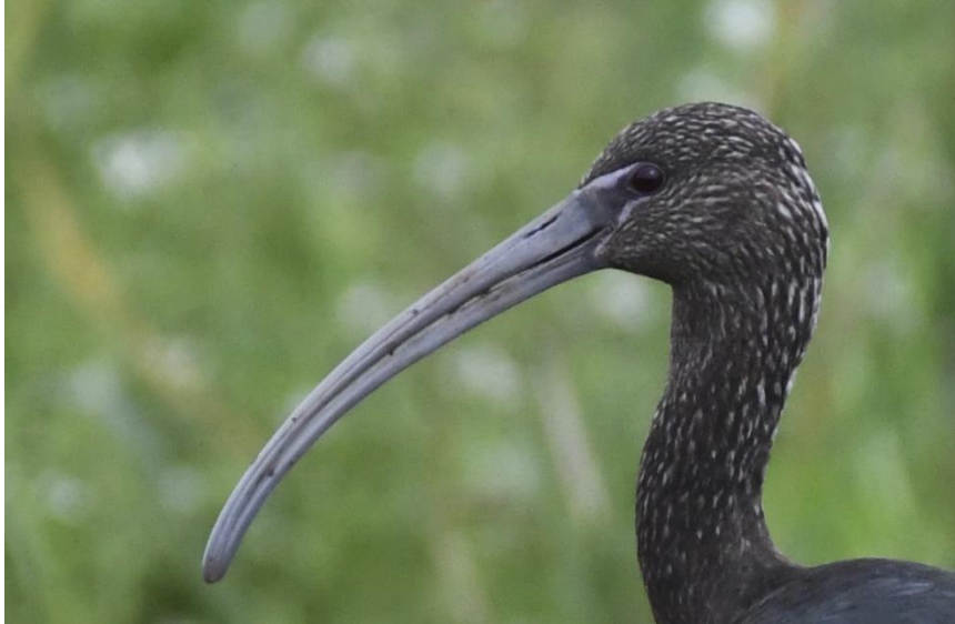
Glossy Ibis 5 Sep 2020, Sims Lane turf farms, Brazos Co.