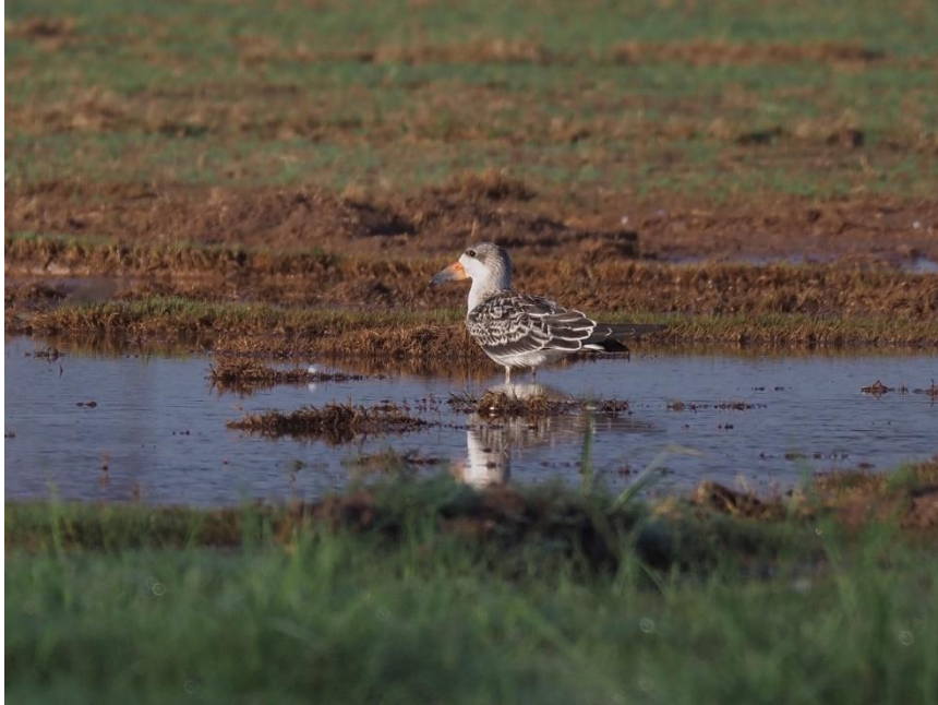
Black Skimmer 2 Aug 2020 Sims Lane, Brazos Co.