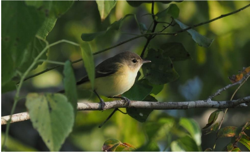
Bell's Vireo 2 Oct 2020, Emerald Forest, Brazos Co.