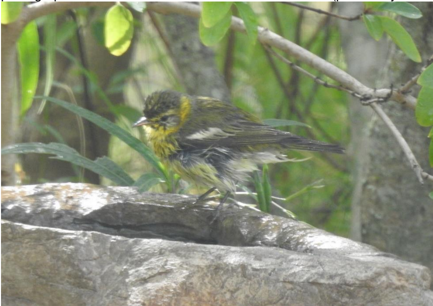
Cape May Warbler 6 Nov 2020, Colovista area, Bastrop Co. © Kathryn McAleese

Cape May Warbler – A fourth record for Bastrop and the second fall record, a Cape May Warbler was photographed at a birdbath in the Colovista area 6 Nov (ph. Kathryn McAleese).