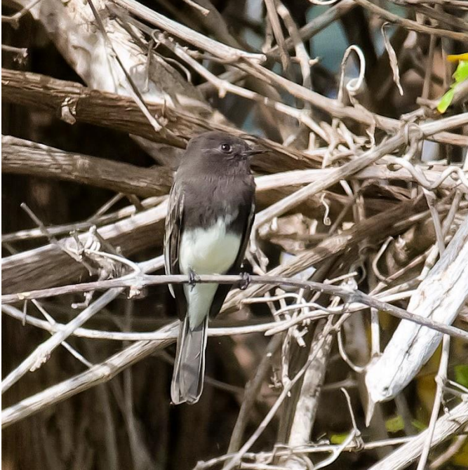
Black Phoebe 10 Nov 2020, Lake Waco, McLennan Co.

Black Phoebe – Two Black Phoebes at Reynolds Creek Park, Lake Waco 10-11 Nov is only the second record for McLennan , the first way back in 1975.