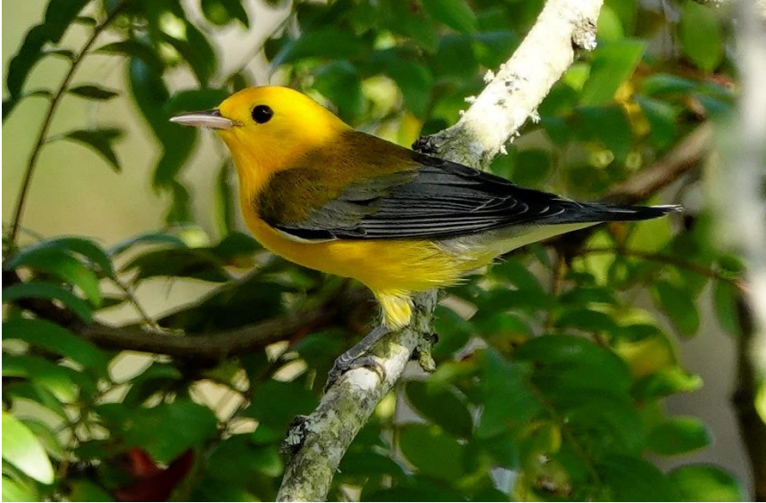
Prothonotary Warbler 15 Aug 2020, Sulphur Springs Road, Brazos Co.

Prothonotary Warbler – An adult pair and 2 fledglings were at Sulphur Springs Road, Brazos 4-26 Aug (Bill Eisele).