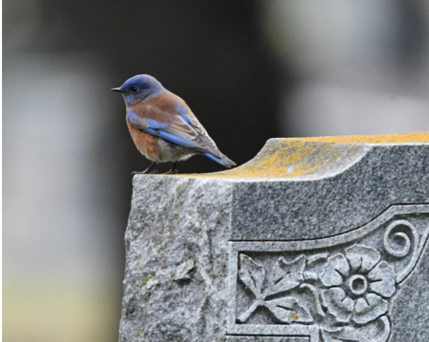
Western Bluebird 28 Nov 2020, Bryan City Cemetery, Brazos Co.

Western Bluebird – The last time a Western Bluebird was reported in Brazos was in 1949, so it is amazing to have multiple reports of up to 5 this fall 26 Nov+ (Simon Kiacz, m.ob.) at Bryan City Cemetery. The bluebirds were part of an eastern incursion this season that also included multiple sightings in Travis and Williamson .