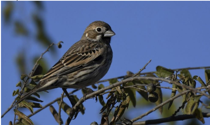
Lark Bunting 17 Nov 2020, Leonard Road, Brazos Co.