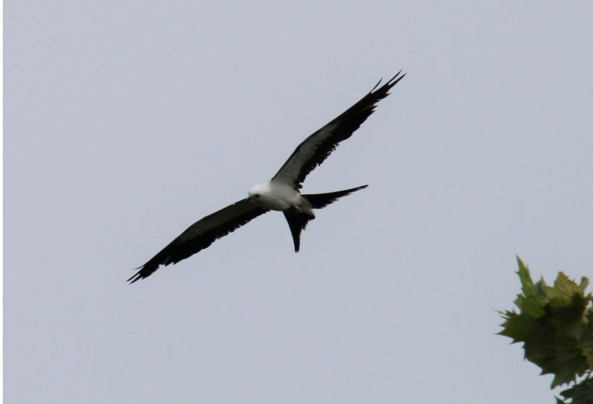
Swallow-tailed Kite 22 Aug 2020, Hwy 6, Grimes Co.