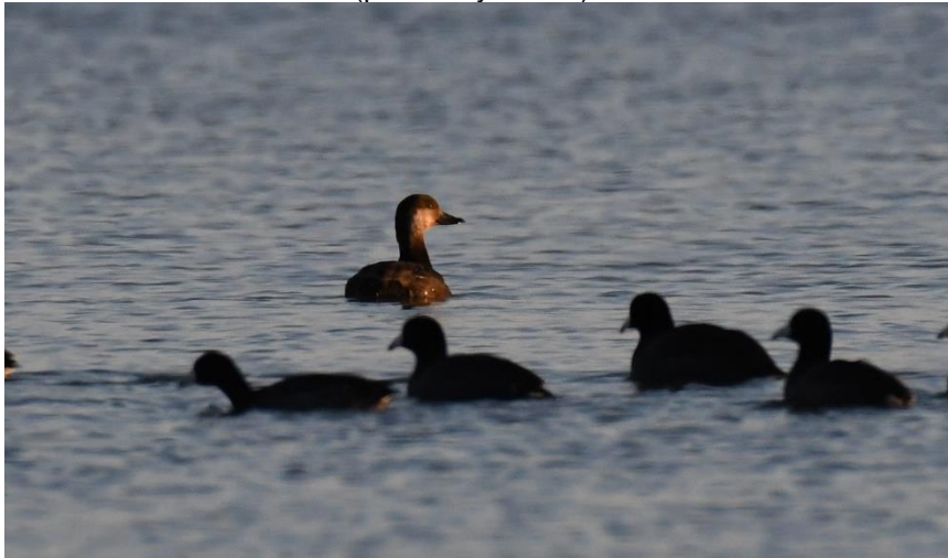
Black Scoter, 29 Oct 2020, Lake Bryan, Brazos Co.