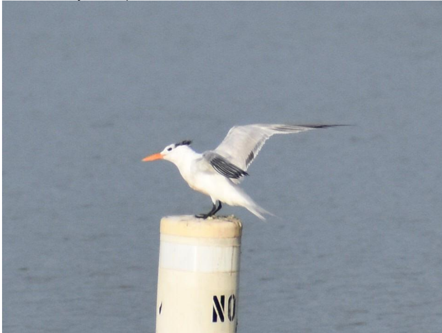
Royal Tern 30 Aug 2020, Lake Bryan, Brazos Co. © Rhett Raibley

Royal Tern – Only the second record for Brazos , a Royal Tern visited Lake Bryan 30 Aug–3 Sep (ph. Rhett Raibley, m.ob.)