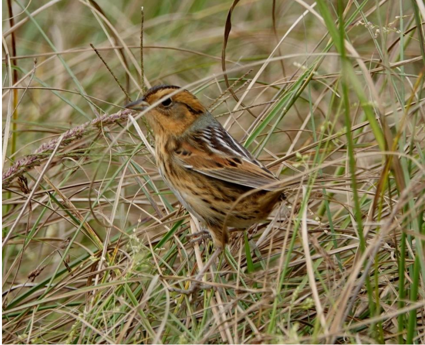
Nelson's Sparrow 17 Oct 2020, Veterans Park, College Station, Brazos Co.