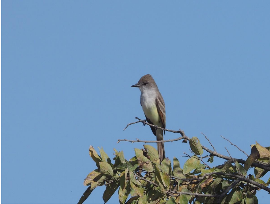
Ash-throated Flycatcher 21 Nov 2020, Sims Lane, Brazos Co.