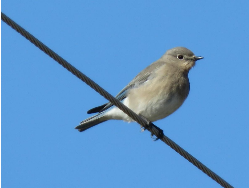
Mountain Bluebird 30 Nov 2020, Kemp Road, Brazos Co.

Mountain Bluebird – Mountain Bluebirds were last seen in Brazos in 1963, and now 28 Nov+ (ph. John Hale, m.ob.) one was observed near the Brazos River at Kemp Road. Up to 20 Mountain Bluebirds were in McLennan 8 Nov+ (ph. John Muldrow, m.ob.), found mostly at Old Crawford Road and Trading House Creek Reservoir.