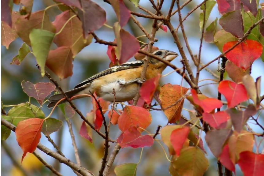
Black-headed Grosbeak 21 Nov 2020, Spring Creek Greenbelt, Brazos Co.