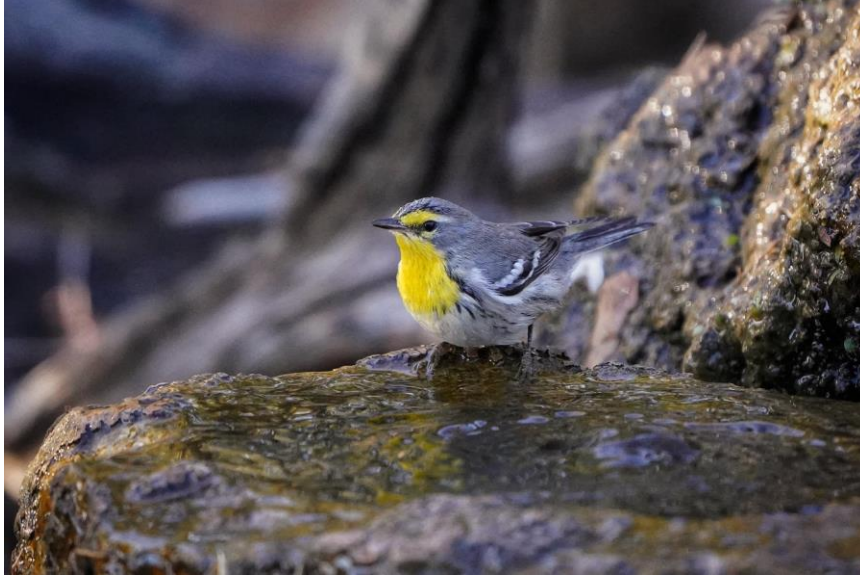
Grace's Warbler 4 Nov 2020, Bastrop Co.

Grace's Warbler – A Grace's Warbler was photographed at a private residence in Bastrop 4 Nov (Brian Burgoyne). It is the second Austin-area record, the first being 28 Oct 1979 in Austin.