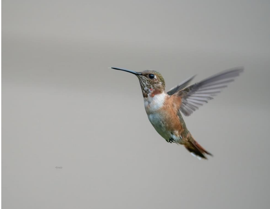
Rufous Hummingbird 21 Oct 2020, Steep Hollow, Brazos Co.

Rufous Hummingbird – An enormous influx of Rufous Hummingbirds descended in the Central Brazos Valley at more than 14 locations in Brazos , Grimes , and Lee 10 Aug+ (m.ob.).