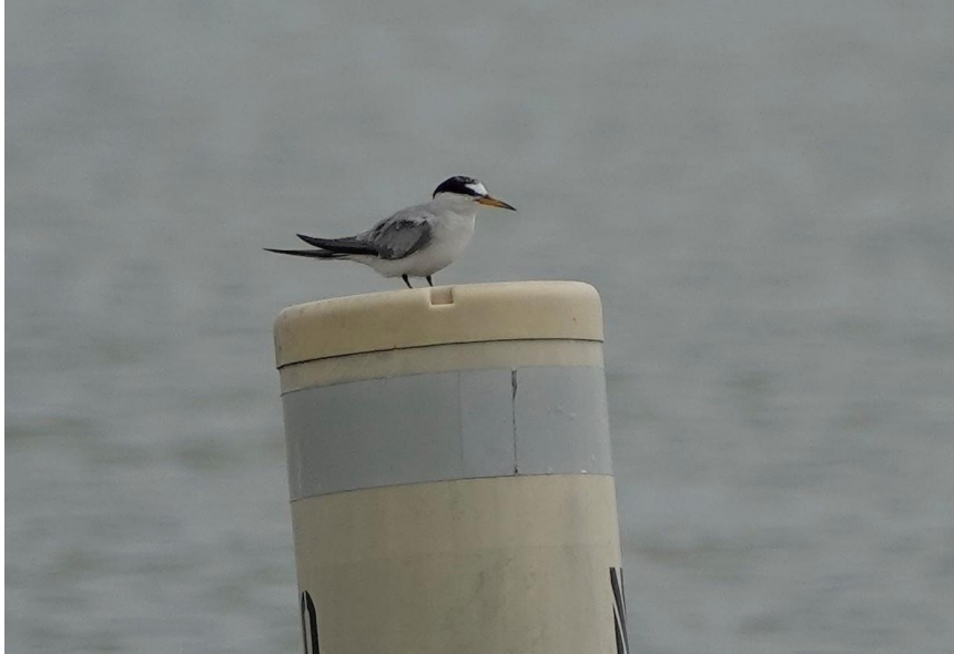
Least Tern 26 Aug 2020, Lake Bryan, Brazos Co.