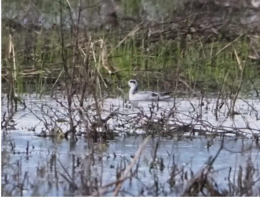
Red-necked Phalarope 23 Sep 2020, Sims Lane, Brazos Co.