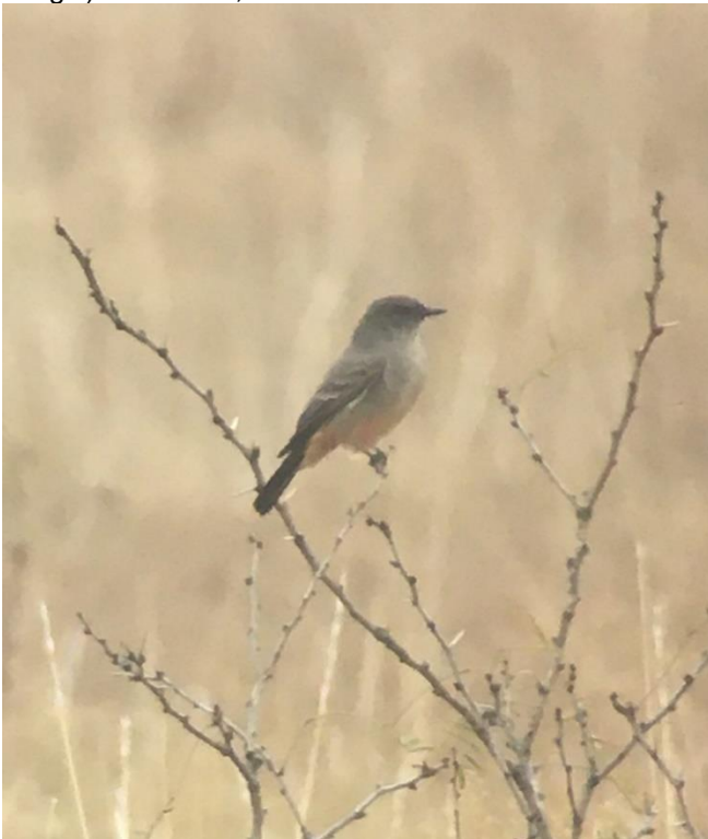
Say's Phoebe 27 Nov 2020, Milam Co.