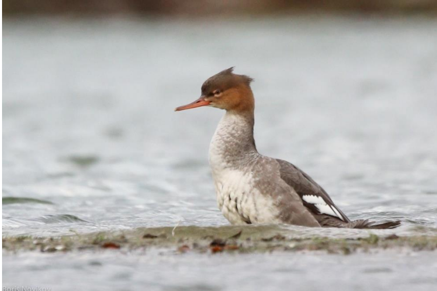
Red-breasted Merganser, 29 Nov 2020 Finfeather Lake, Brazos Co.