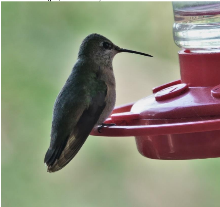
Calliope Hummingbird 1 Nov 2020, Belton, Bell Co.

Calliope Hummingbird – A first record for Milam , an amazing count of up to 3 Calliope Hummingbirds visited a feeder near Gause 25 Nov+ (Donna Lewis). A fourth record for Bell , a female Calliope was at Belton 1 Nov (ph, Gil Eckrich).