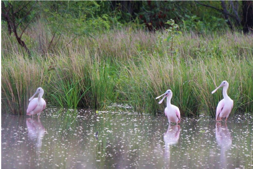
Roseate Spoonbill 1 Aug 2020 Moore Farms, Brazos

Roseate Spoonbill – A new high count for Brazos was 16 Roseate Spoonbills at Moore Farms 1 Aug.