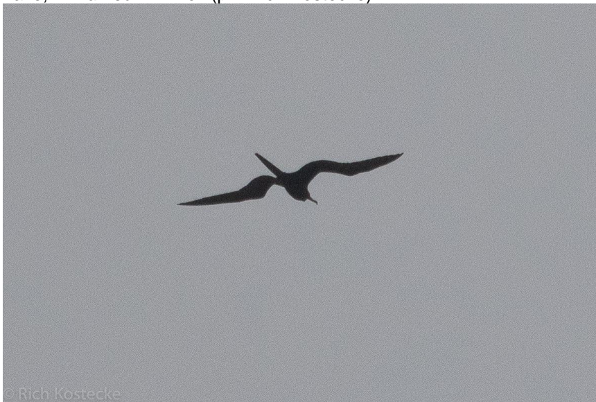
Magnificent Frigatebird 24 Nov 2020, Granger Lake, Williamson Co.