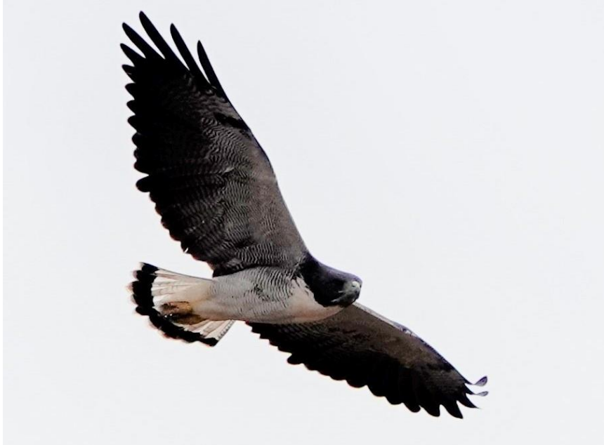
White-tailed Hawk 17 Oct 2020, Sims Lane, Brazos Co.