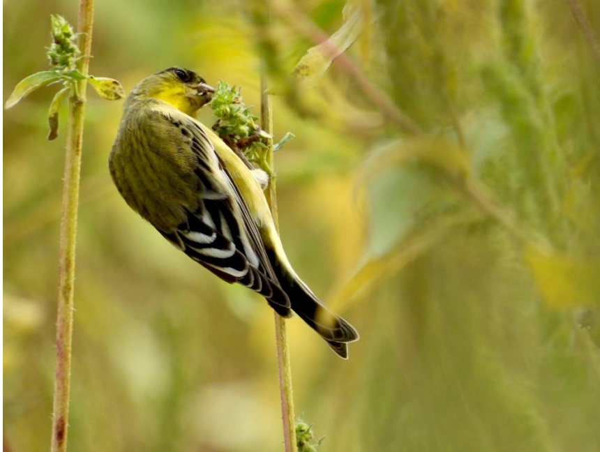
Lesser Goldfinch 6 Nov 2020, College Station, Brazos Co.