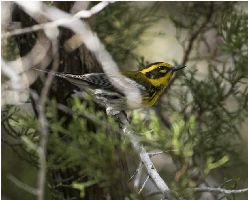
Townsend's Warbler 12 Oct 2020, Stillhouse Hollow Lake, Bell Co.

Townsend's Warbler – A Townsend's Warbler 12 Oct at Gravel Crossing W.M.A., Stillhouse Hollow Lake is a second record for Bell.