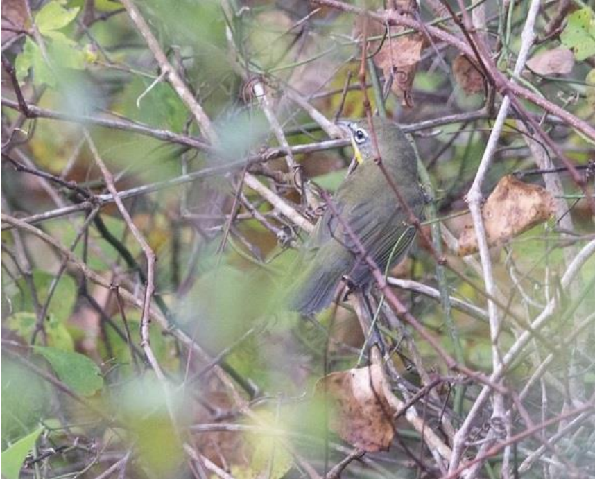
Yellow-breasted Chat 19 Oct 2020, Bryan, Brazos Co.