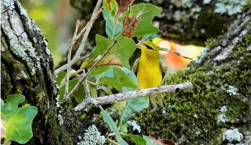
Blue-winged Warbler 20 Aug 2020, Kurten, Brazos Co. © Shirley Wilkerson

Blue-winged Warbler – Rare in fall, especially in the past decade, a Blue-winged Warbler was photographed at Kurten, Brazos at the very early date of 20 Aug (ph. Shirley Wilkerson).