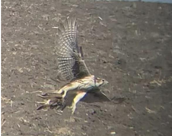
Prairie Falcon 5 Nov 2020, Dawson, Navarro Co.

Prairie Falcon – A fourth record for Navarro (the first was in 1879), a Prairie Falcon was eating a songbird in an open field near Dawson 5 Nov.