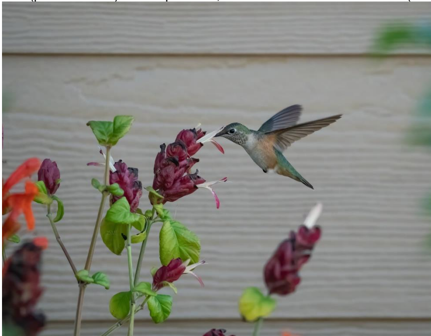
Broad-tailed Hummingbird 21 Oct 2020, Steep Hollow, Brazos Co.