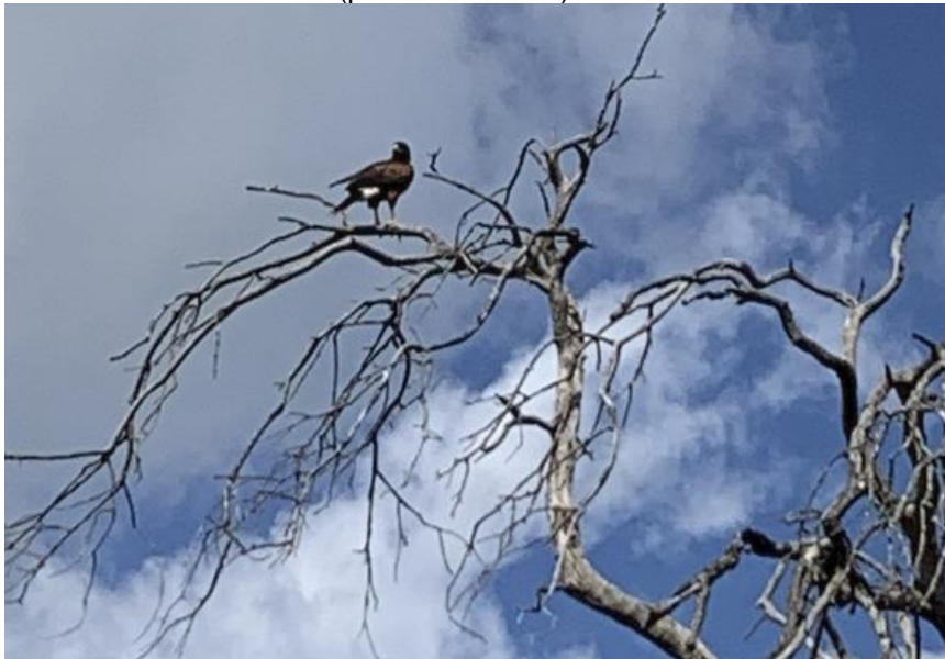
Harris's Hawk 9 Oct 2020, Belton Lake, Bell Co.