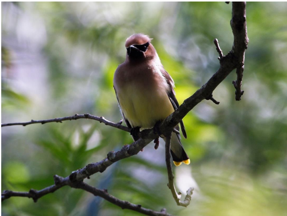
21 Jun 2019, Bell County

Cedar Waxwing – An out-of-season Cedar Waxwing at Belton 21 Jun provided the only summer record for Bell.