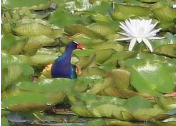
© Greg Page, 22 Jun 2019, Grimes County

Common Gallinule – Two adults with 3 chicks were noted at Carlos Lake, Grimes 9 Jun (Darrell Vollert).