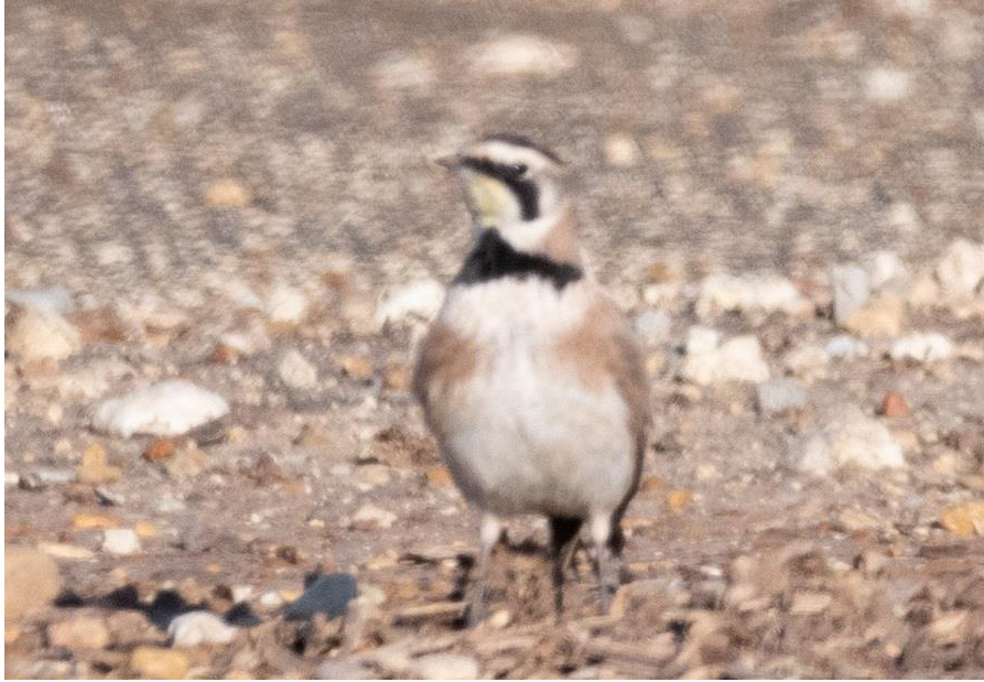
6 Jun 2019, McLennan County