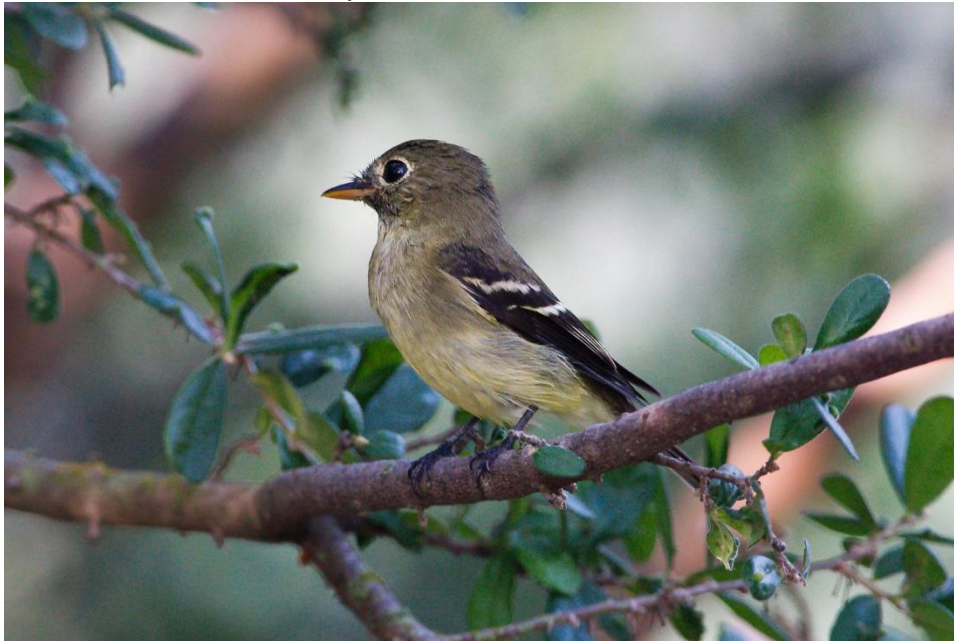
3 Jun 2019 Bell County