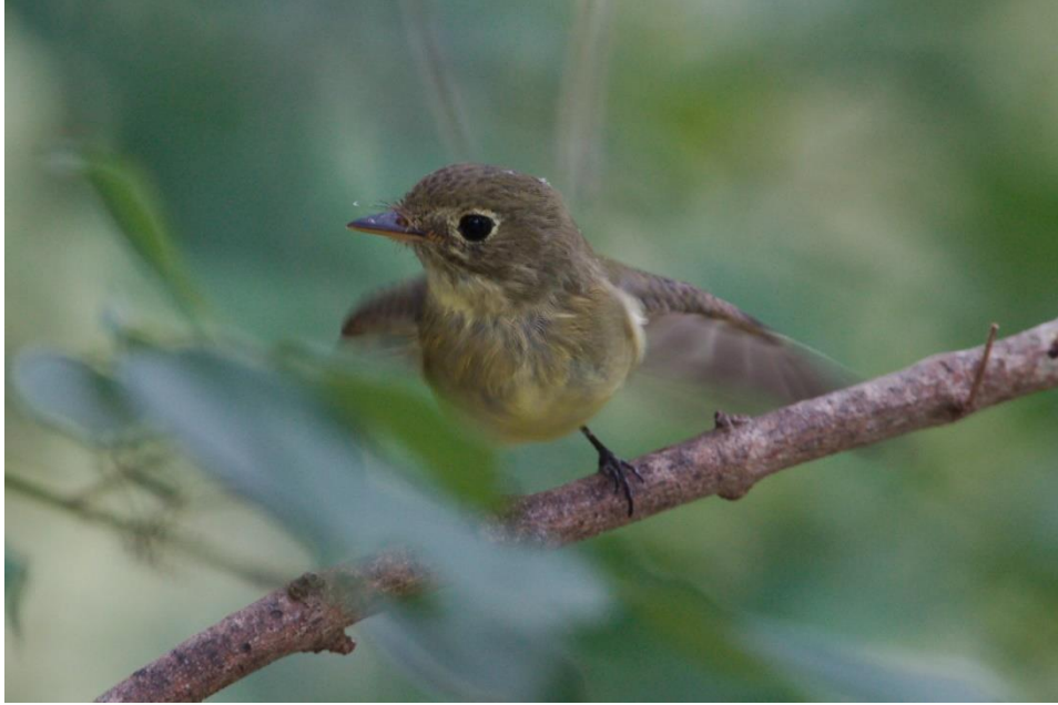
11 Jun 2019 Bell County