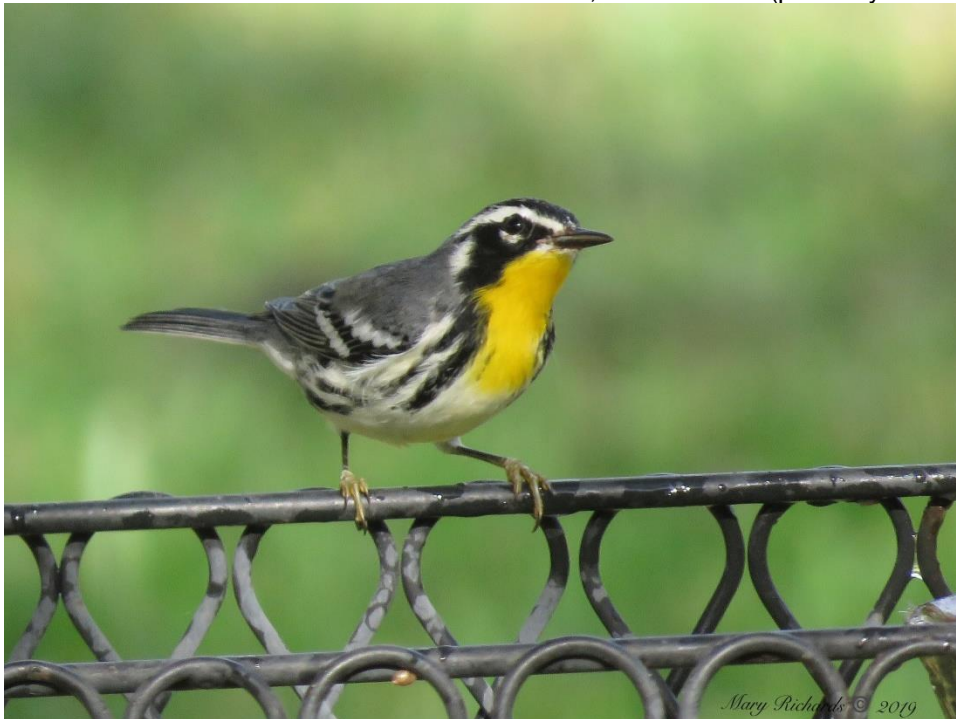
30 Jul 2019, Brazos County

Yellow-throated Warbler – An early migrant for Brazos and only the third summer record was a Yellow-throated Warbler at Red Feather Nature Preserve, Kurten 30 Jul (ph. Mary Richards).