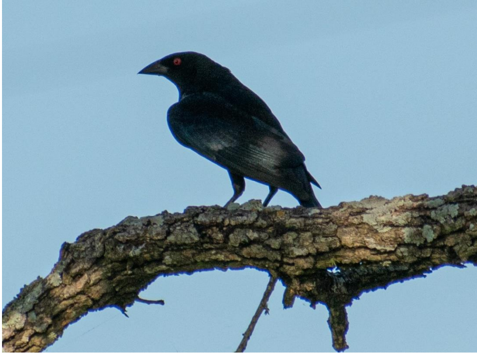
17 Jun 2019 Brazos County

Yellow-throated Warbler – An early migrant for Brazos and only the third summer record was a Yellow-throated Warbler at Red Feather Nature Preserve, Kurten 30 Jul.