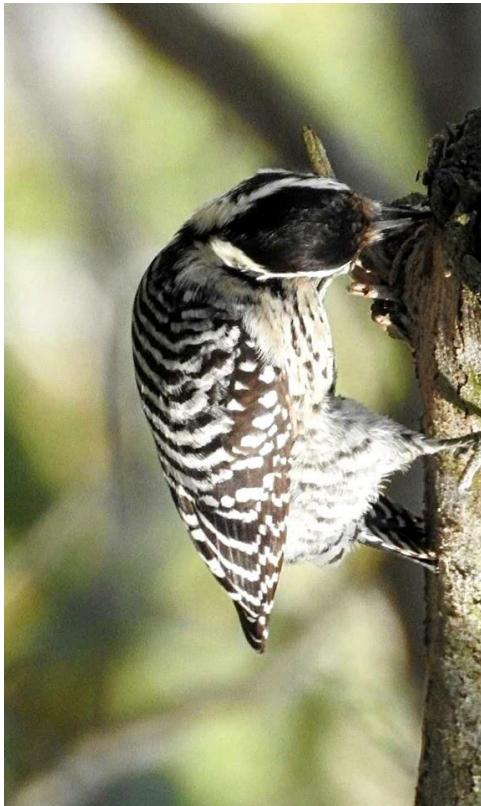
16 Jun 2019 Brazos County

Ladder-backed Woodpecker – Although not unusual in the 1960s, 70s, and 80s, there had been only 2 records since then for Brazos ; now a third record is 16 Jun at a home in College Station.