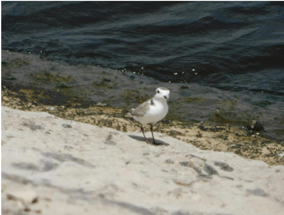
28 Jul 2019, Grimes County