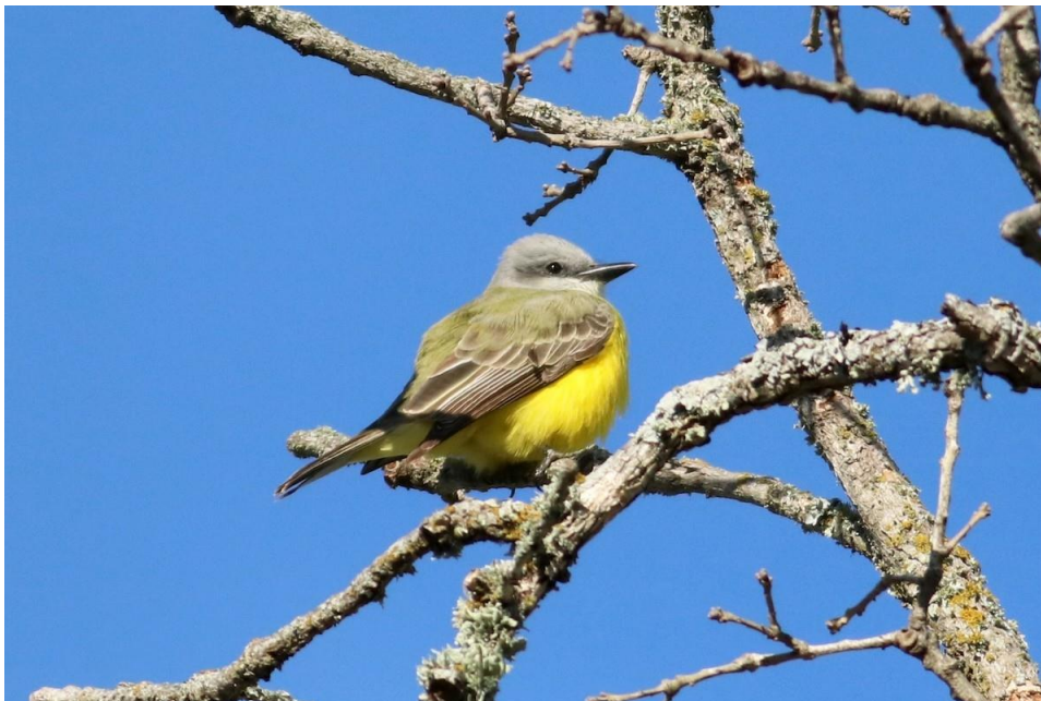
Couch's Kingbird