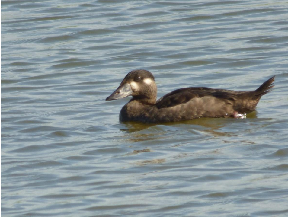
Surf Scoter © Candy McNamee 19 Oct 2019

White-winged Scoter – Only the third record for Bell , a White-winged Scoter was viewed at Stillhouse Hollow Lake from Stillhouse Park 3 Nov 2019 (†Gil Eckrich, ph. Daniel Kelch).