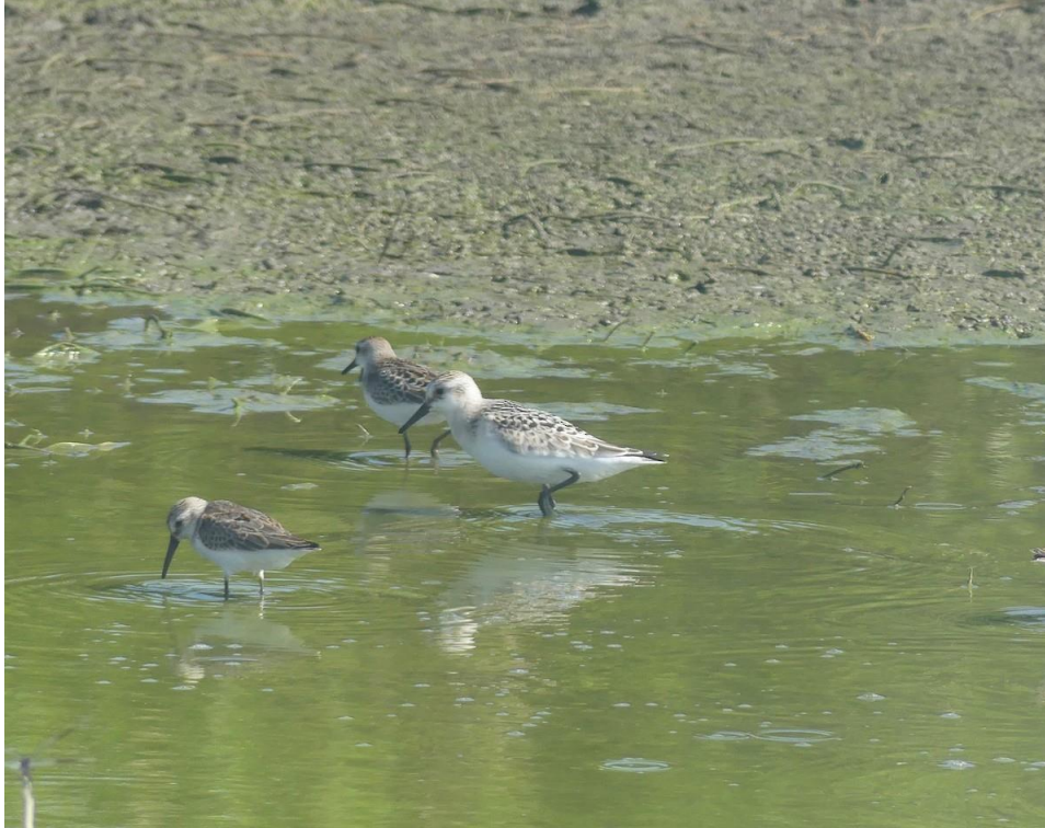
Sanderling 2 Sep 2019

Dunlin – A long staying single Dunlin was seen often 25 Oct–15 Nov (†Simon Kiacz, m. ob.) at Sims Lane, Brazos . Another was at Union Grove WMA, Stillhouse Hollow Lake, Bell 10 Nov (†Randy Pinkston).