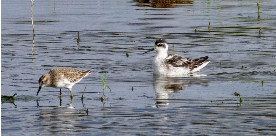
Red-necked Phalarope