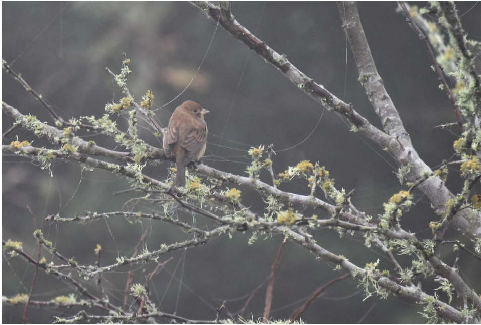
Indigo Bunting 29 Nov 2019

Dickcissel – A late female Dickcissel was southeast of Bastrop, Bastrop 16 Nov (Jonah Gula).