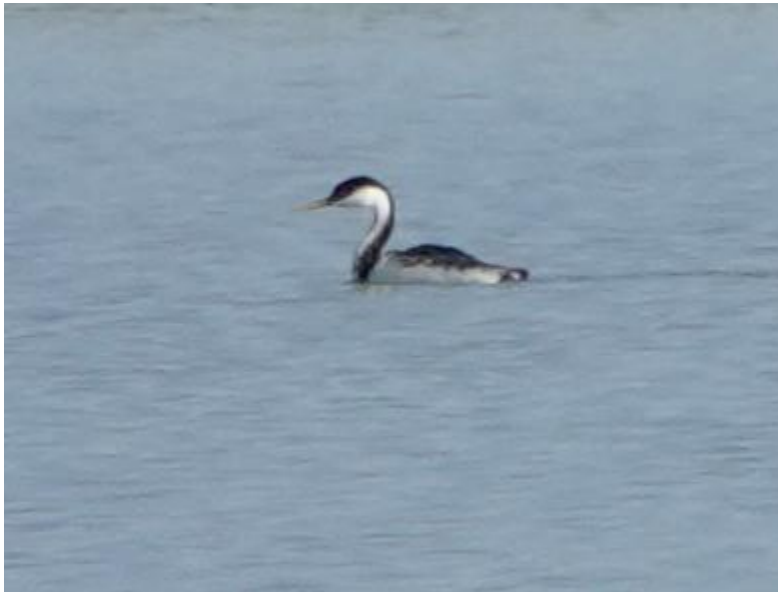
Western Grebe 9 Nov 2019