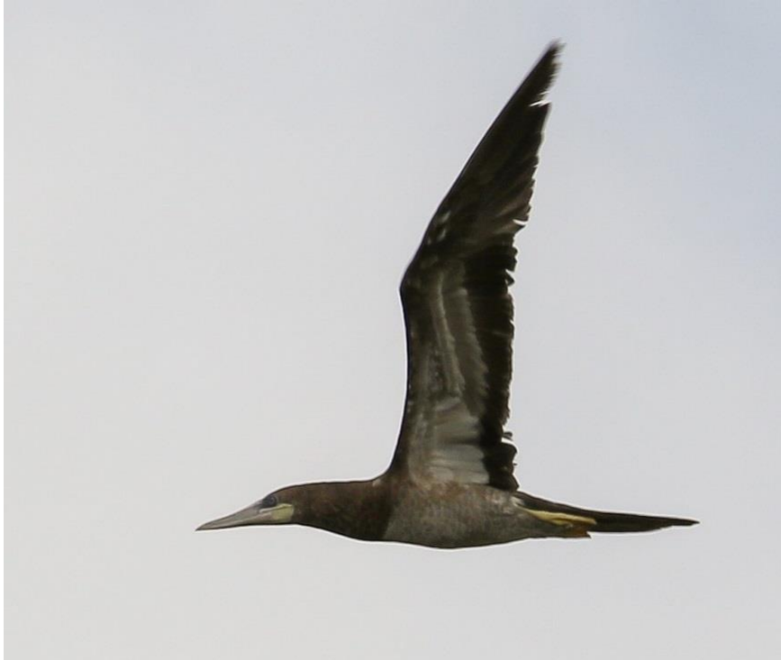
Brown Booby 17 Aug 2019