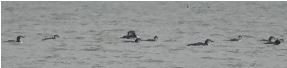
Common Loons