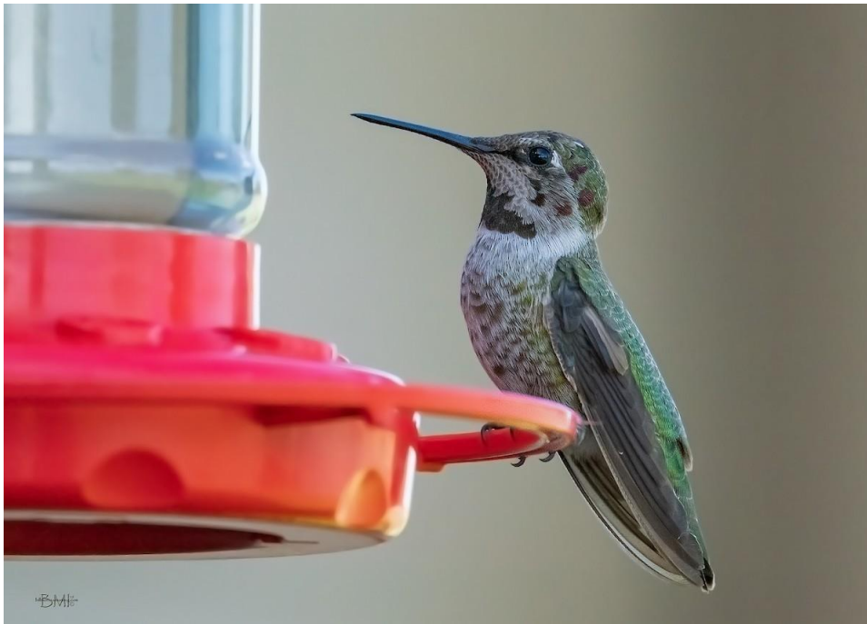
Anna's Hummingbird 24 Oct 2019