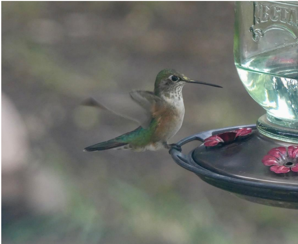
Broad-tailed Hummingbird © Charlie Plimpton 28 Sep 2019

Broad-tailed Hummingbird – A Broad-tailed Hummingbird visited Salado, Bell feeders 28 Sep–3 Oct (†ph. Charlie Plimpton, ph. Chelsea Plimpton). In the past decade, Broad-tailed appears almost annually at least once in Bell .