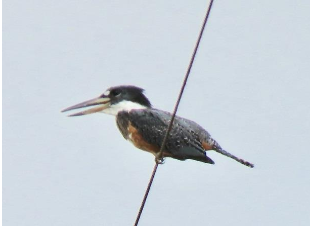
Ringed Kingfisher 29 Aug 2019

American Kestrel – A surprising 22 American Kestrels were counted all together on telephone lines over grasshopper-laden fields southwest of Bastrop, Bastrop 5 Oct (Jonah Gula).