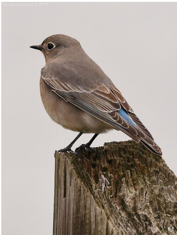
Mountain Bluebird © Doug Orama 30 Oct 2019

Mountain Bluebird – A 6 th record for Bell , a Mountain Bluebird was at Stillhouse Park, Stillhouse Hollow Lake 29-31 Oct (ph. Gil Eckrich, m.ob.).