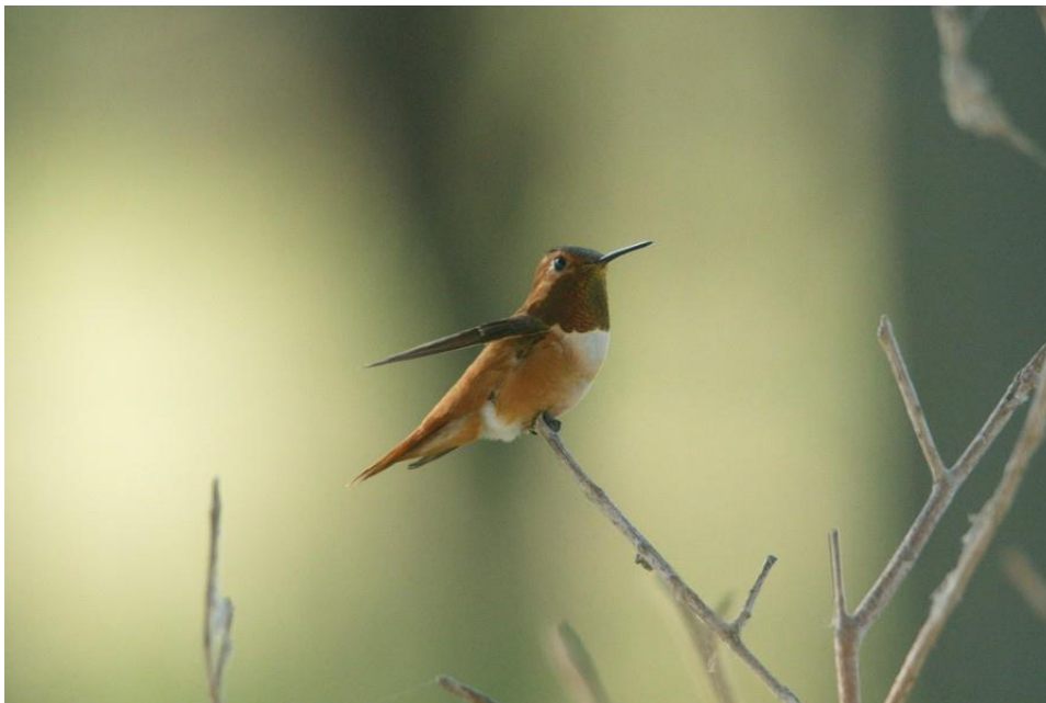
Rufous Hummingbird 12 Aug 2019

Rufous Hummingbird – A Rufous Hummingbird photographed near Blooming Grove 12 Aug is apparently only the third reported record for Navarro .