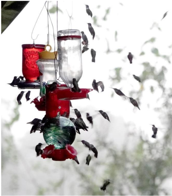
Ruby-throated Hummingbirds 27 Sep 2019

Ruby-throated Hummingbird – Ruby-throated Hummingbirds were in abundance 27 Sep in Kurten, Brazos when 41 were photographed in a single frame and at least 9 more were in nearby trees and bushes.