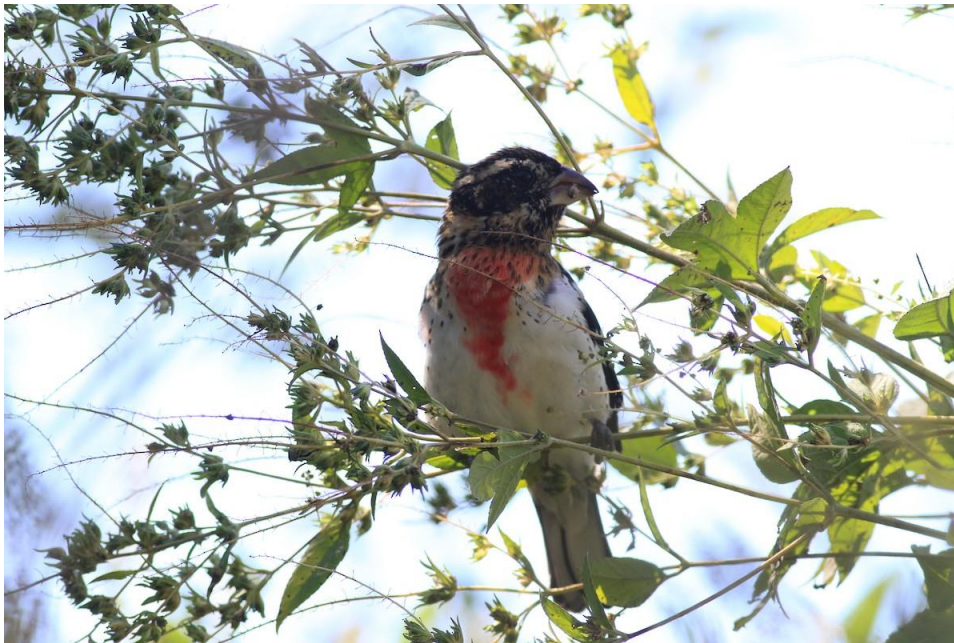
Rose-breasted Grosbeak