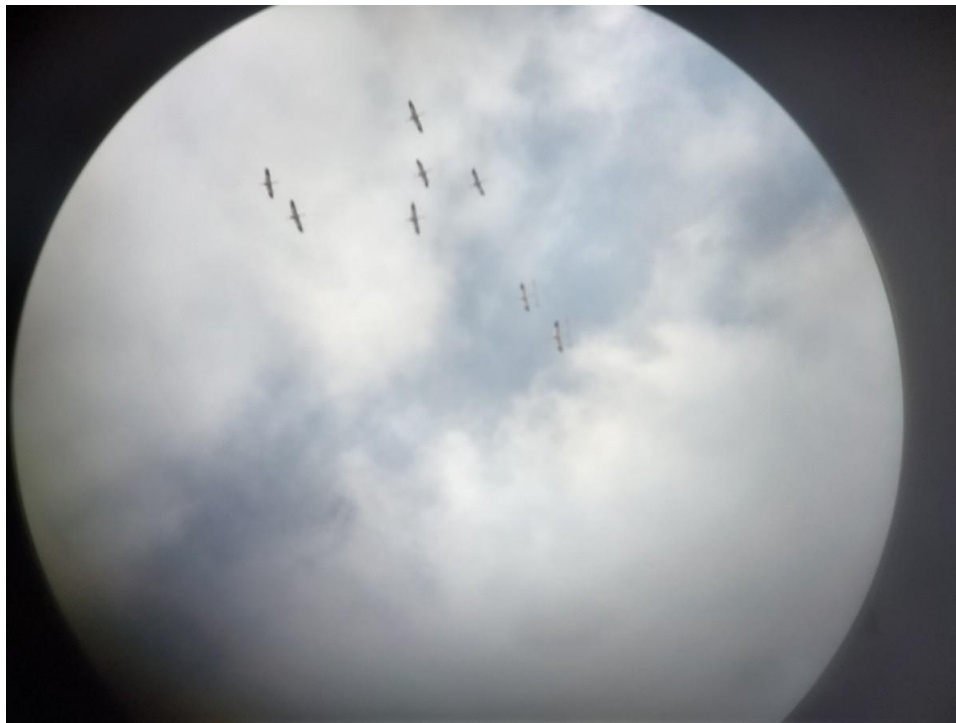
Whooping Crane © Timothy Freiday 1 Nov 2019

Whooping Crane – Two adult Whooping Cranes were photographed 27 Oct (ph. Tyler Miloy) at Sims Cutoff, Brazos . Another flock of 8 flew near Lexington, Lee 1 Nov (†ph. Timothy Freiday).