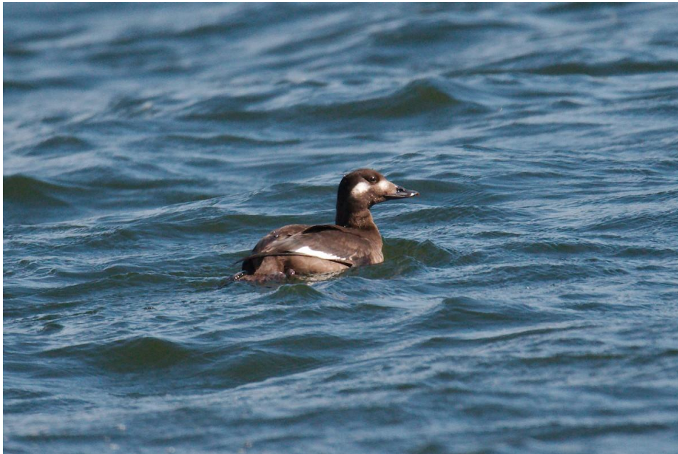
White-winged Scoter © Daniel Kelch 3 Nov 2019

White-winged Scoter – Only the third record for Bell , a White-winged Scoter was viewed at Stillhouse Hollow Lake from Stillhouse Park 3 Nov 2019 (†Gil Eckrich, ph. Daniel Kelch).