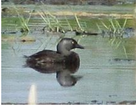
Least Grebe