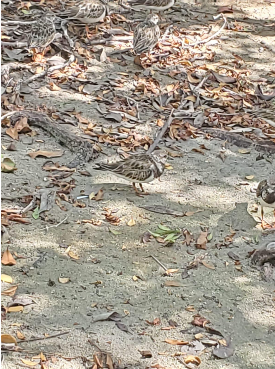
Ruddy Turnstones, Brazos County