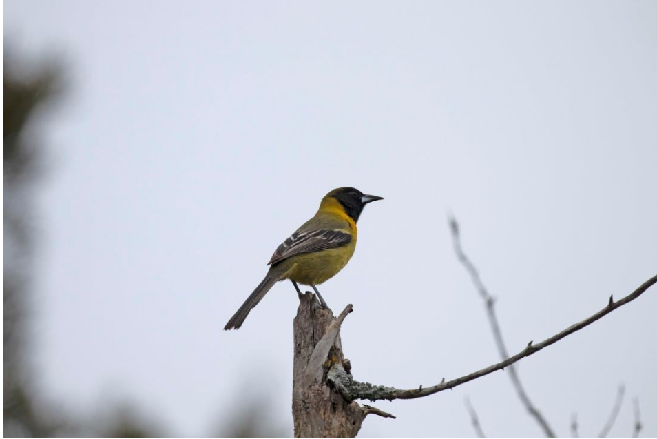
Audubon's Oriole, Bastrop County