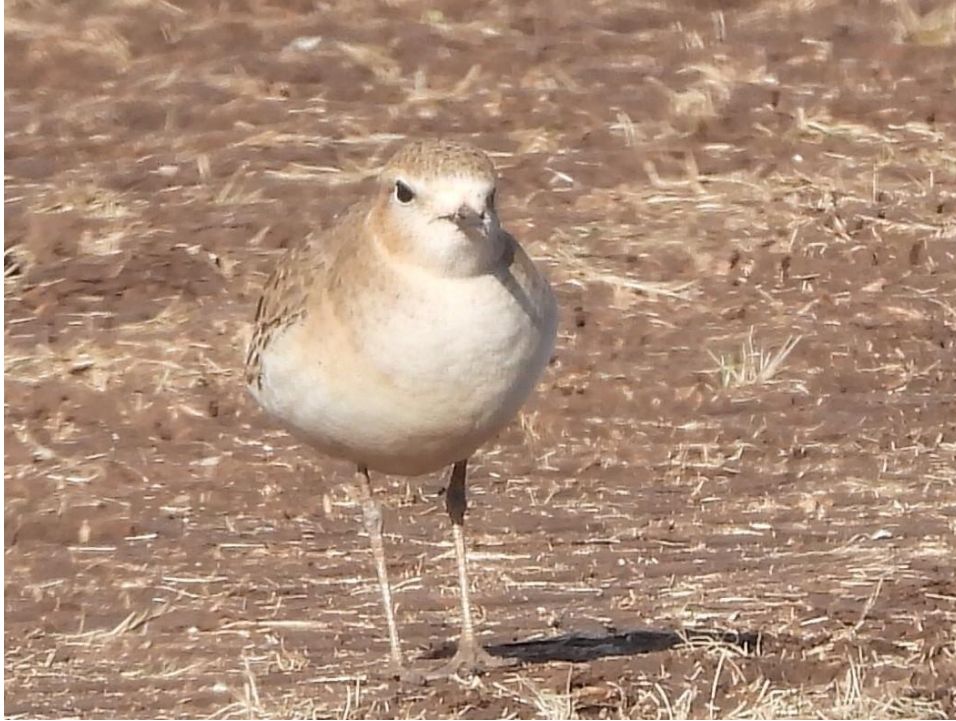
Mountain Plover, Burleson County