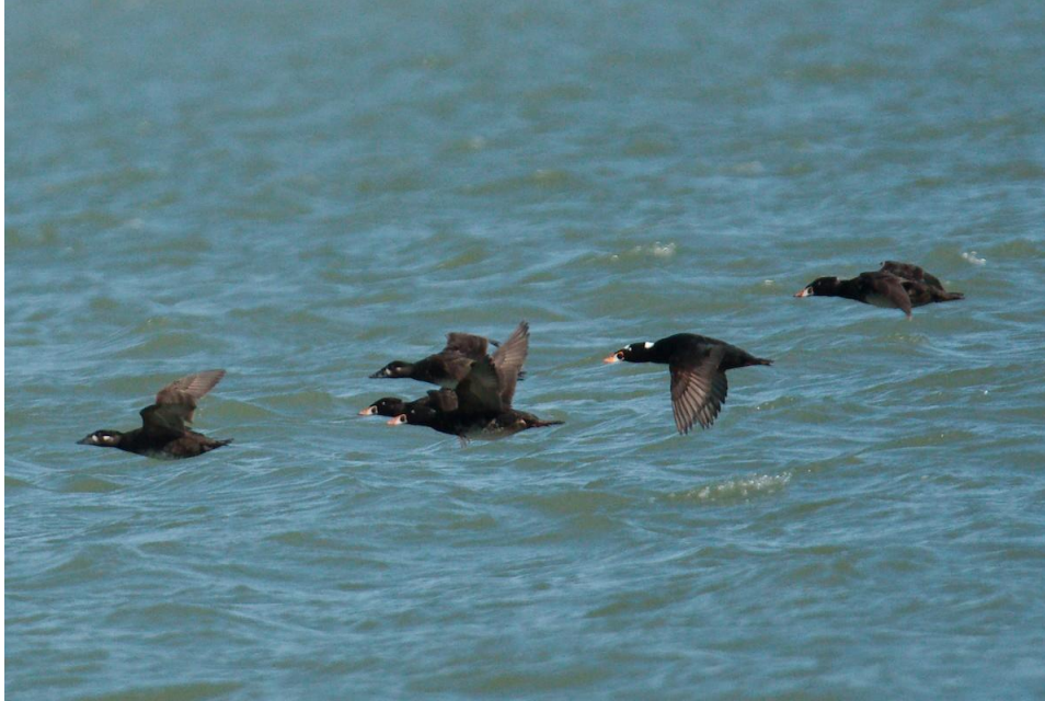
Surf Scoter, Belton Lake