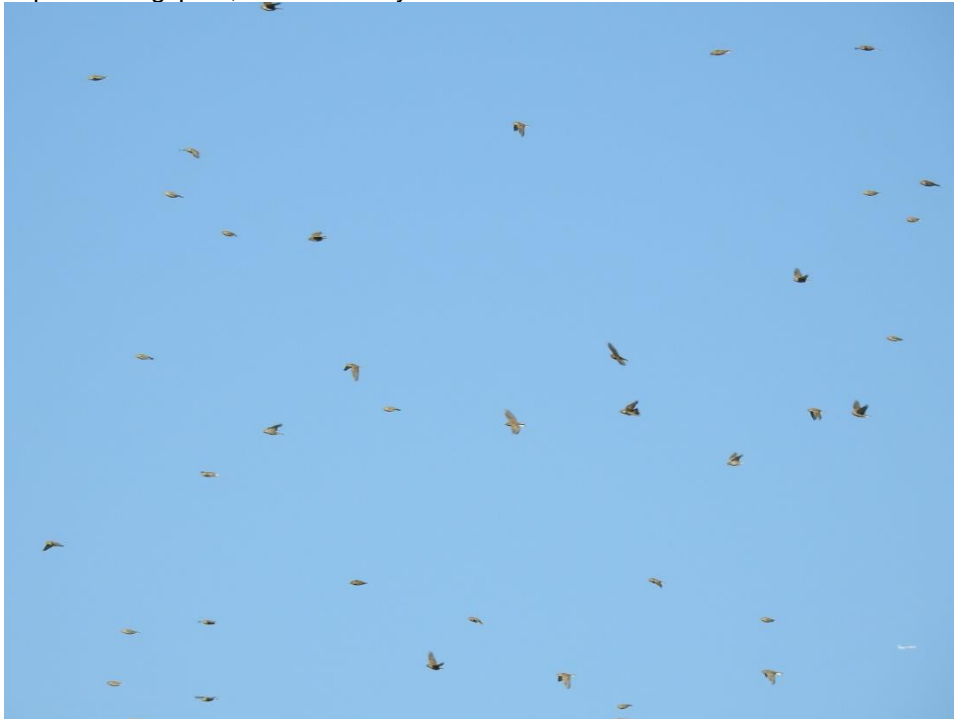
McCown's Longspurs, Milam County