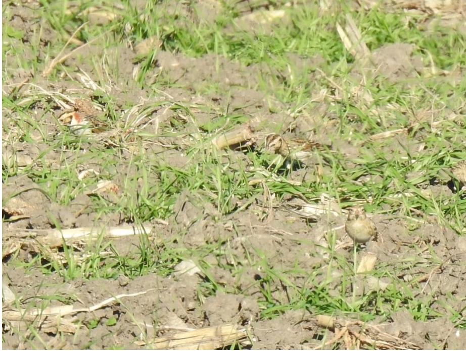
Lapland Longspurs, Milam County © Karen Pair

Longspur sp. – In Milam , where longspur sp. are rarely reported, a mixed flock included at least 2 Chestnut-collared Longspurs, 35 Lapland Longspurs, and 4 McCown's Longspurs in a plowed field near Clarkson 23 Dec (ph.† Karen Pair).