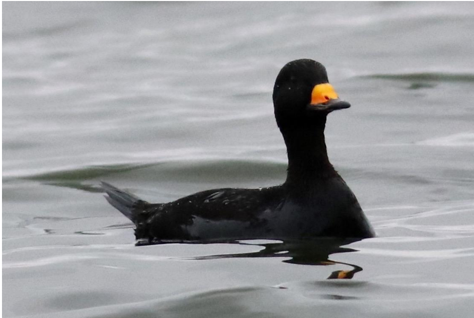
Black Scoter, Fairfield Lake S.P.