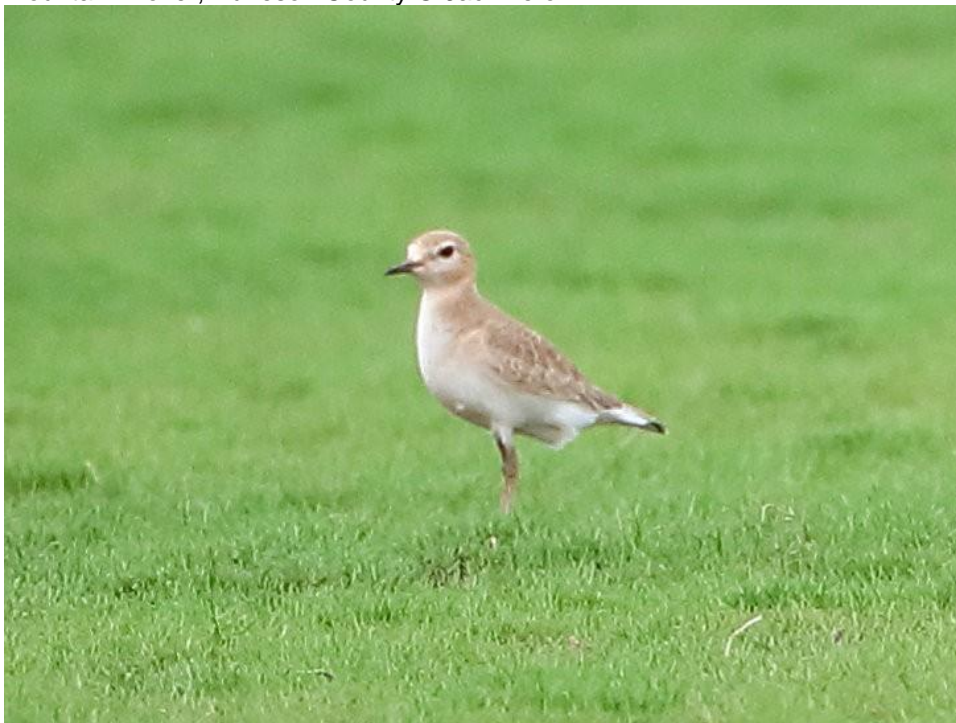
Mountain Plover, Burleson County © Mike Jones

Ruddy Turnstone – Certainly the strangest and most inexplicable sighting of the season is 6 Ruddy Turnstones found in a wooded area of College Station, Brazos 16 Feb (ph. Susan Miles). Unique for number, date, habitat, mild weather conditions, and far-inland location, were it not for a good photo it is unlikely it would have been believed possible.