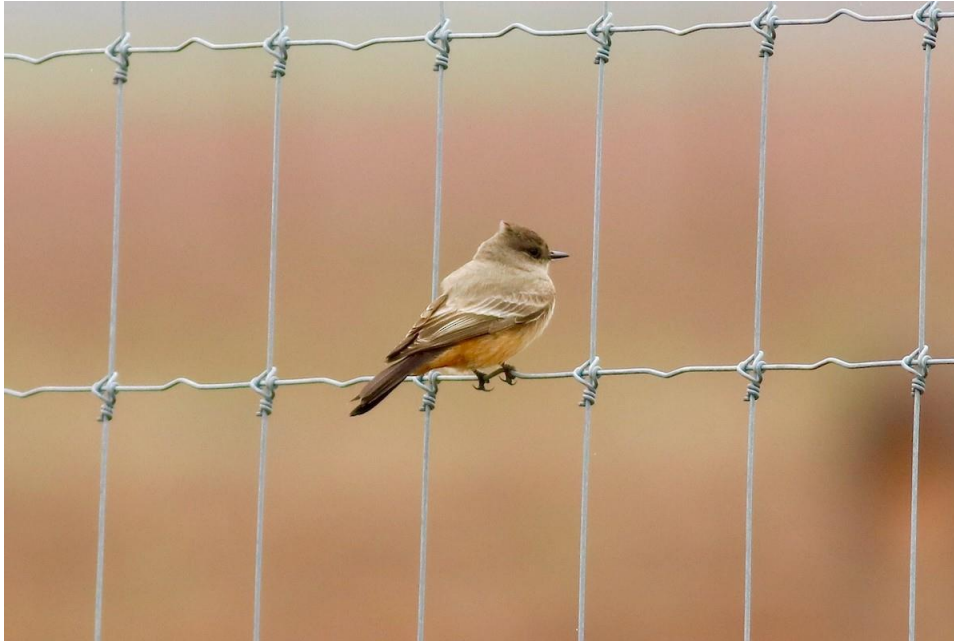
Say's Phoebe, Brazos County