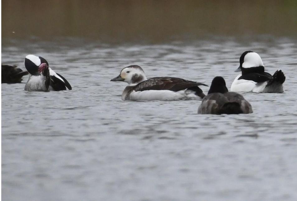
Long-tailed Duck, McLennan County