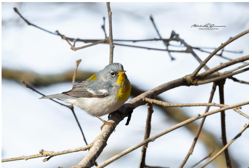
Northern Parula, Fayette County