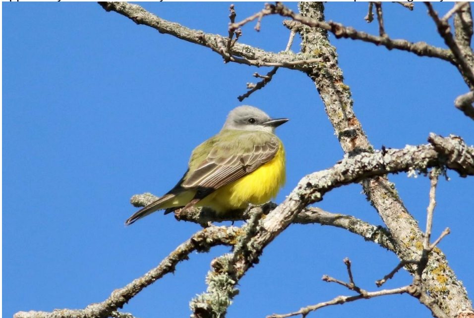
Couch's Kingbird, Finfeather Lake

Couch's Kingbird – Couch's Kingbird did not reach northward to Brazos until 2004 when it appeared at Country Club Lake. It was reported there again in 2005, but not thereafter until this fall. Then it apparently moved to nearby Finfeather Lake where it was reported regularly 13 Nov–15 Feb (m.ob.).