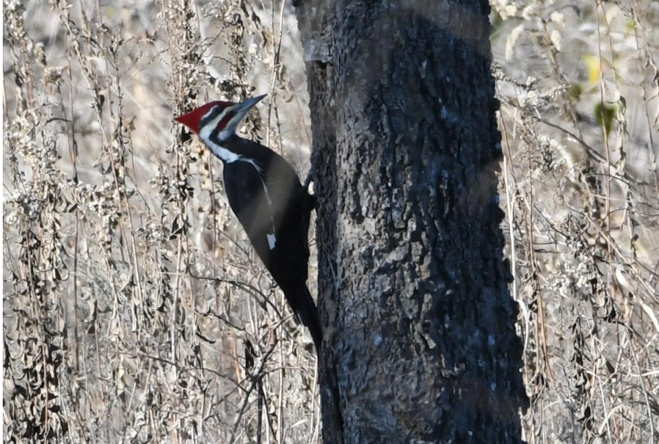
Pileated Woodpecker, Lake Waco

Crested Caracara – An unusually large gathering of 56 Crested Caracaras 25 Dec (Dennis Palafox) were in the Utley area, Bastrop .