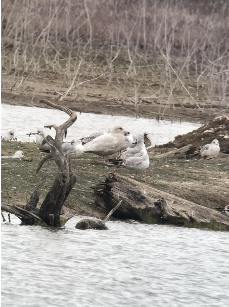
Glaucous Gull, Slough Pond