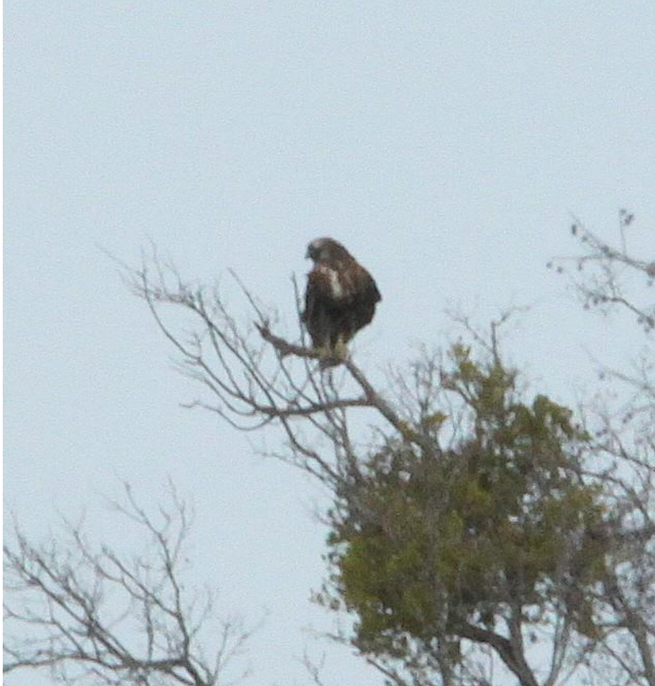
White-tailed Hawk, Bell County

White-tailed Hawk – A 5 th record for Bell, a White-tailed Hawk was along FM 2268 near Holland 25 Jan.