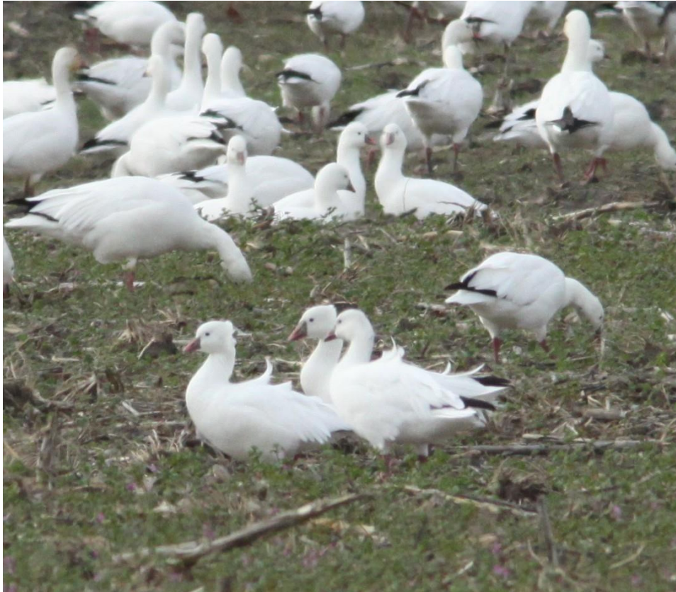
Ross's Geese, Bell County