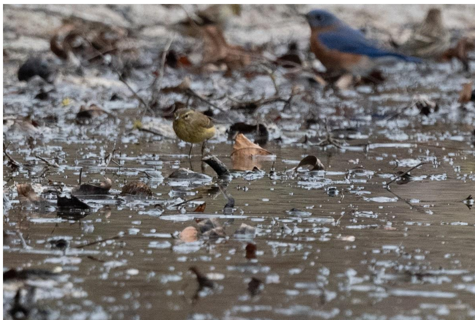
Palm Warbler, McLennan County