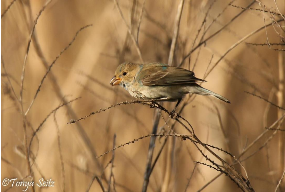
Indigo Bunting, Washington-on-the-Brazos S.P.