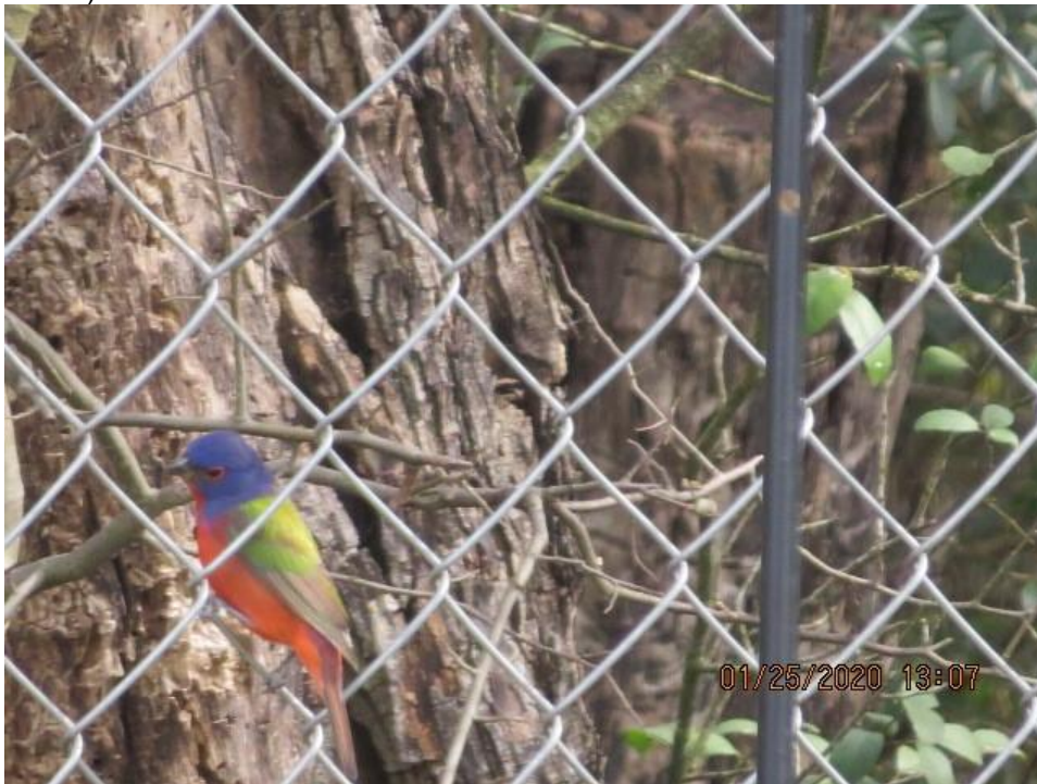
Painted Bunting, Bryan, Brazos County

Painted Bunting – Rare in winter in the Central Brazos Valley, single adult male Painted Buntings were seen at Bryan, Brazos 25 Jan and at Chappell Hill, Washington 20-23 Feb.