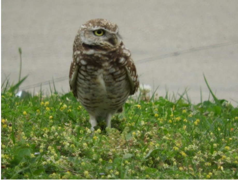
Burrowing Owl, 25 Mar 2018, Bowie County