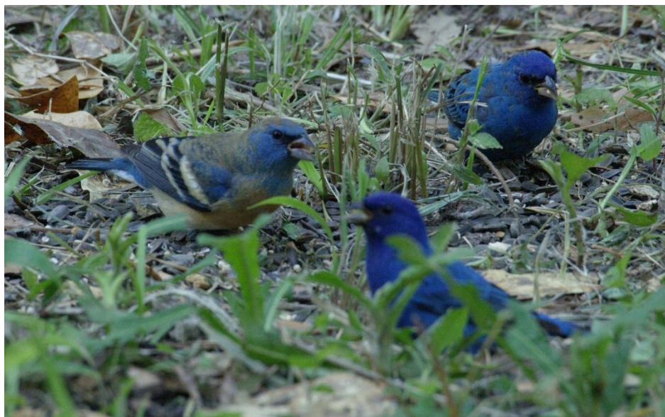
Lazuli Bunting, 26 Apr 2018, Liberty County.