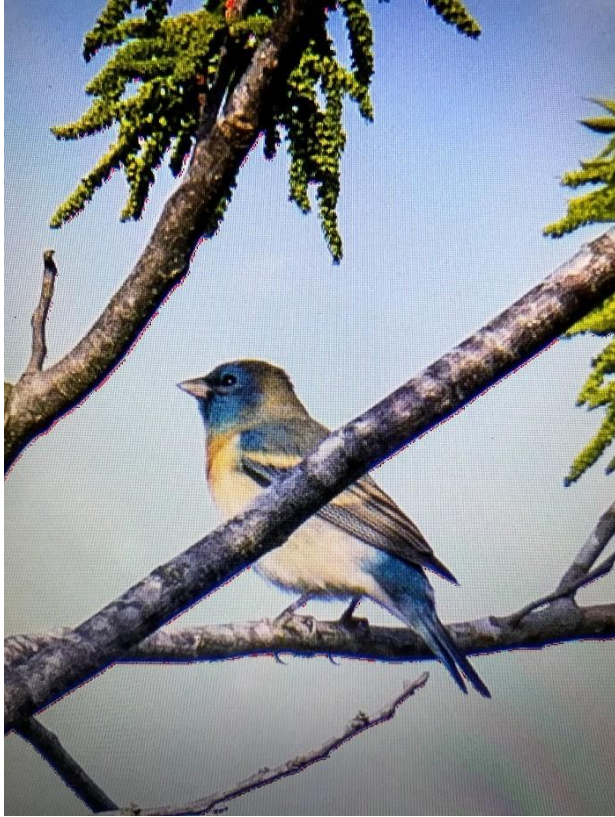
Lazuli Bunting, 28 Apr 2018, Washington County