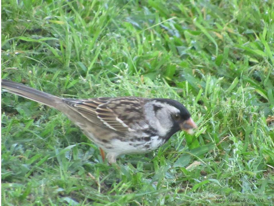
Harris's Sparrow, 22 Apr 2018, Brazos Co.

Bobolink – A good sighting for Newman Bottom, Lee is a Bobolink 1 May.