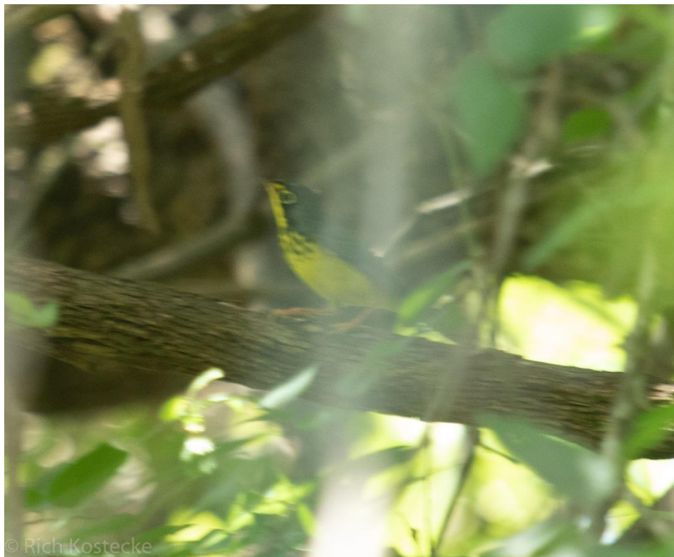
Canada Warbler, 12 May 2018, Lee County