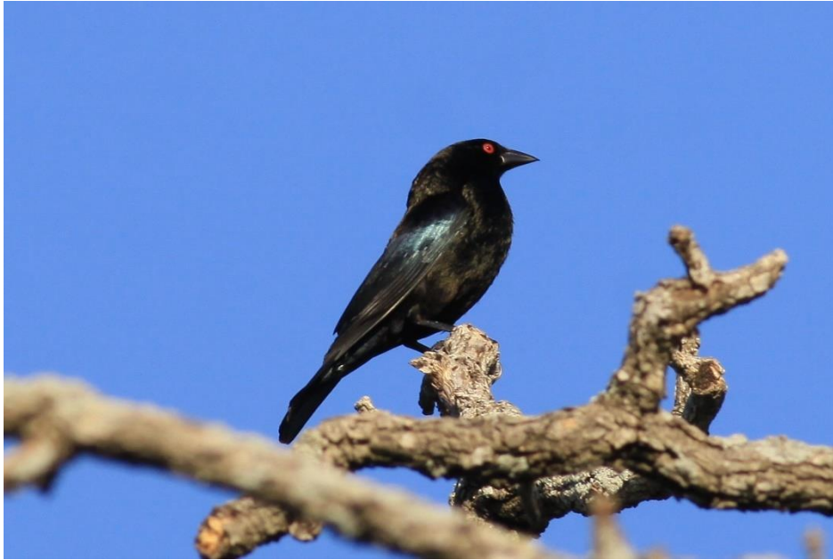
Bronzed Cowbird, 10 May 2018, Brazos Co.