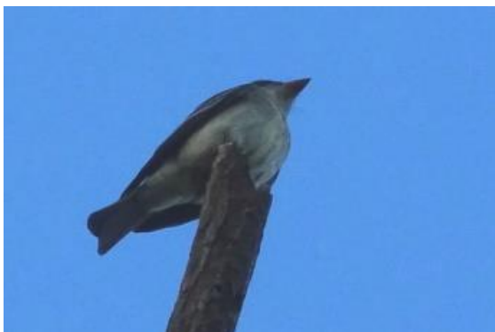
Western Wood-Pewee, 14 May 2018, Brazos County