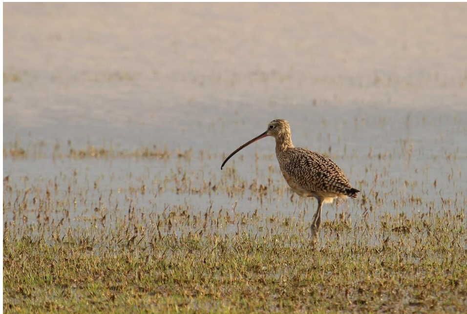
Long-billed Curlew, 28 Mar 2018, Brazos County

Long-billed Curlew – Unexpected in March in the Central Prairie, a single Long-billed Curlew was at Sims Cutoff Lane, Brazos 2 Mar and 28 Mar.