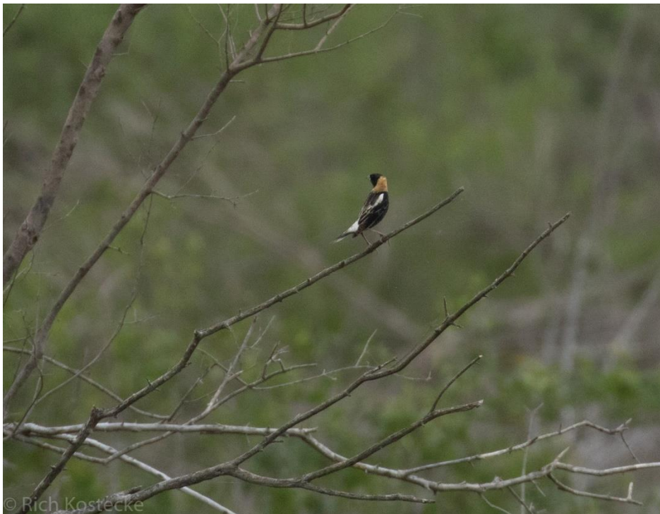
Bobolink, 1 May 2018, Lee Co.

Bobolink – A good sighting for Newman Bottom, Lee is a Bobolink 1 May.