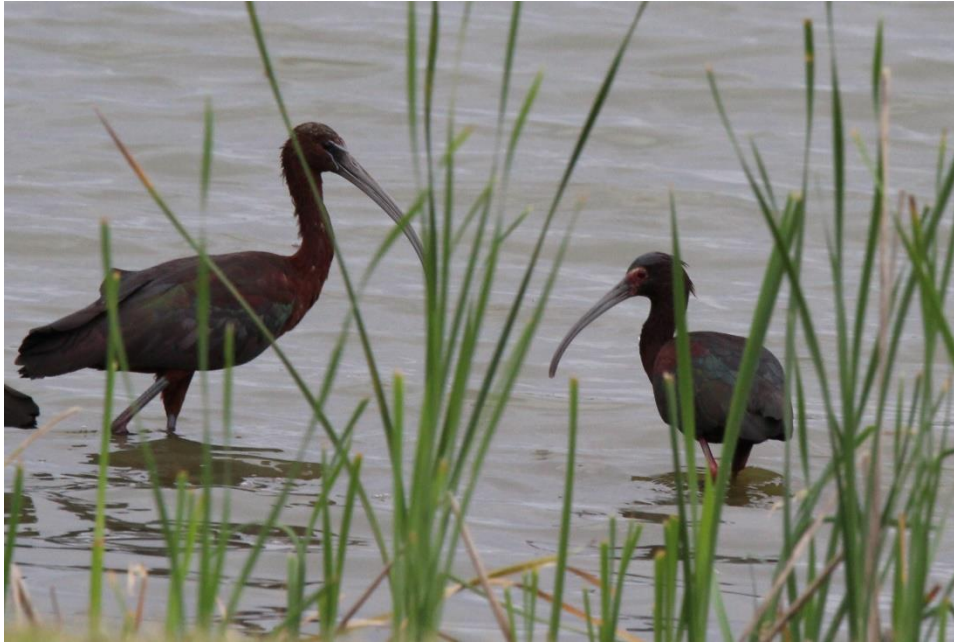
Glossy Ibis, 1 May 2018, Brazos County