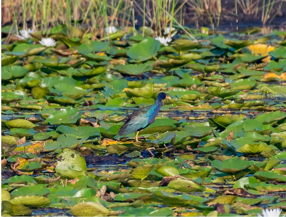
© Herb Thorn, 26 Aug 2018

American Coot – A new high for Brazos is a count of 550 American Coots in flooded fields at Sims Lane 18 Oct (Simon Kiacz).