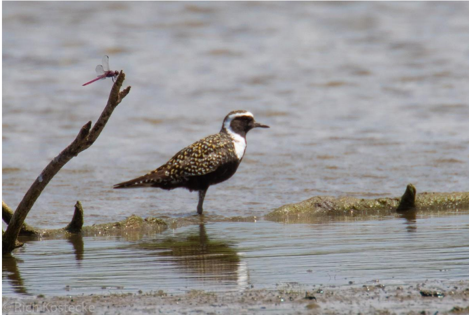
© Rich Kostecke © Rich Kostecke

Snowy Plover – Only the third record for Washington and the first photo-documented are 6 Snowy Plovers 8-9 Sep (ph. Byron Stone) at Overlook Park, Lake Somerville.