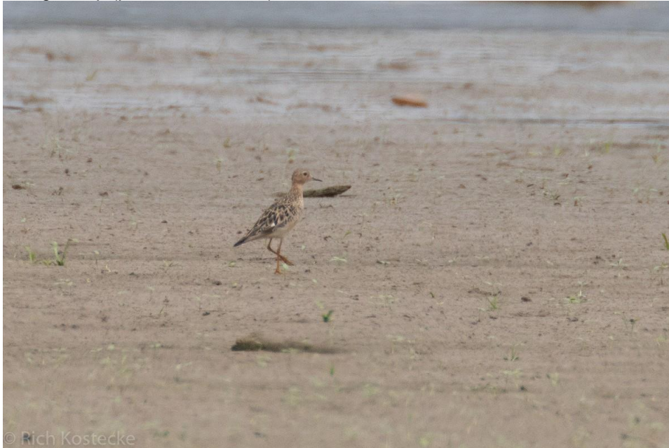
© Rich Kostecke © Rich Kostecke

Buff-breasted Sandpiper – Twelve Buff-breasted Sandpipers at Lake Somerville is a first record for Lee 4 Aug-3 Sep (ph. Rick Kostecke).