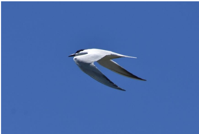
Gull-billed Tern

Gull-billed Tern – Out of place was a Gull-billed Tern strangely inland at Richland Creek W.M.A. after storms 30 Apr. This is a first county record for Freestone .