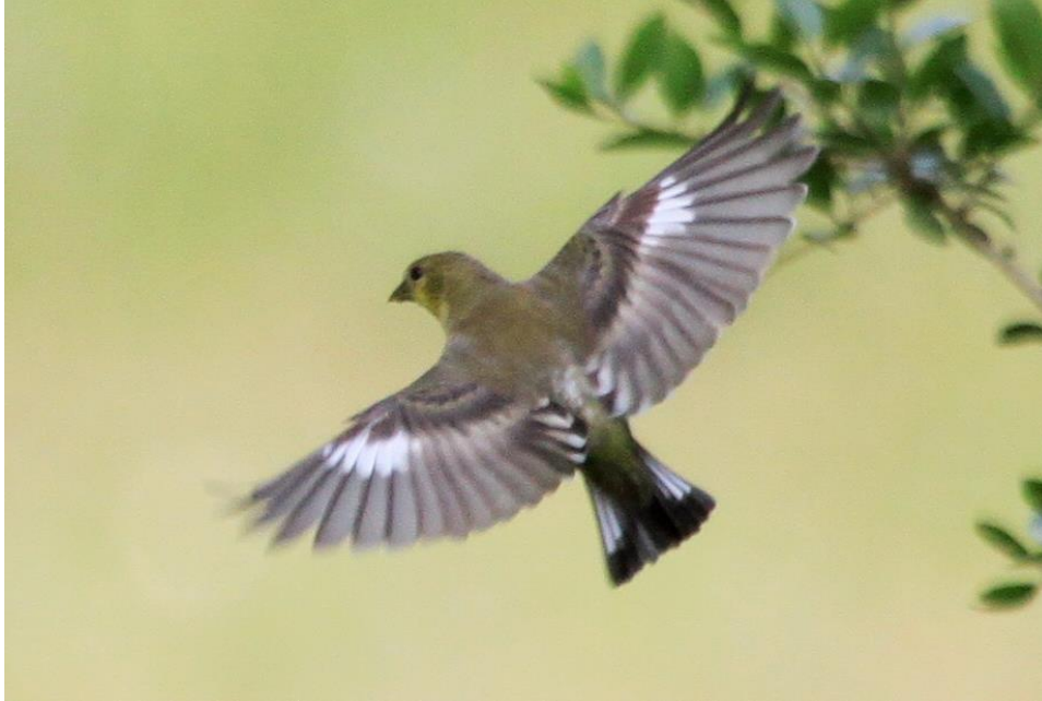
Lesser Goldfinch