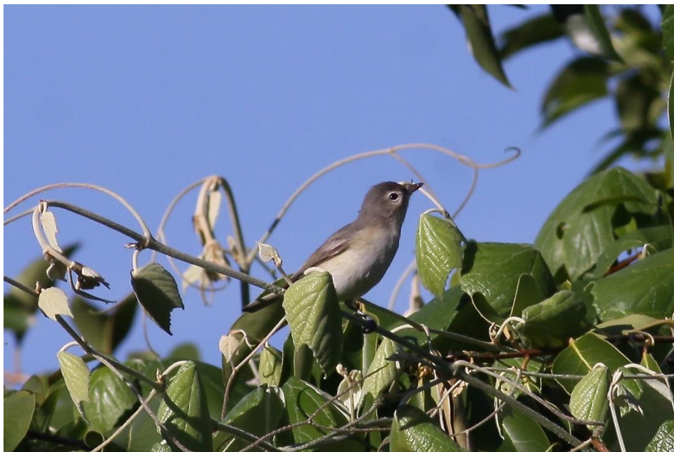
Bell's Vireo