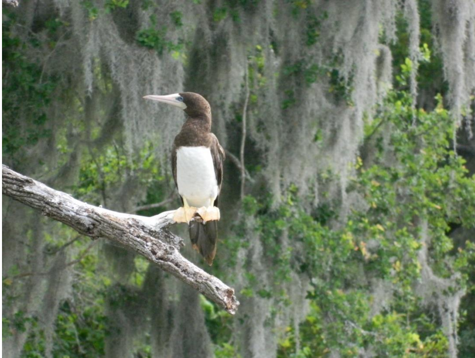
Brown Booby