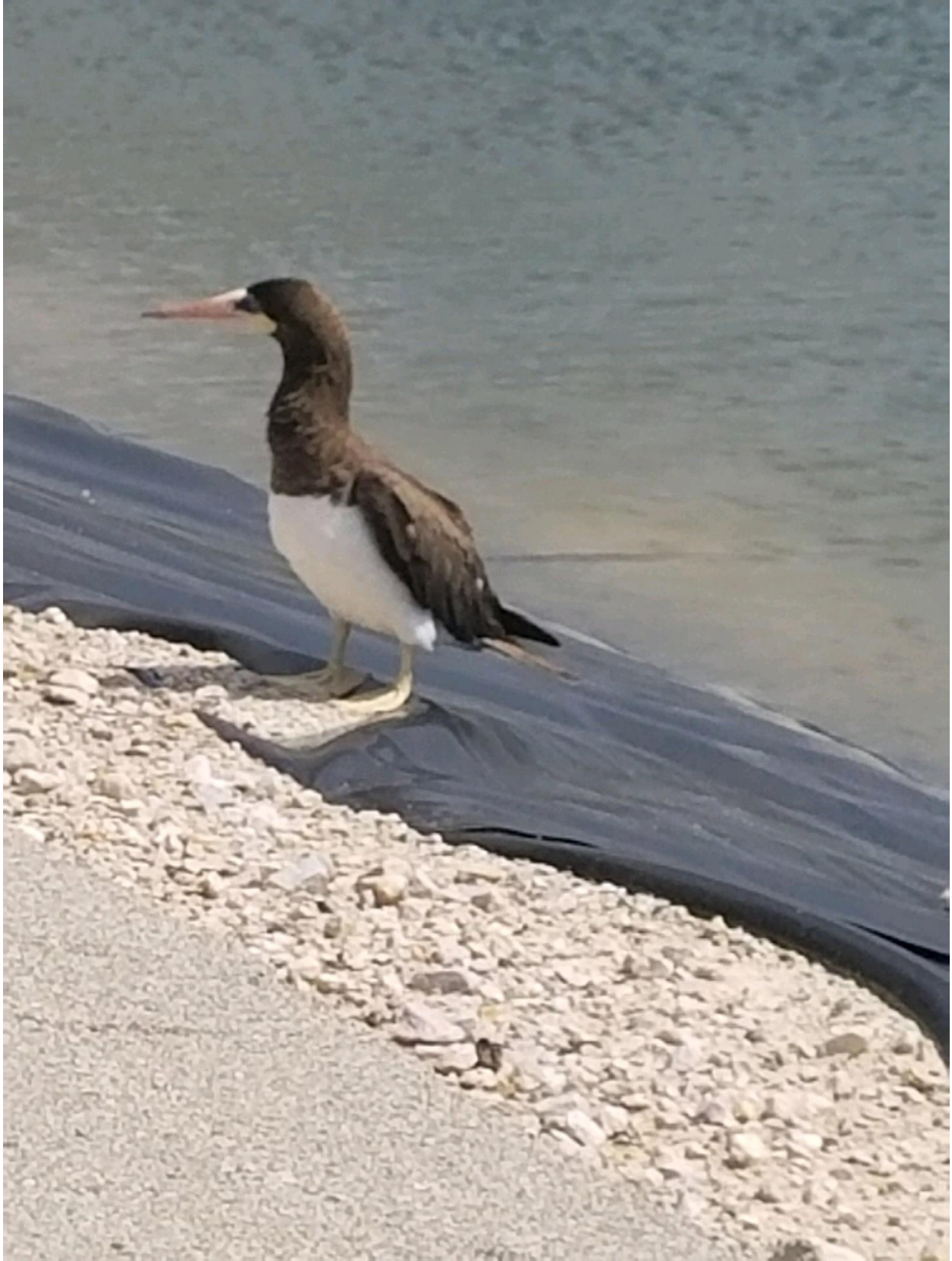
© Amy Kocurek, Jasper County, 11 September