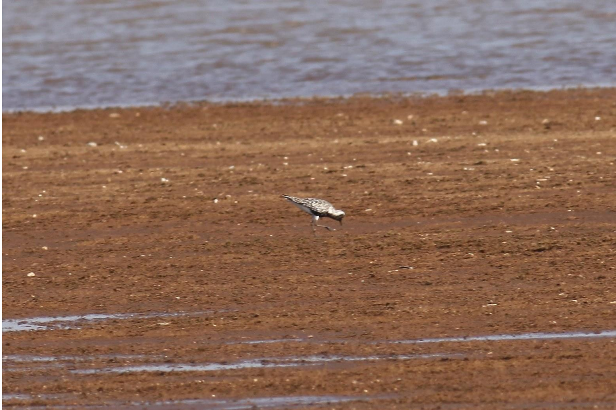
Burleson County, 31 August