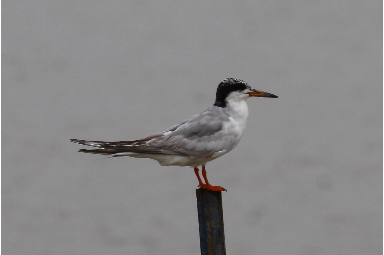
Lake Bryan, 3 August