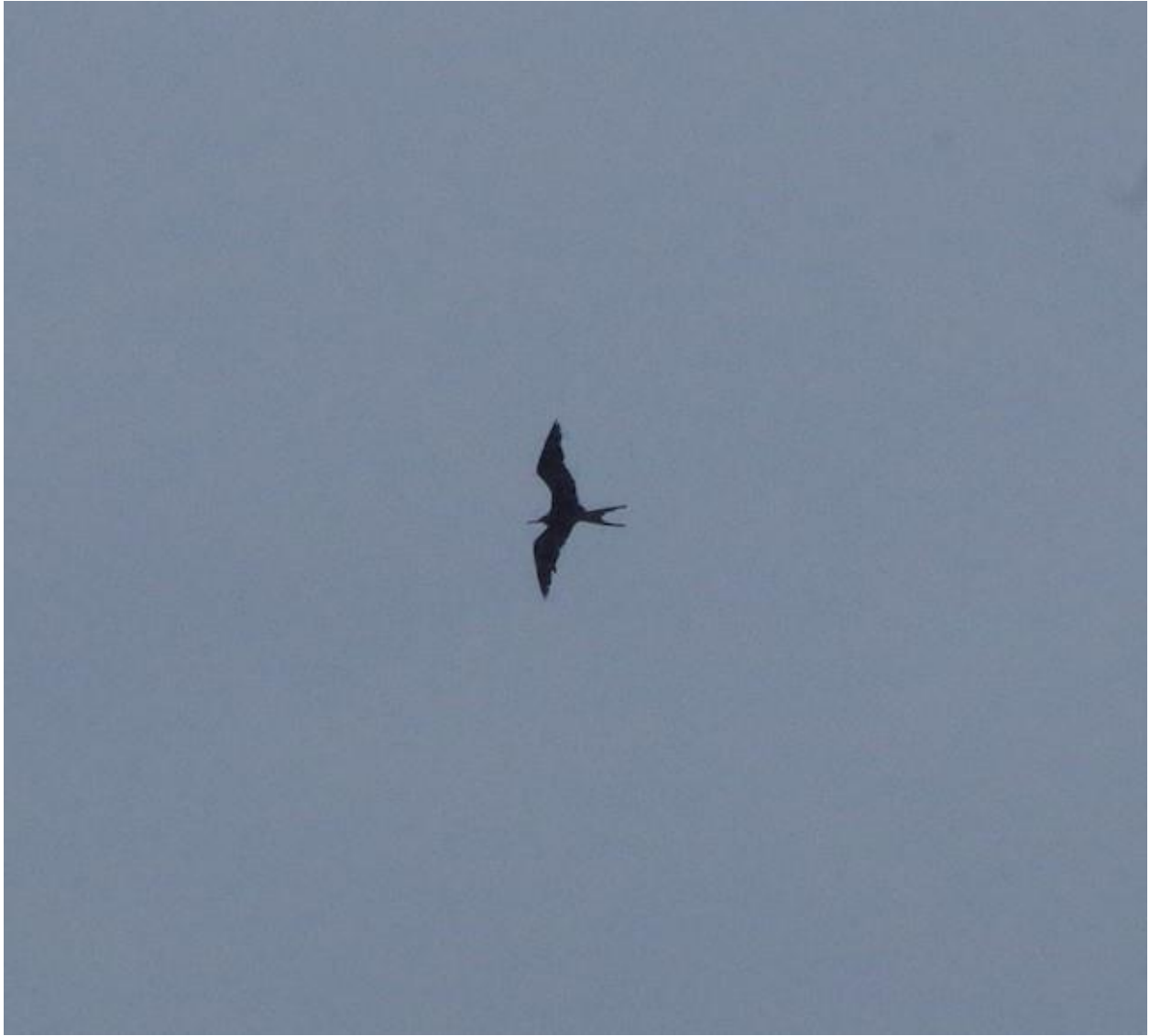
Gibbons Creek Reservoir, 26 August