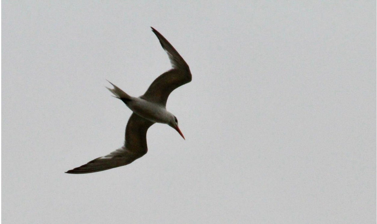
Brazos County, 28 August