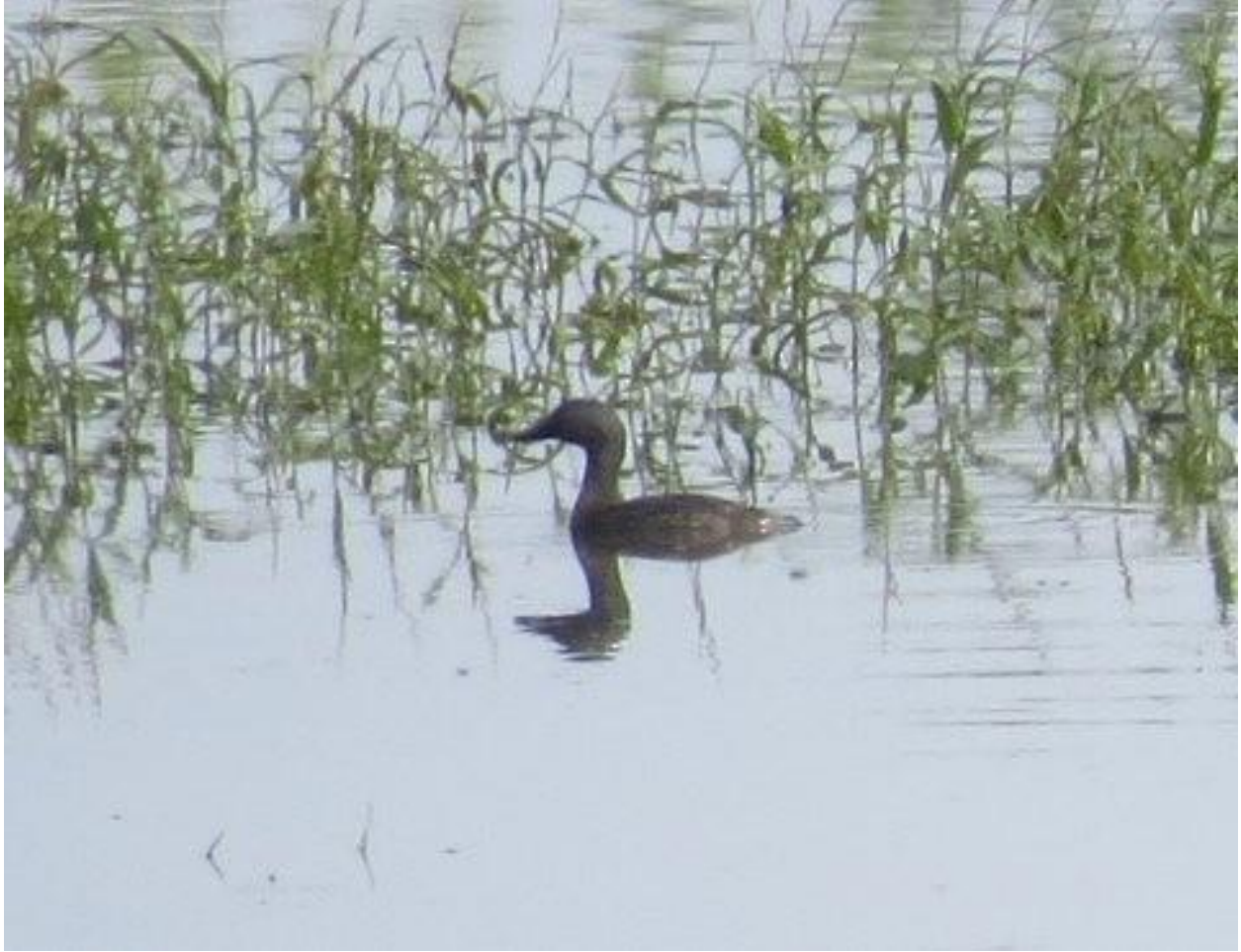
Brazos County, 2 September