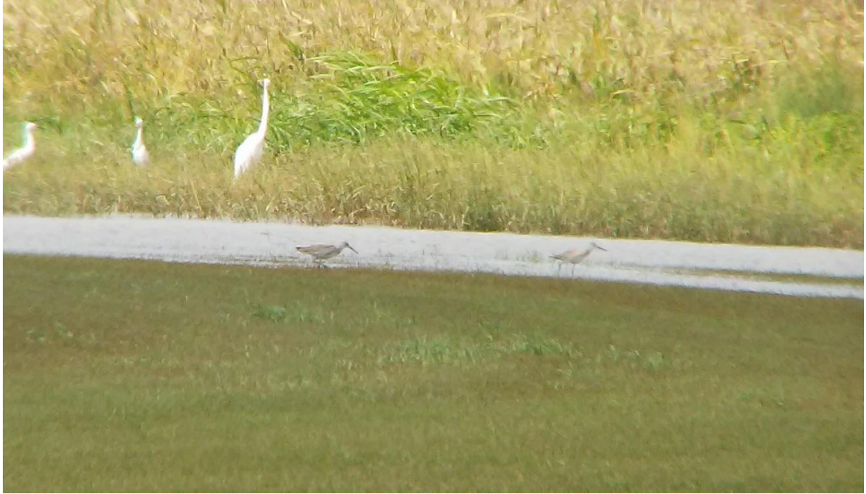
Brazos County, 29 August

Wilson's Phalarope – A bit early and a high count, 40 Wilson's Phalaropes were at Pitts Road pond, Brazos 16 Aug. Phalaropes remained in the area through 29 Sep.