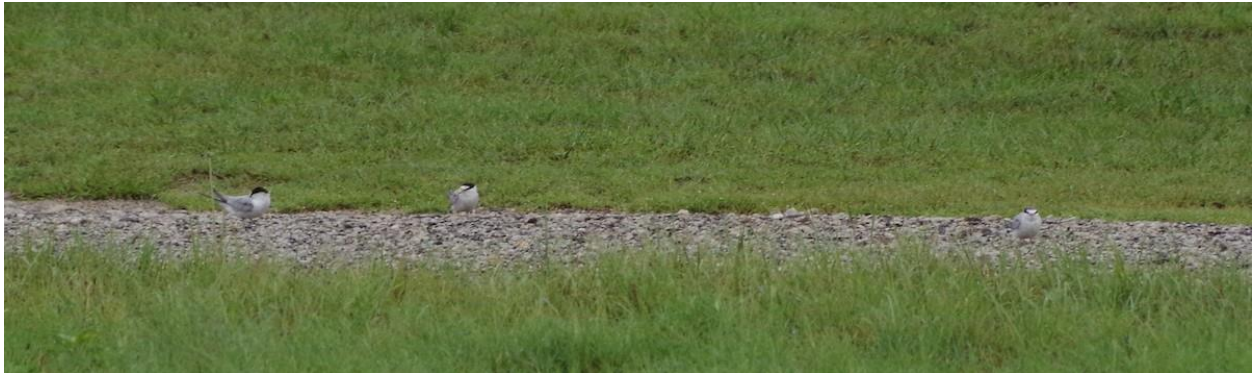
Gibbons Creek Reservoir, 26 August