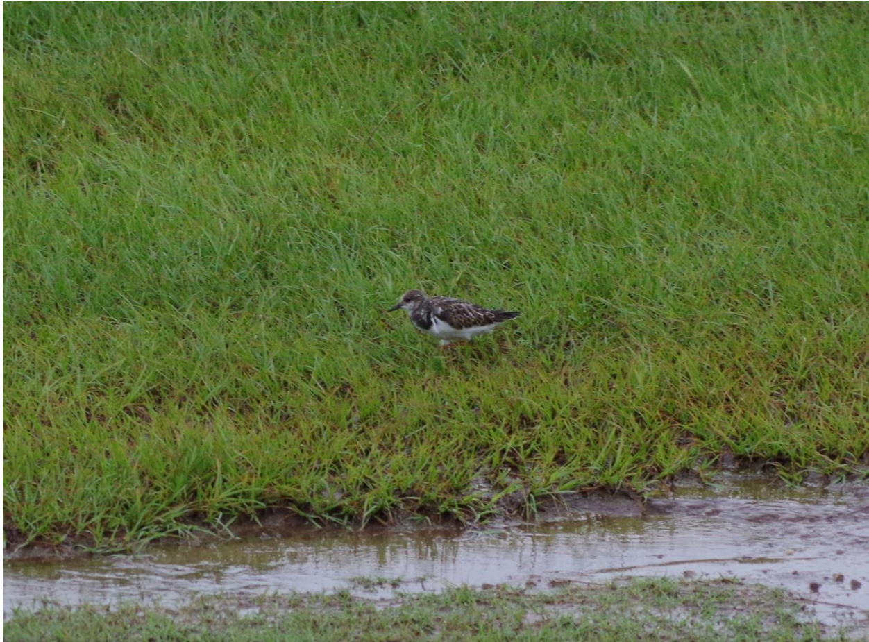
Gibbons Creek Reservoir, 26 August