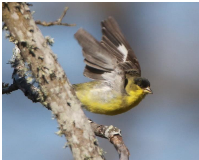
17 Jan 2018