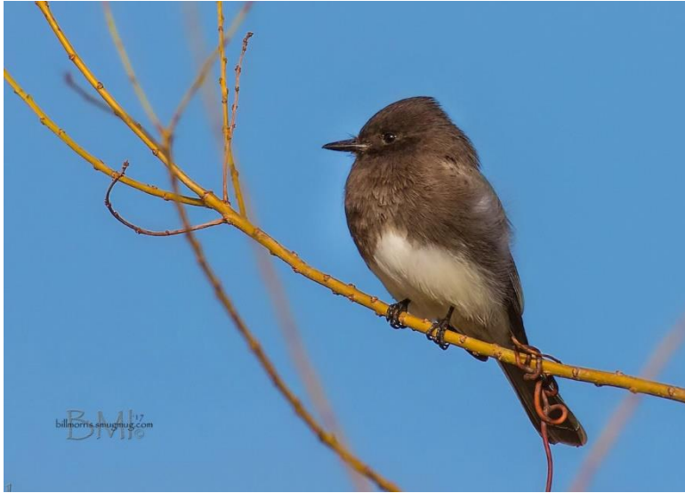
21 Dec 2017