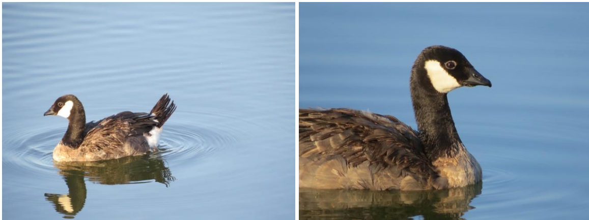
at Carter Lake