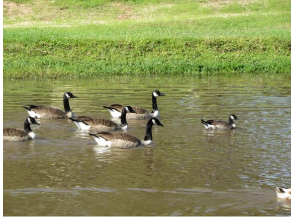
© Gus Cothran at Woodcreek Subdivision