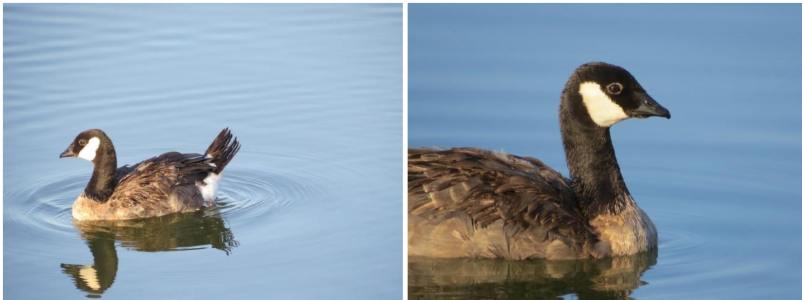
at Carter Lake