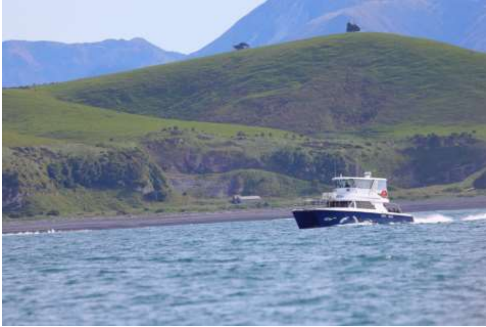
The boat heading for dolphins