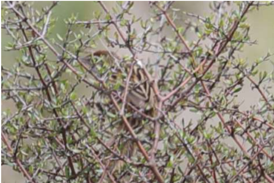
South Island subspecies of New Zealand Fernbird

Our next stop is Sinclair Wetlands, a favorite of mine although often frustrating because of high winds that keep the birds hidden in the flax. This time it is calm. I know from my readings that the New Zealand Fernbird can be found here, although not by me in my prior two visits. Nor have I found the fernbird elsewhere. I study the app on my iPhone for details of what to look for and barely get the phone back in my pocket when a fernbird flies past me and perches close by for two seconds in amazingly sharp view. I quickly draw my camera from its holster and take multiple shots of the bird that meanwhile has secluded itself in shoulder-high bushes. The New Zealand Fernbird, a lifer, is barely discernable in my best photo, but I can make out the distinctive rufous crown, prominent white supercilium, dark eye, and dark streaking on its back, all characteristic of the South Island subspecies.