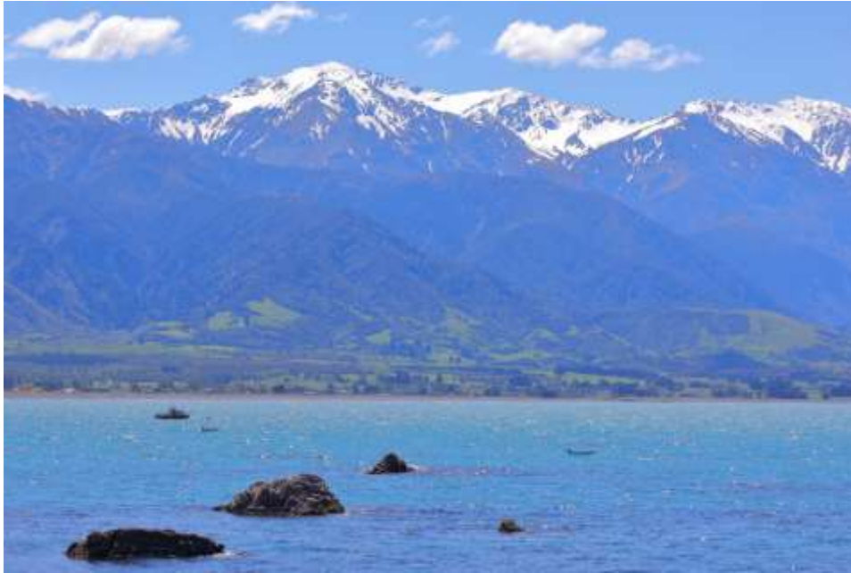
Return ride to dock