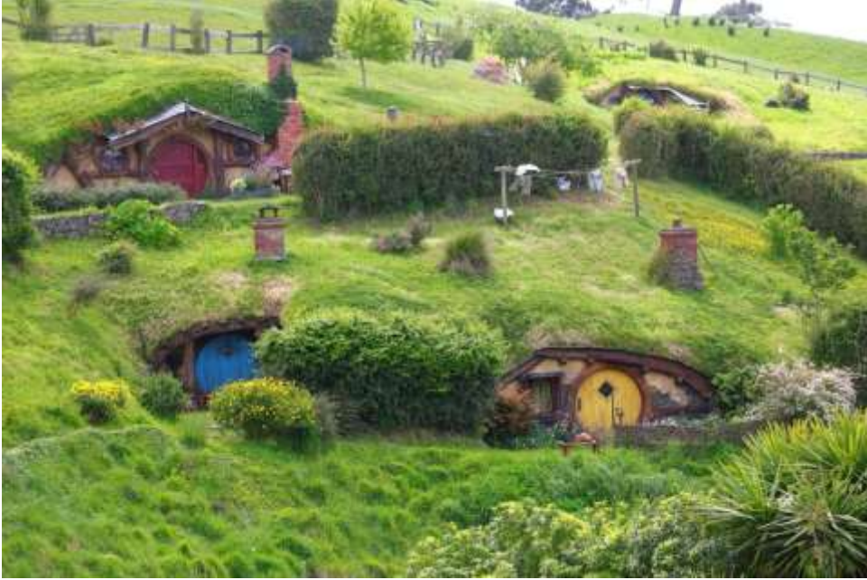
Fake Hobbit homes are only facades