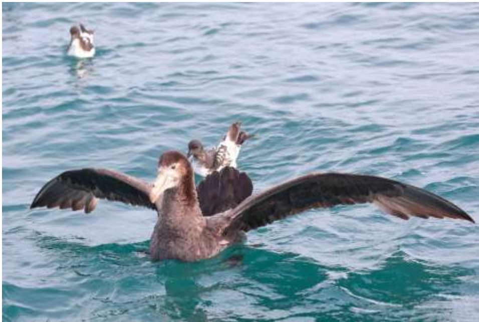
Northern Giant-Petrel with Cape Petrels in background