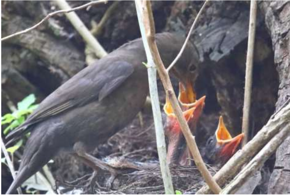
Female Eurasian Blackbird