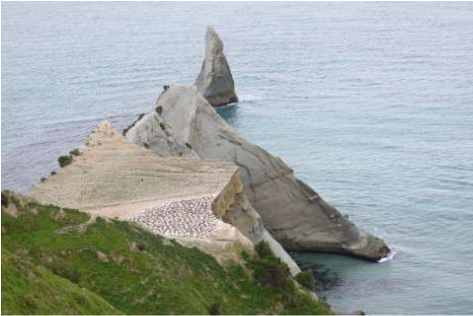
Second nesting colony