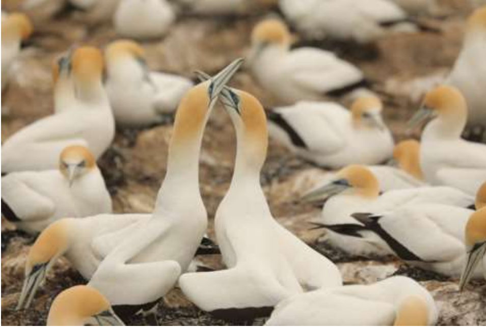
Crossing bills, a mating ritual