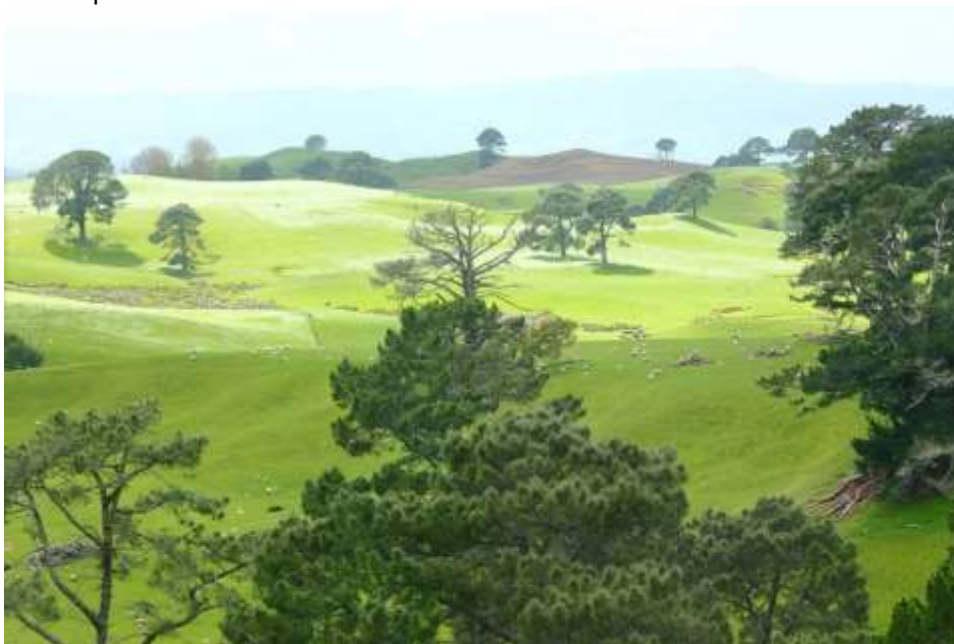
Hobbiton is surrounded by sheep pastures

To my surprise, many in our group say they have not seen any of the Hobbit or Lord of the Rings movies. Our guide tells us that is typical of the groups she leads. The movie set is in the midst of a huge sheep farm. Hobbiton is in a tree-surrounded hollow in the rolling farmland. We walk on paths through the movie set miniature village, tiny homes designed for the little hobbits, complete with vegetable gardens, local crafts, and clothes lines supporting miniature clothes. As real as everything looks, it is all fake. The doors to the homes enter to the dirt hill. Even the most prominent tree is fake, made up of thousands of fake plastic leaves and metal branches.