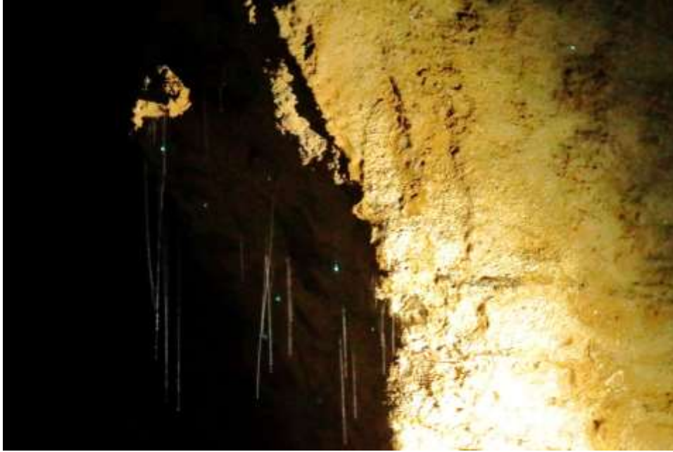
Glowworm strings and a few lights