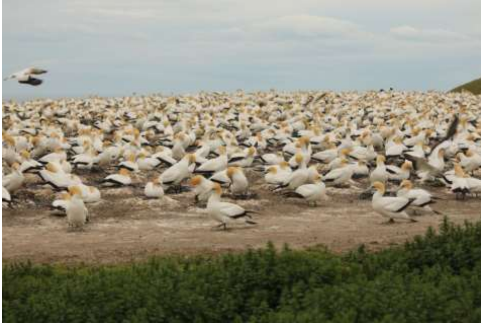
Third nesting colony

At this third colony, we can walk within a dozen feet of the gannets. Here we can observe mating rituals, males attracting females by bringing nesting material, copulation, sitting on an egg, and other intimate behaviors. I also take a close-up photo of the way you can separate this Australasian Gannet from its Northern Gannet cousin. They are nearly identical, but look at the vertical black throat line, which is absent on the ones we watched at the colony on the Gaspé Peninsula of Quebec and at Cape St. Mary's in Newfoundland.