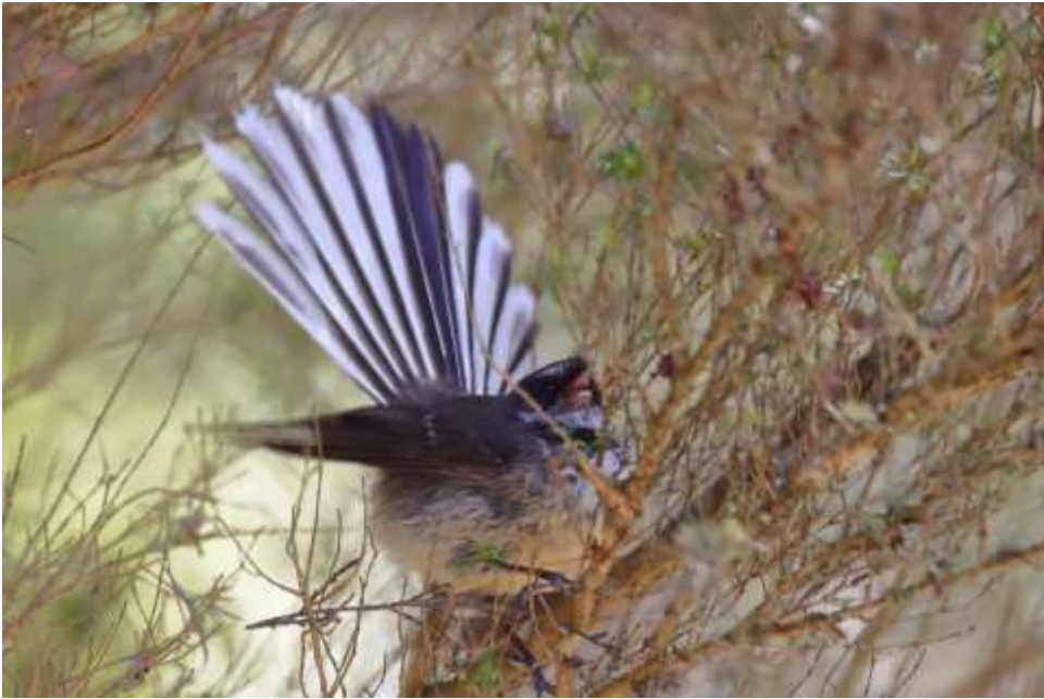
New Zealand Fantail