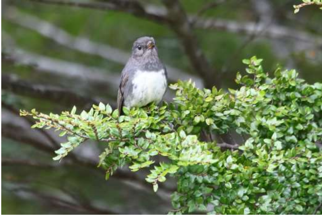
South Island Robin

When we reach Homer Tunnel, we notice many changes. The stoplight controlling the one-way traffic through the tunnel has been moved a quarter mile from the entrance, and the roadside and parking lot are cordoned off with signs prohibiting stopping because of avalanche risk. This is where we always found the Kea with its reputation of pecking at tires and chewing on windshield wipers. I guess we will have to look for them elsewhere. Rain downpours on the west side beyond the tunnel as we slowly descend on hairpin curves to sea level.