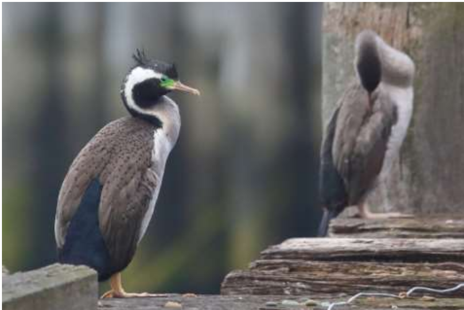
Adult and juvenile Spotted Shag