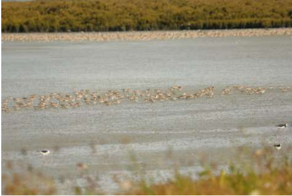
Bar-tailed Godwits in background; Red Knots in foreground