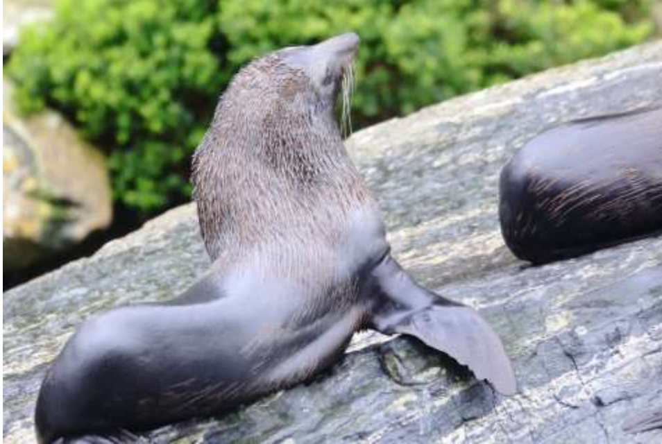
New Zealand Fur Seal

Back on land and in our RVs we have a two-hour drive back to our campground. Fortunately, we finally see the Keas, one while waiting for the stoplight at the west side of Homer Tunnel and another at Monkey Creek. A Kea is a parrot that lives in cold alpine habitat, often devoid of trees.