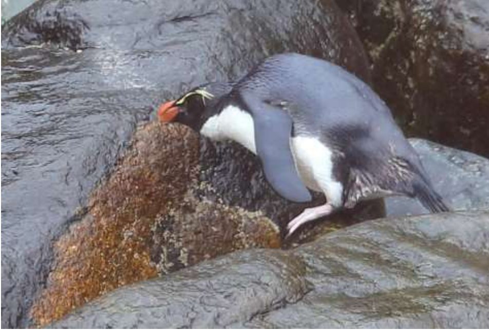
Fiordland Penguin caught in mid hop

We reach the end of the fiord where it opens to the Tasman Sea, named after the Danish explorer who in 1642 was the first European to see New Zealand. In the open sea I find Sooty Shearwaters, a Westland Petrel, and an albatross, perhaps Royal.