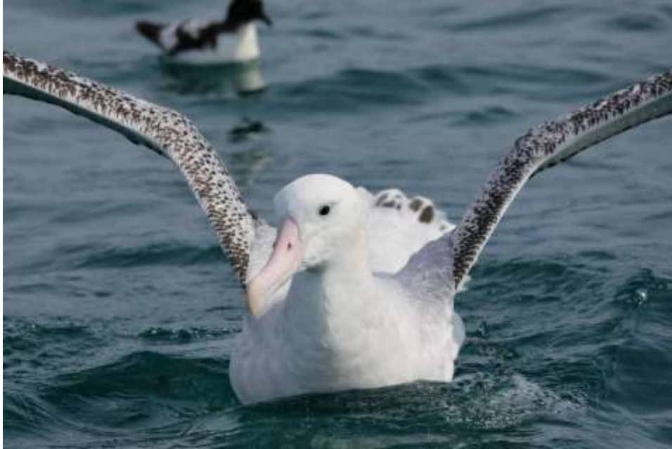
Wandering Albatross has a wingspan of over 10 feet