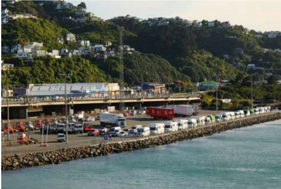
Part of our caravan still lined up on the dock

Now that we are almost out of sight of either island, I begin seeing petrels, shearwaters, and albatrosses. However, the birds are mere dots in the vast ocean, an aquatic equivalent of a needle in a haystack. The next photo I took with my 400mm lens. Do you see the bird? A blow-up is shown below.