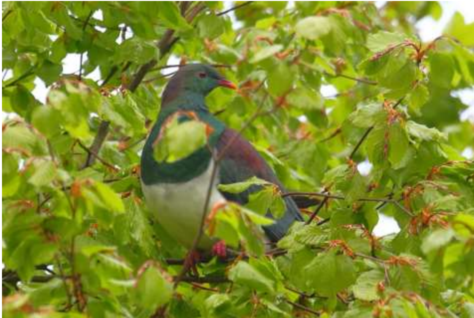
New Zealand Pigeon