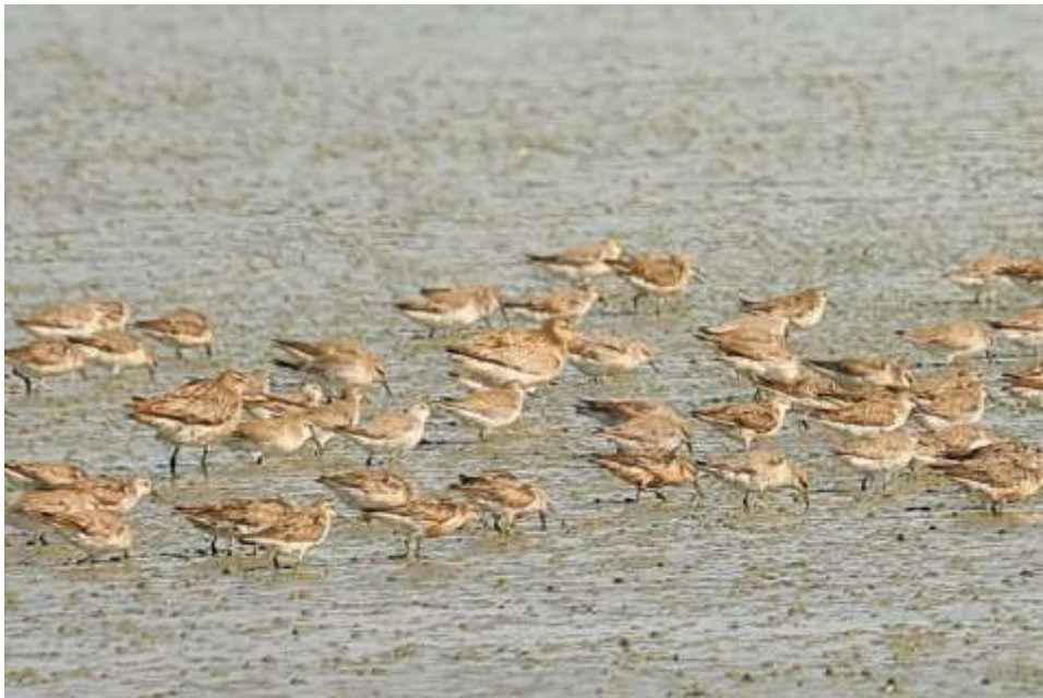
Blow-up of Red Knots in previous photo, plus a few godwits