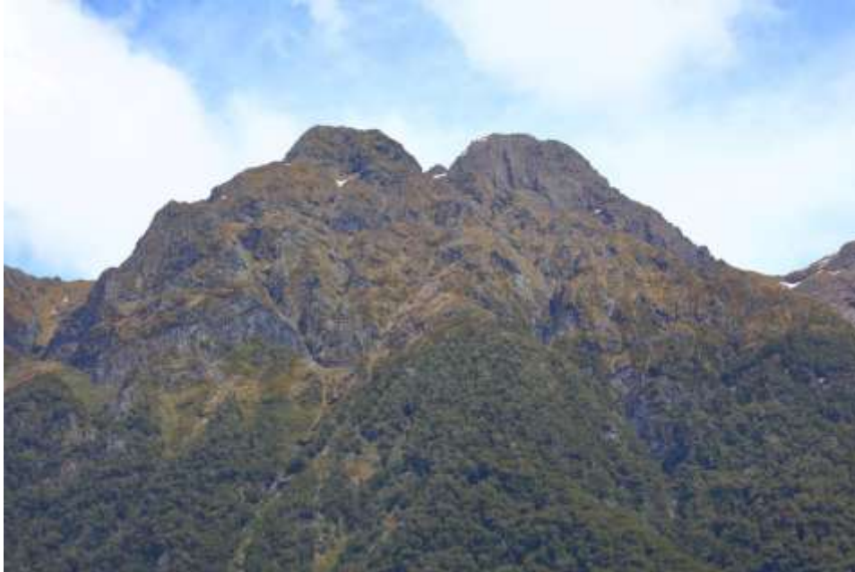
Mountaintop where New Zealand Falcon soared

Ed spots a tiny bird chasing through the dense riparian understory below the deck. It is a South Island Robin, another endemic species. At Knobs Flat, we have a panoramic view of the surrounding mountains. While viewing the unfurled ribbon of a thin waterfall pouring from the mountaintop to the Eglinton Valley below, I catch a New Zealand Falcon—rare and endangered—soaring above the barren rocky mountain peak. We hike into the forest, densely wooded with moss encrusted fallen trees and a high canopy where a Tui pair chases and another Bellbird rings.