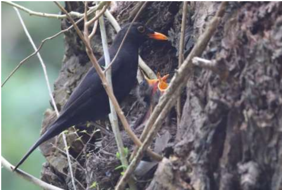
Male Eurasian Blackbird