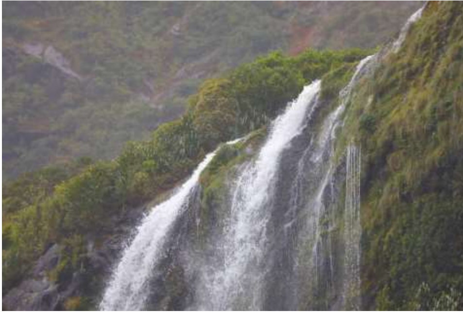
Dense vegetation clings to steep slopes, watered by nearly daily rain

The captain has sighted penguins resting on narrow ledges and rocks at the edge of the fiord. I am in good position to take photos and when the captain aims the ship closer, my long lens gives me good close-ups, something those with cell phones cannot do. These are Fiordland Penguins, also called Fiordland Crested Penguins, a rare species. I see a few standing together and another hopping from rock to rock. I also photograph some at a later enclave, totally over a dozen today.