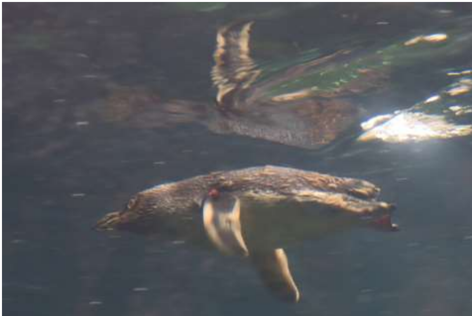
Swimming Little Penguin