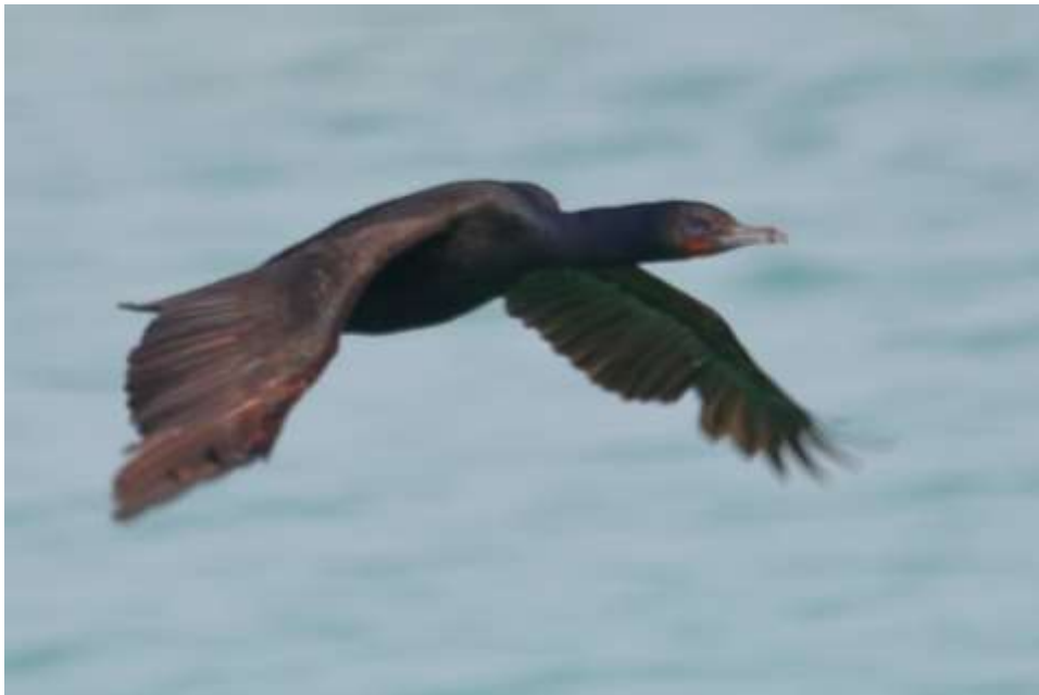
Stewart Island Shag (black form)