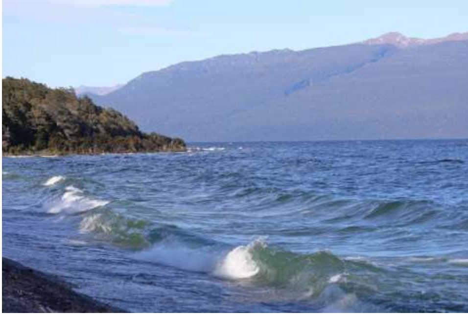
Lake Te Anau

At McKay Creek, I photograph a female Yellowhammer. We look out onto a tall grass meadow and although we cannot see the river, we can follow its serpentine route by watching Black-fronted Terns hunting over its waters.