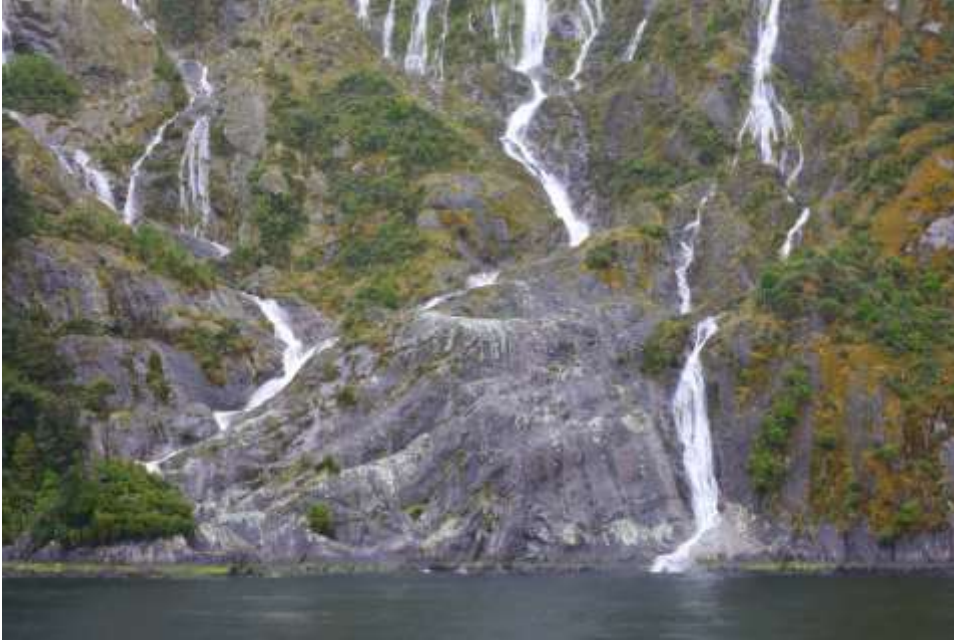
Finding a path from barren mountaintop to sea