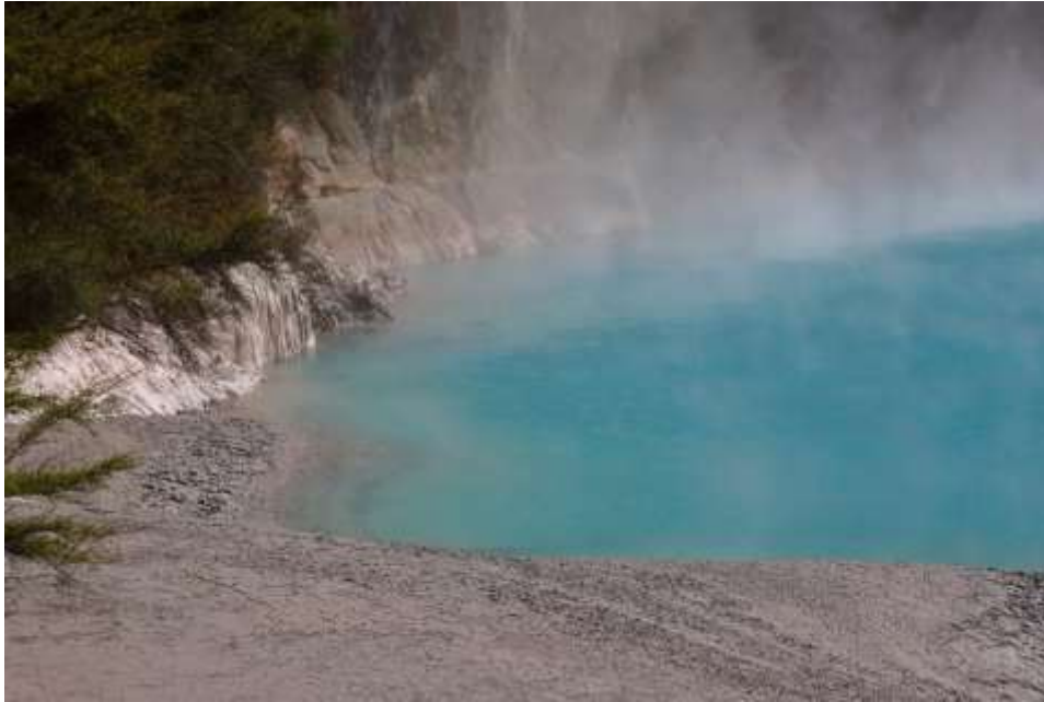
“Gateway to the Inferno”