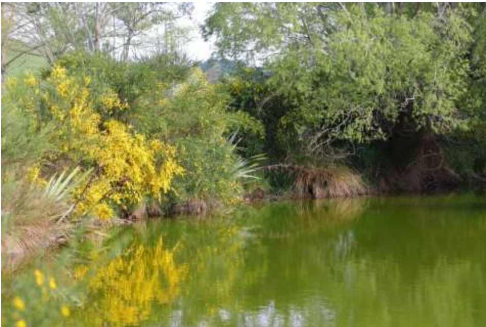
Mandeville rest area

I pull off at a rest area near Mandeville that turns out to be a pretty site with ponds of ducks and a flock of Lesser Redpolls constantly flying from tree to tree. A Eurasian Skylark is putting on an aerial show above the pasture across the highway.