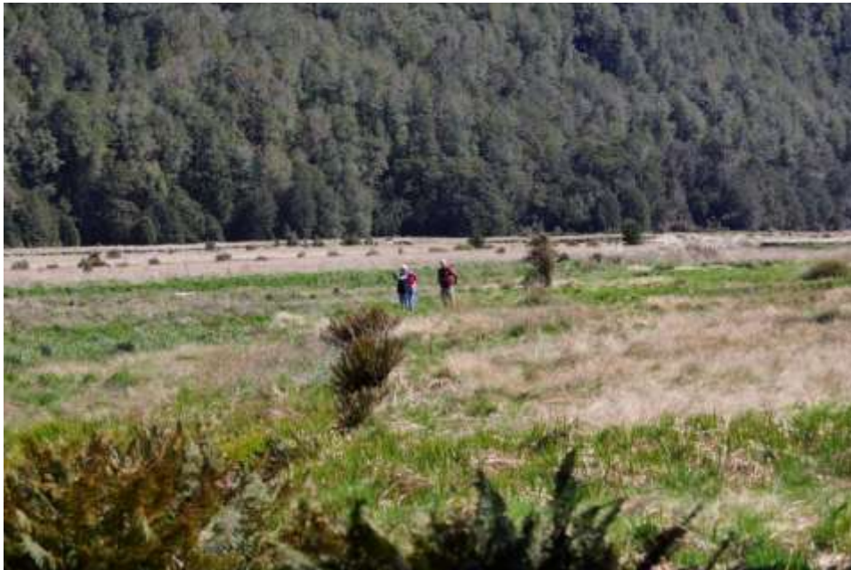
McKay Creek, Fiordland National Park

At McKay Creek, I photograph a female Yellowhammer. We look out onto a tall grass meadow and although we cannot see the river, we can follow its serpentine route by watching Black-fronted Terns hunting over its waters.