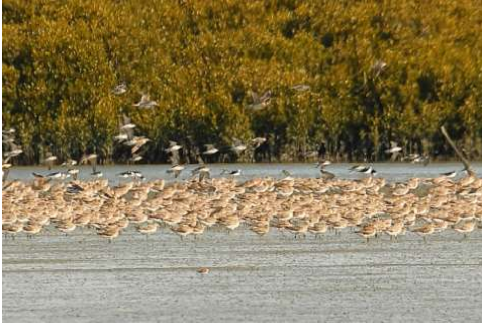
Bar-tailed Godwits in previous photo