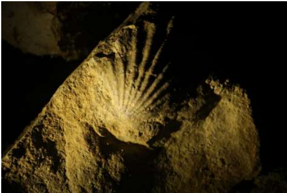
Fossilized seashell in limestone