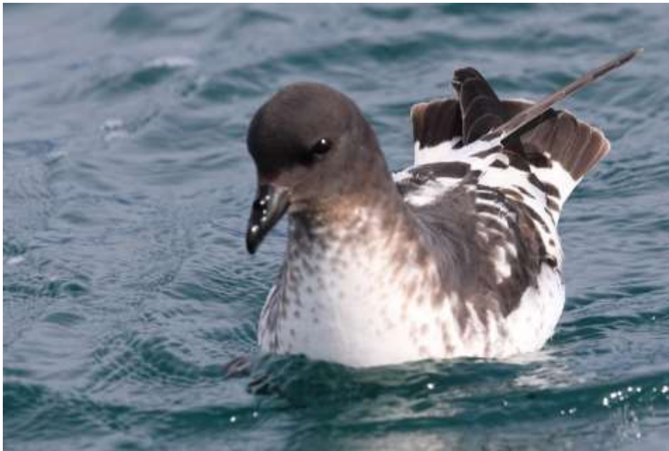
Cape Petrels, sometimes called Cape Pigeons because of the resemblance, are common