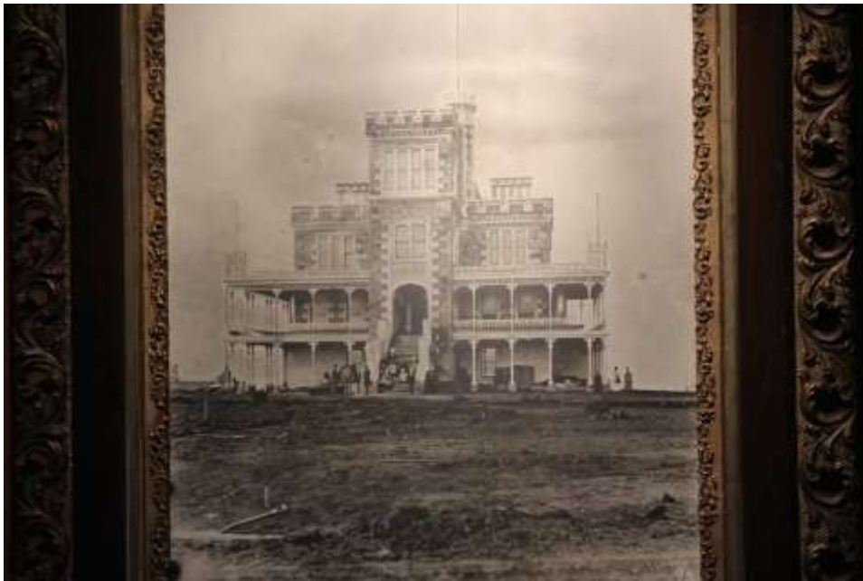
Circa 1870s photograph of Larnach's home

While still under construction, Larnach solicited a traveling photographer to photograph the home. The rare old photo even shows the workman's shovel lying on the bare earth in the foreground. I took a photograph of the photograph and also of an aerial view that shows the restored castle and surrounding gardens.