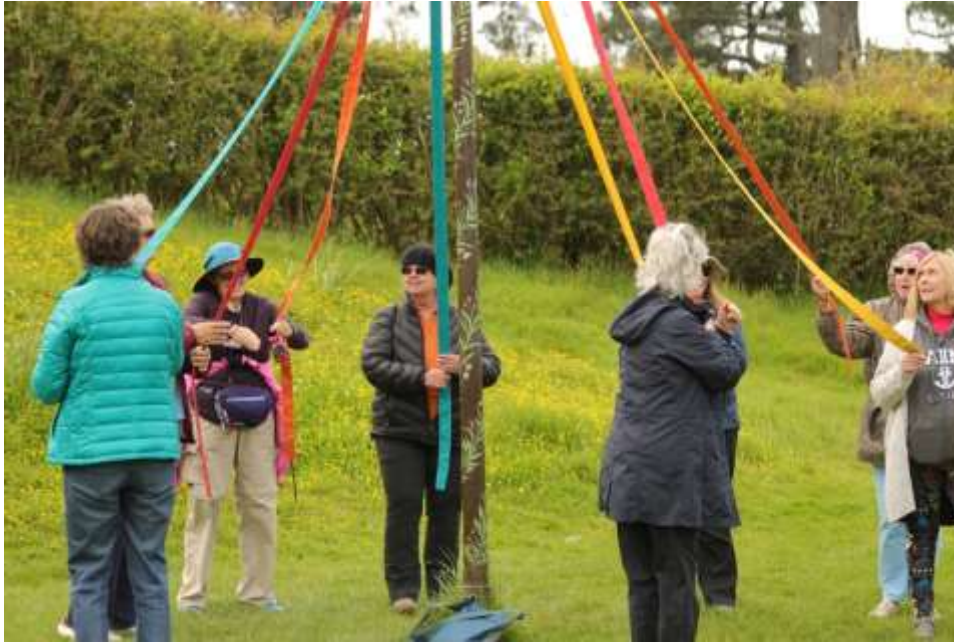
Women go round the Maypole