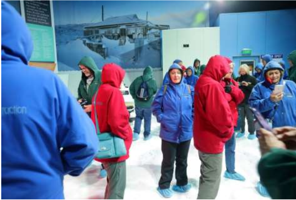
What does 32 deg. below freezing feel like?