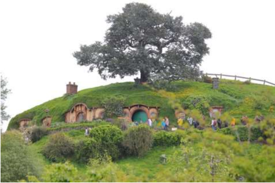
Fake tree at top of hill