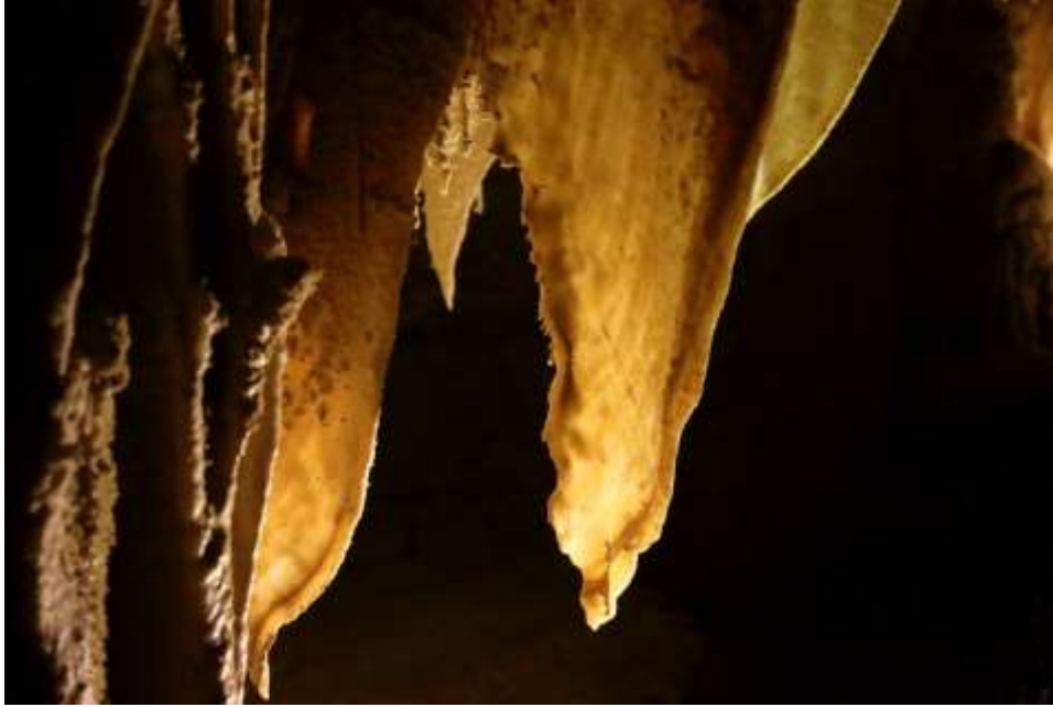
Stalactites as sheets