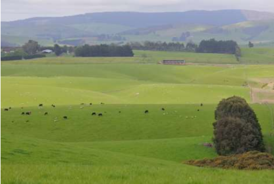
Green pastures with cattle and sheep

pastures. They keep the grass so trimmed that the fields look like hilly golf courses stretching in every direction. For variety, some pastures support black or black-and-white cattle, sometimes mixed with the sheep.