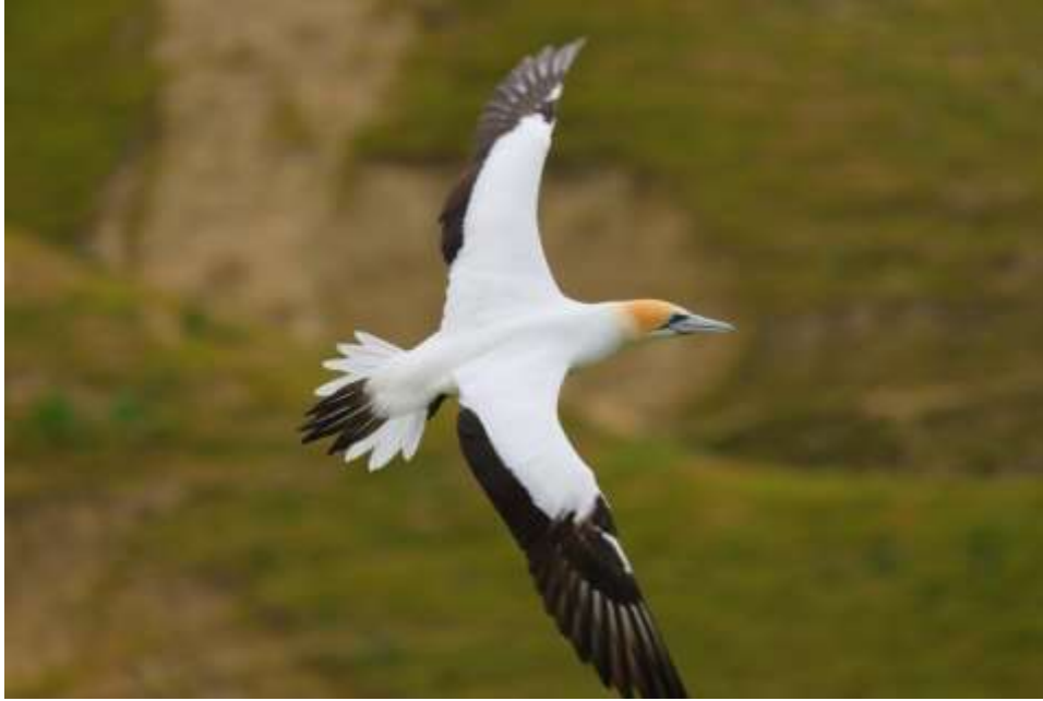
Gannets have a wingspan of over 6 feet