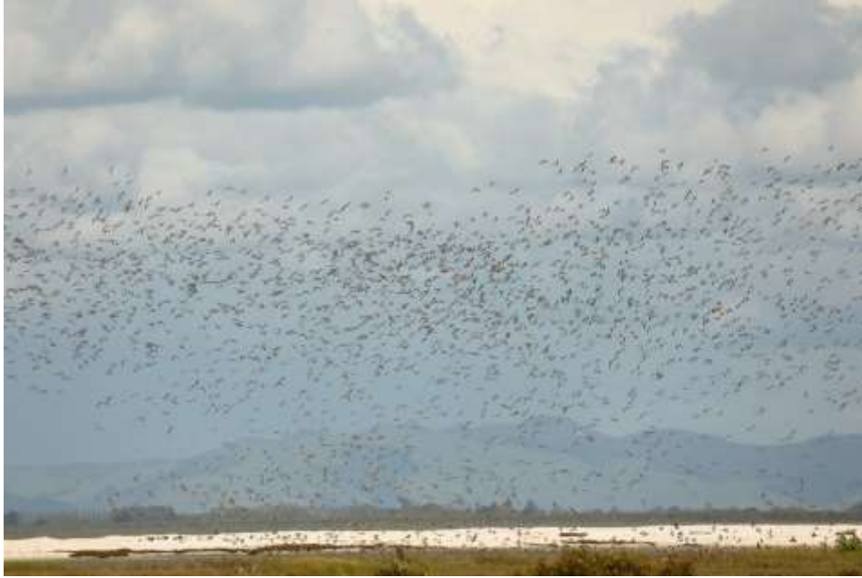
Bar-tailed Godwits in flight