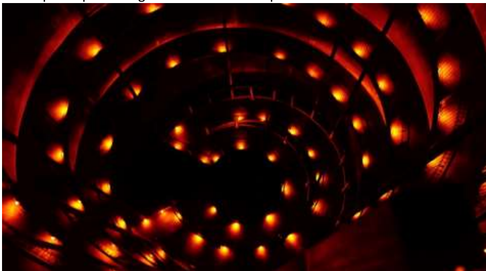
Illuminated circular staircase

To enter Waitomo Caves we walk down a gently sloping circular staircase illuminated by periodic lights. When photographed from the top down, it provides an interesting pattern. However, that array of lights is artificial. More fascinating is the pattern produced by nature, specifically by glowworms. I was unable to photograph the glowworms at Lamington National Park, but in this cave, we stand only inches from the glowworms and are also close enough to see their sticky strings. The glowworms are not actually worms, but rather insects; the adult stage resembles a mosquito. Without a mouth or stomach, the adult's purpose is only to mate, lay eggs, and then die. The eggs hatch into larvae, which is the stage that extends long strings, hanging vertically in the dark cave. The larvae emit bioluminescence and the little lights attract insects that wandered into the cave and then become stuck on the sticky strings. The larvae pulls up its strings and devours the captured insect.