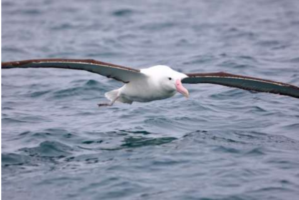
Southern Royal Albatross, the largest of albatrosses