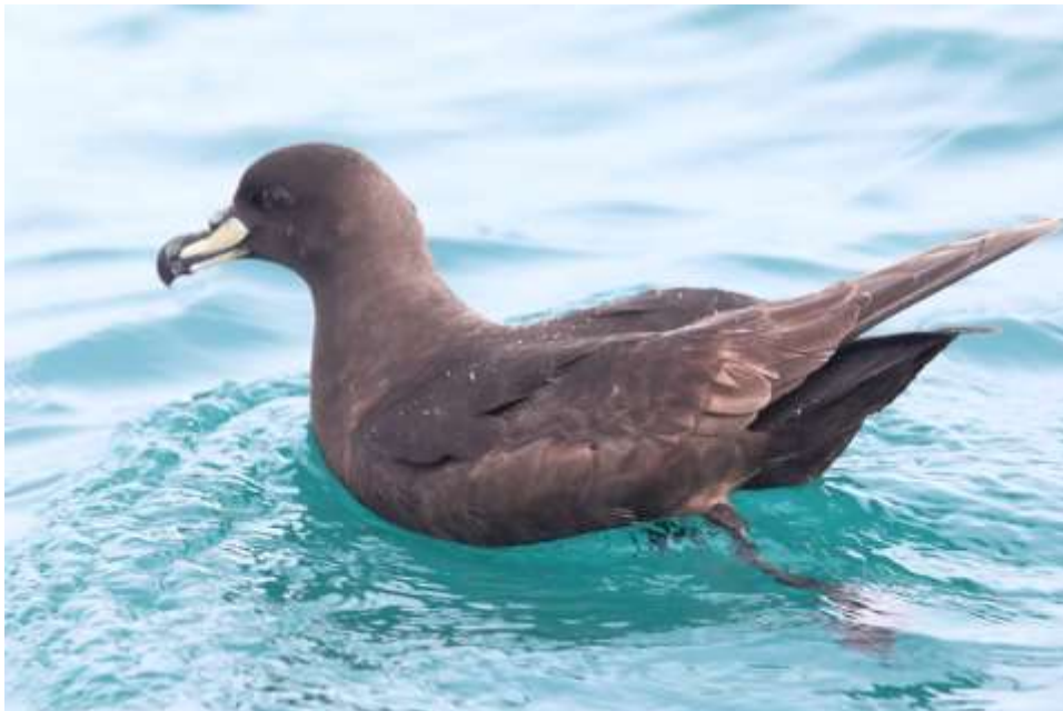
Westland Petrel, a rare endemic, not known to science until 1945