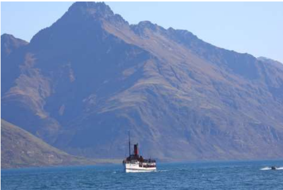
T. S. S. Earnslaw on Lake Wakaripu