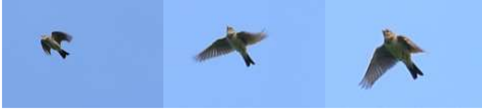
Eurasian Skylark “skylarking” about 200 ft. above a pasture

Our next stop is Sinclair Wetlands, a favorite of mine although often frustrating because of high winds that keep the birds hidden in the flax. This time it is calm. I know from my readings that the New Zealand Fernbird can be found here, although not by me in my prior two visits. Nor have I found the fernbird elsewhere. I study the app on my iPhone for details of what to look for and barely get the phone back in my pocket when a fernbird flies past me and perches close by for two seconds in amazingly sharp view. I quickly draw my camera from its holster and take multiple shots of the bird that meanwhile has secluded itself in shoulder-high bushes. The New Zealand Fernbird, a lifer, is barely discernable in my best photo, but I can make out the distinctive rufous crown, prominent white supercilium, dark eye, and dark streaking on its back, all characteristic of the South Island subspecies.