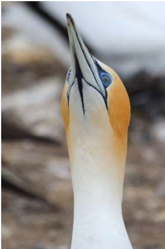
How to tell Australasian Gannet from Northern Gannet