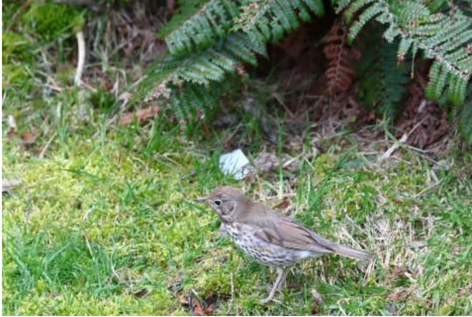
Song Thrush near base of Mount Cook