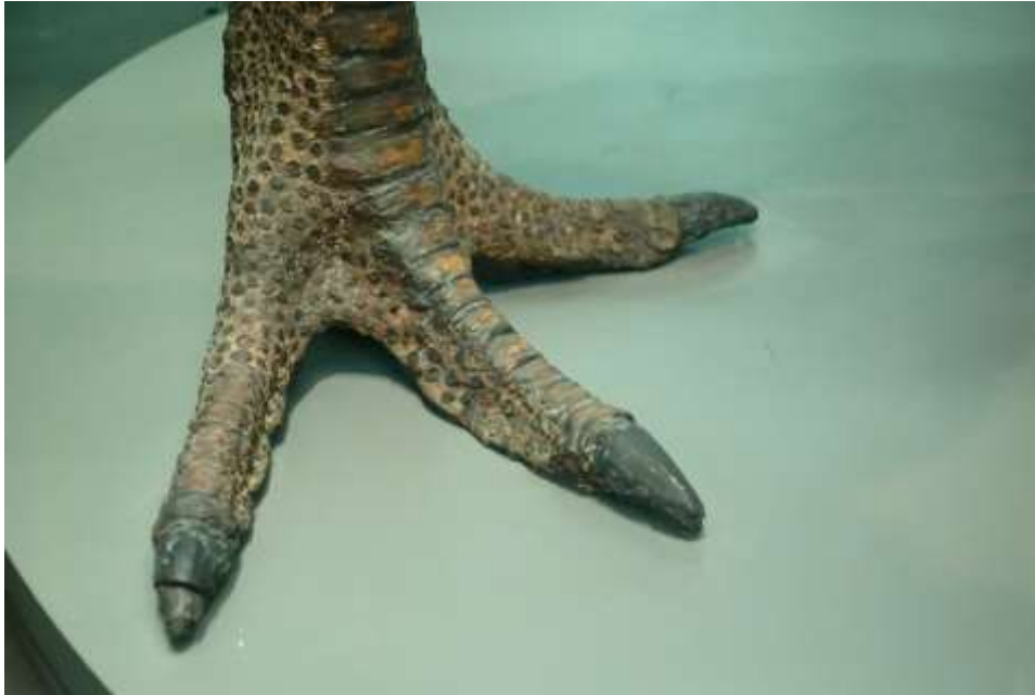
Three toes of moa

The Māori, sea-faring Polynesians, arrived in New Zealand about 1280 A.D. That date was arrived at from carbon-dating shells and seeds gnawed by a rat. Rats came with the Māori. Before their arrival, there were no land mammals in New Zealand and only three flying mammals, three bat species. The Māori survived on the North Island by planting kumara (sweet potato) and supplementing it with killed moas. On the South Island, it was too cold to grow kumara, so they ate moa and seals. In less than 160 years the moa was wiped out, one of the fastest recorded megafaunal extinction.