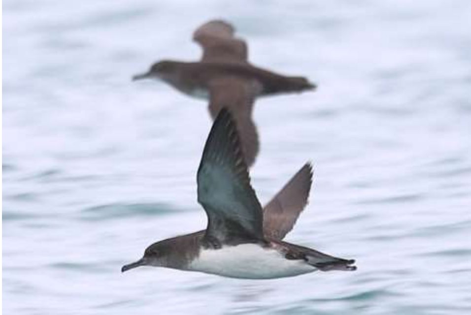
Hutton's Shearwater, shadowed by another