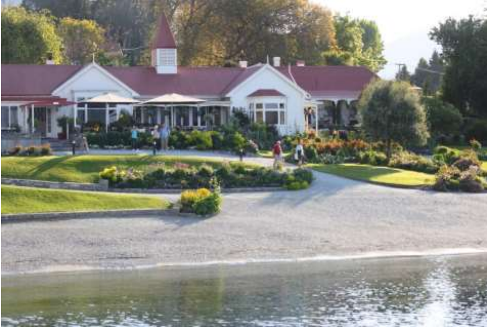
Walter Peak Farm