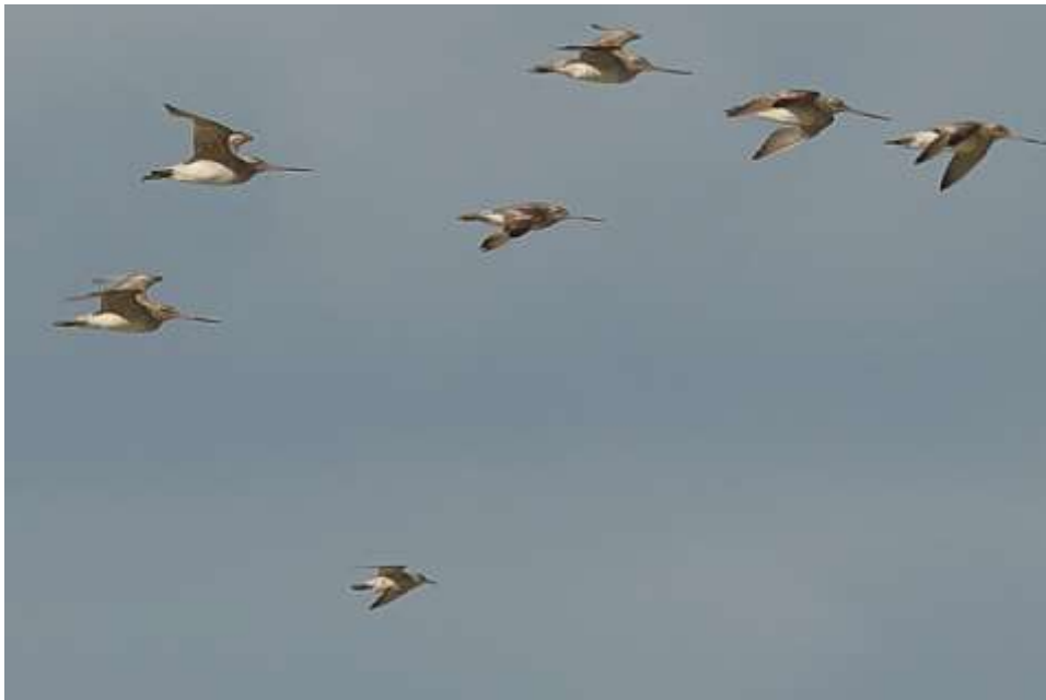
Bar-tailed Godwits in flight, with one Red Knot flying below