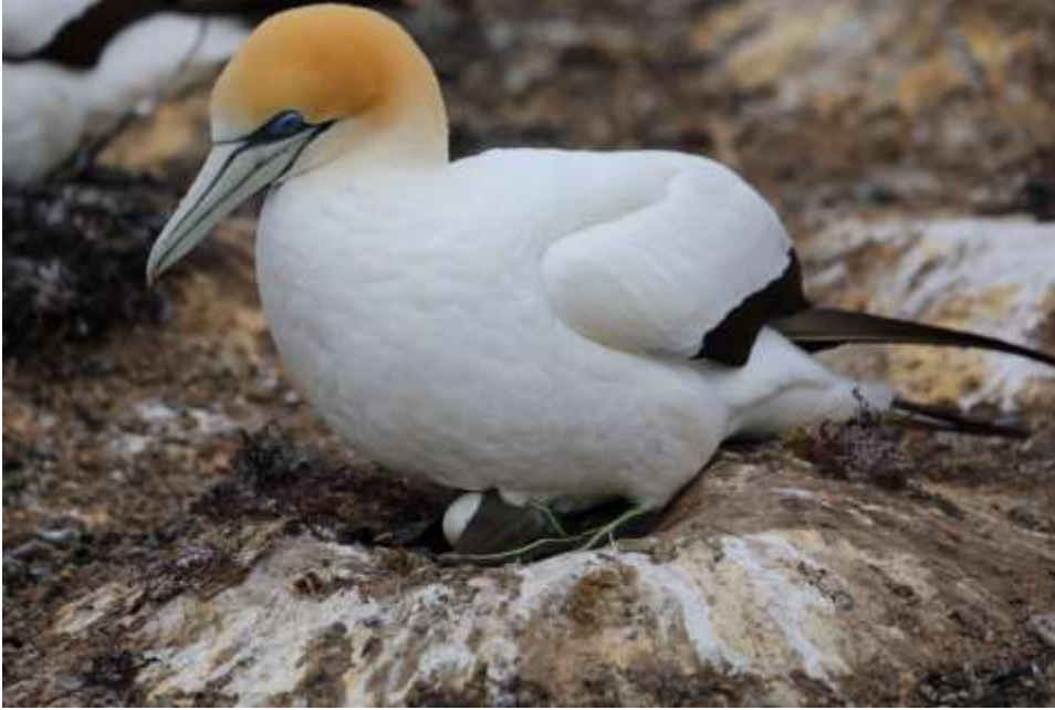
Female gannet sitting on an egg