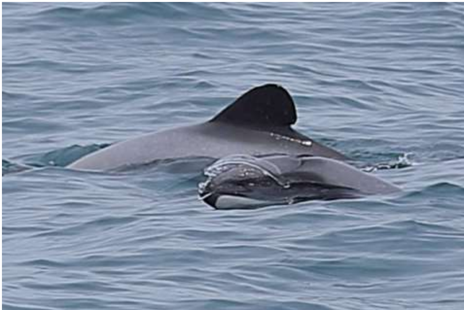
Hector's Dolphins, rare and local to this area of New Zealand