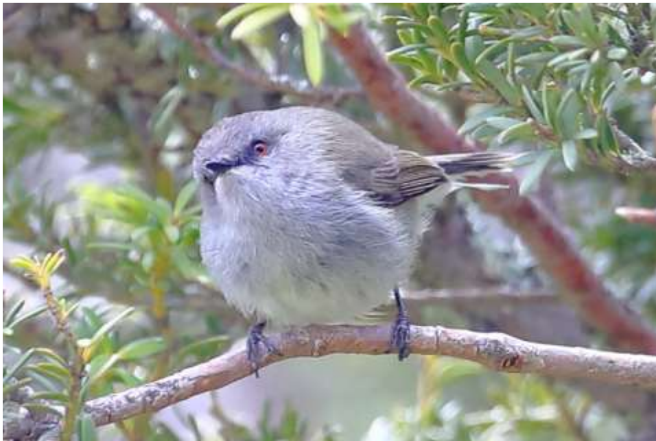
Grey Warbler – Gray Gerygone