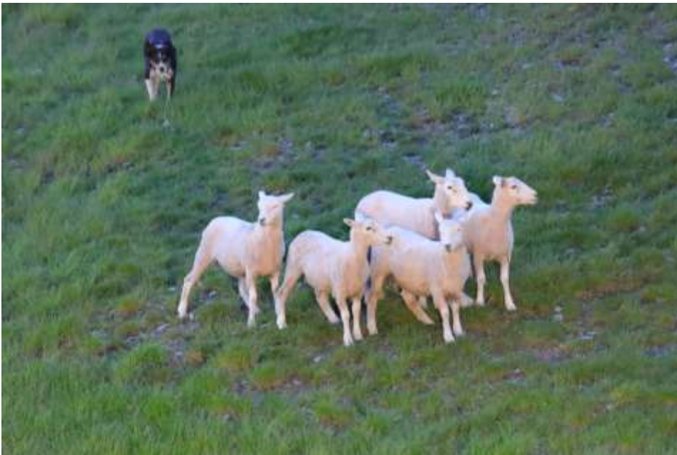
Sheepdog herds sheep

On our nighttime boat ride returning to Queensland, the cloudless sky gives me a clear view of stars. Several times now in Australia and New Zealand I have been trying to find the Southern Cross. Often I am able to find \alpha - and \beta -centauri, the pointer stars, but the cross was always below the horizon. This time I can see the four stars that make up the Southern Cross. I gather many of my fellow travelers and lead them to the outside deck where I show them the cross, a first-time experience for them.