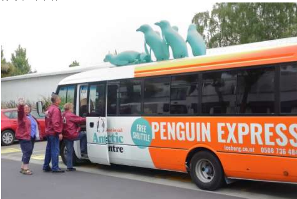
Bus to Antarctic Centre

The Penguin Express picks us up at our hotel—we have turned in the RVs—and takes us to the Antarctic Centre. The facility is the staging area for many countries for their explorations of the Antarctic and it is also a showplace for us to learn more about the continent. We ride on a Hagglund, the specifically designed vehicle for Antarctic travel, taking them across steep hills, water traps, tilted slopes, and several hazards.