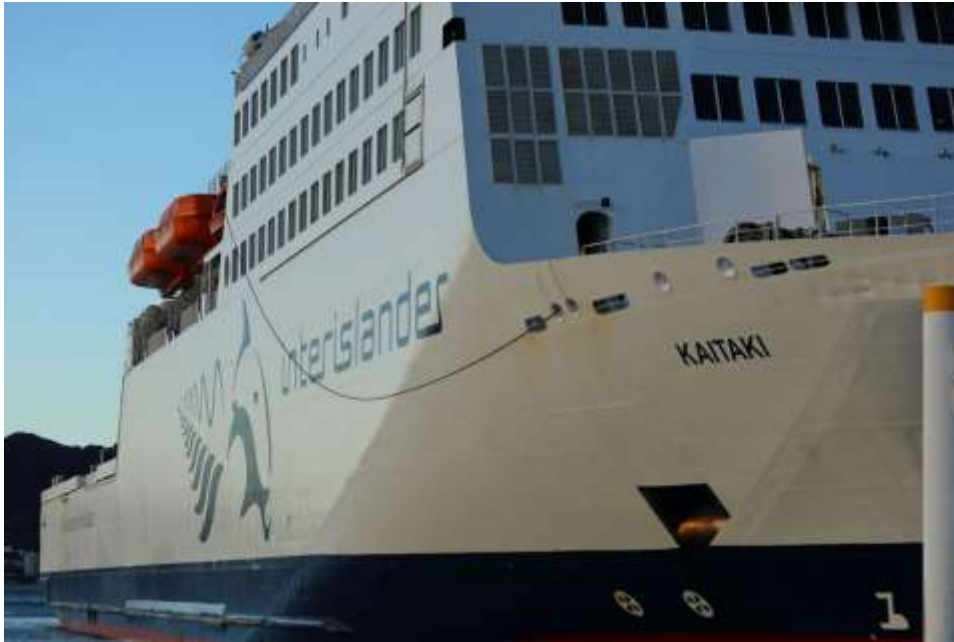
Ferry to South Island

We are first in line to board the ferry to the South Island. I drive onboard and take the elevator to the seventh floor. From the outside balcony, I can see that most of our caravan are still lined up on the dock. In another half hour we are all boarded and while some head to breakfast I go outside to watch for pelagic birds.