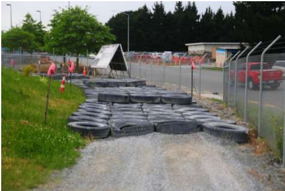
One of the hazards we drive over with a Hagglund

We don insulated coats and enter a room where a wind storm brings the temperature down to 32 deg. below zero, a summer storm temperature in the Antarctic. We also watch injured Little Penguins being fed.