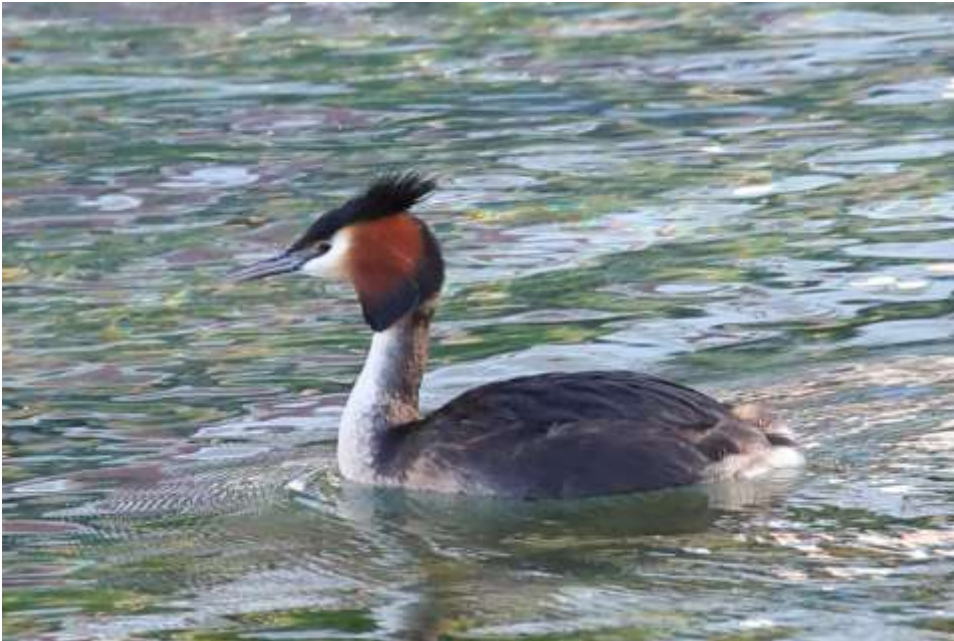
Great Crested Grebe on Lake Wakaripu