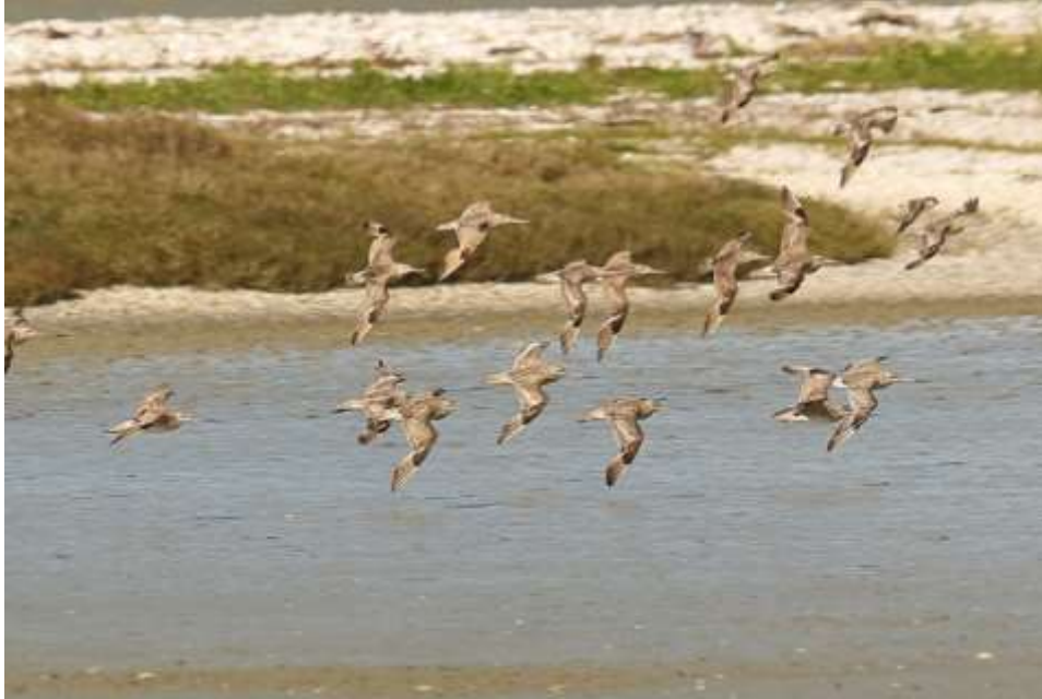
Bar-tailed Godwits in flight