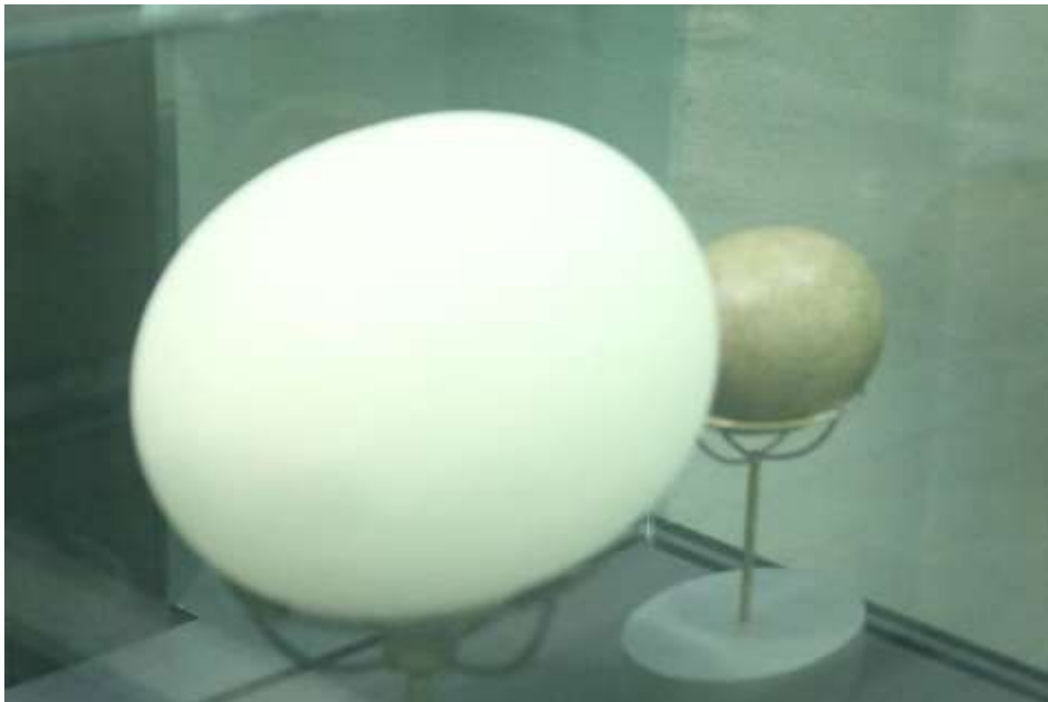
Moa egg compared to emu egg