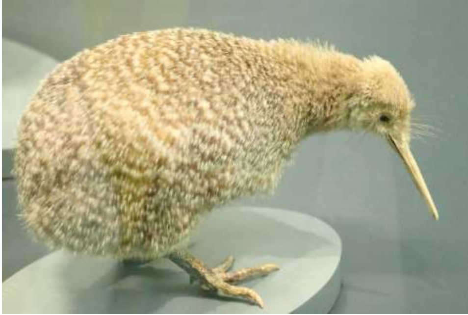
Kiwi, a distant relative of the moa