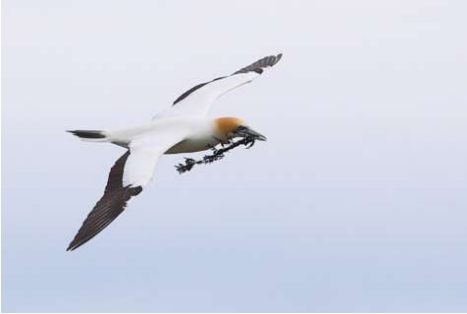
Male Australasian Gannet carrying nesting material