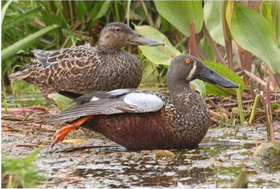
New Zealand Shovelers

The next bird passages me from extreme excitement to disillusioned disappointment. The Yellowhead is an endangered species used as a poster bird for protecting wildlife. I think I may have seen it once before, but now have my doubts, so I have since been on the lookout for a better view and convincing photo. I see a yellow-headed suspect and immediately shoot a dozen photos. Through my camera lens, I am convinced I have finally gotten it. It bothers me, though, that it is in the wrong habitat. Upon reviewing my photos on my computer, I recognize it as a fairly-common Yellowhammer with an unusual absence of head markings. Win some; lose some!