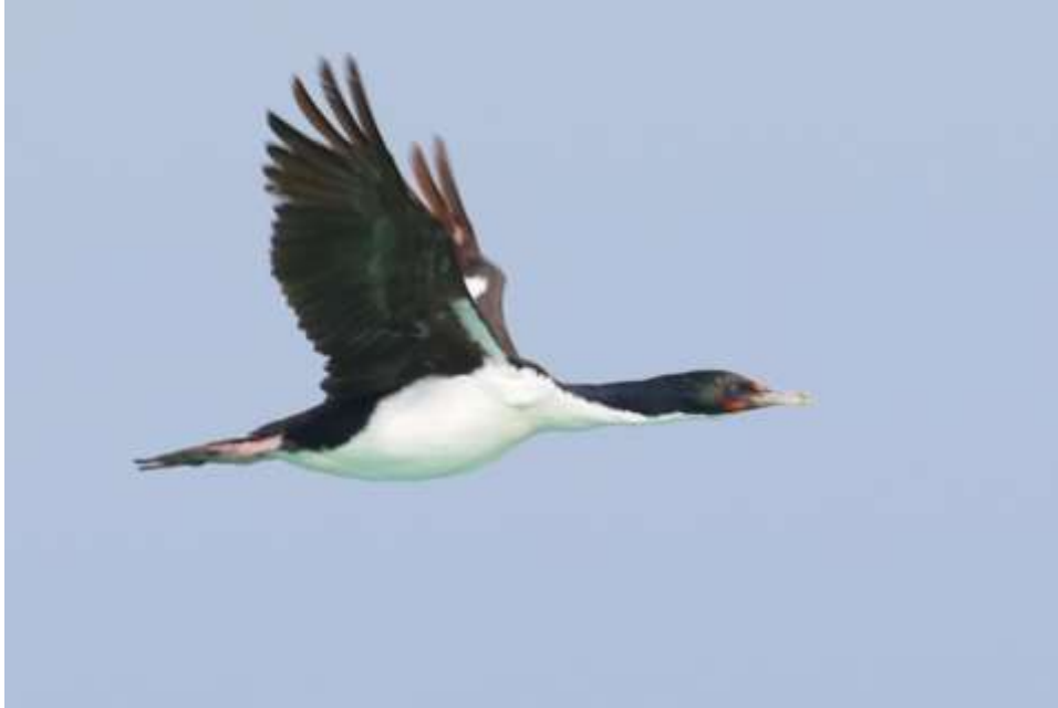
Stewart Island Shag (pied form)