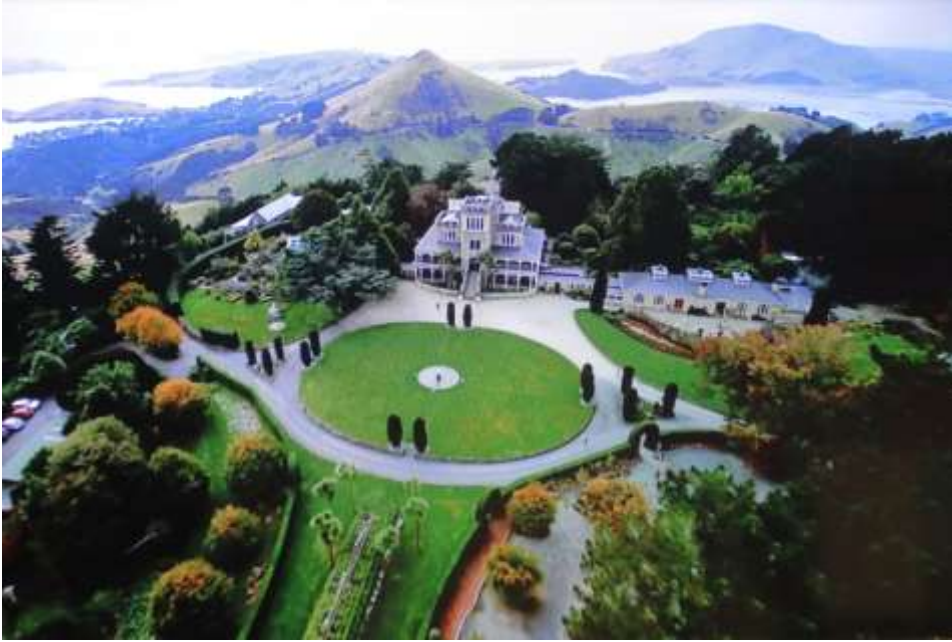
Photograph of photograph of aerial view

While the interior of Larnach Castle is impressive, I more enjoyed walking around the surrounding gardens. Impressive is the way lines of shrubbery draw attention to distant views of Dunedin and its harbors and islands.