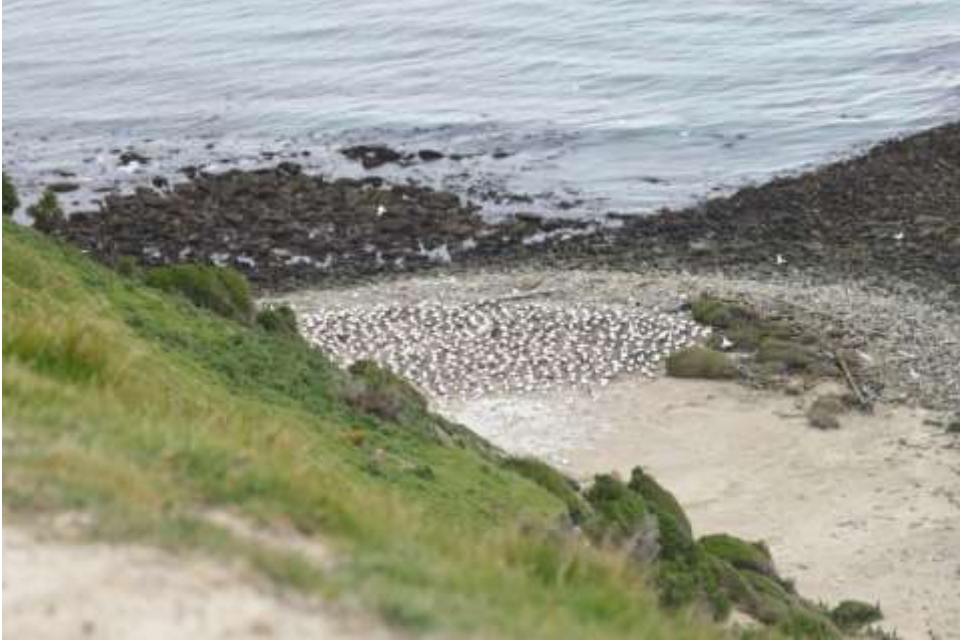
First nesting colony