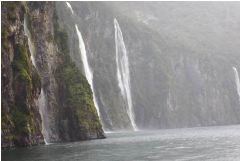
The Four Sisters, only seen in heavy rains