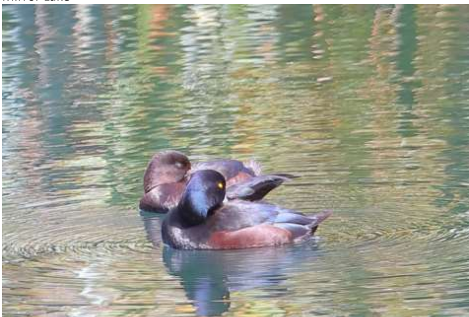
Pair of sleeping New Zealand Scaup