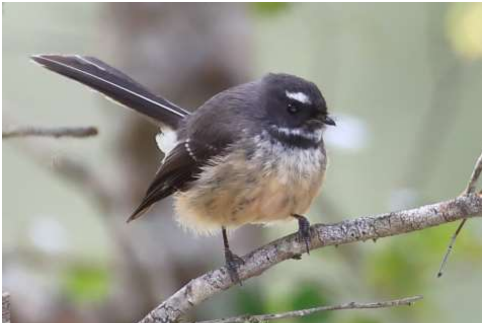
New Zealand Fantail