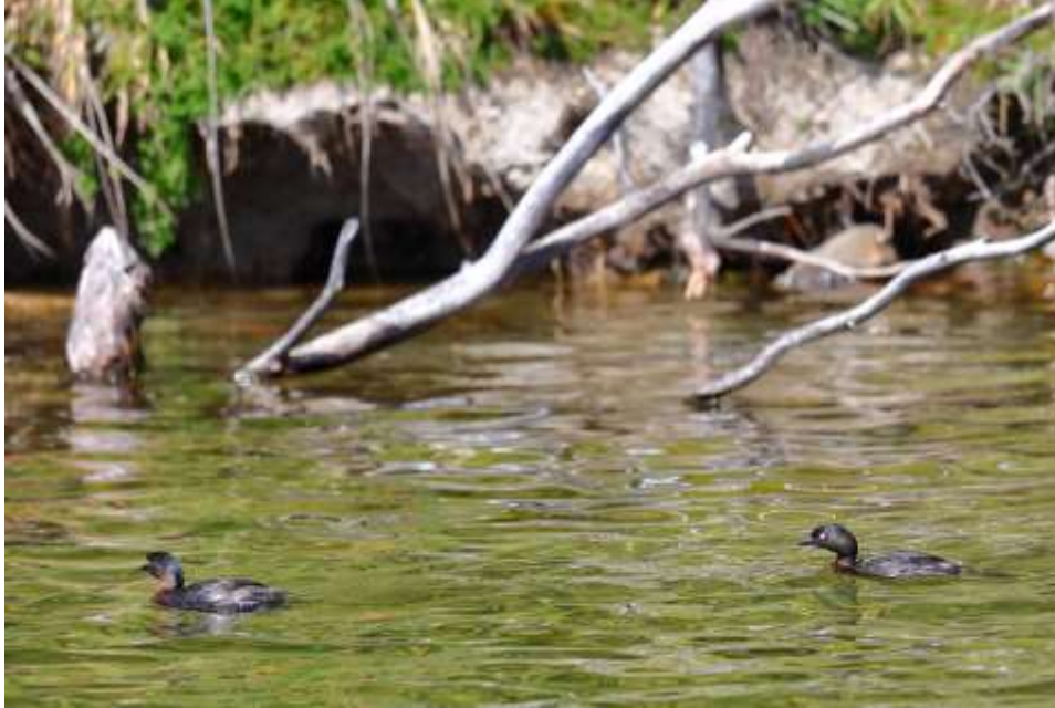
New Zealand Dabchick