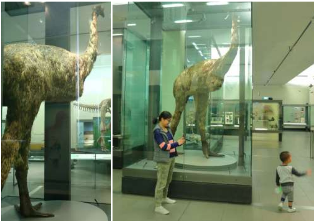
South Island Giant Mōa

In the museum, we see the 1913 reconstruction of a Giant Mōa using emu feathers. It stands behind plate glass that reflects overhead lighting, making it nearly impossible to photograph, but I try. A close-up of its feet shows three powerful forward toes and a hidden hind toe, closely resembling those of the cassowary we saw in Australia. I also photograph a mōa egg adjacent to an emu egg, the latter about the size of my clenched fist.