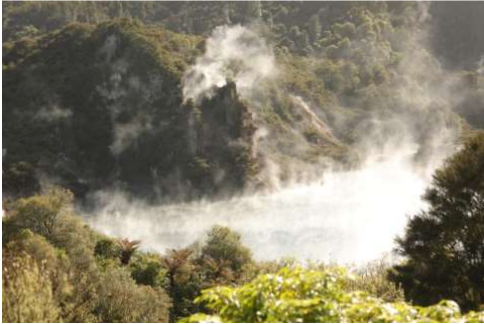
Waimangu Volcanic Valley