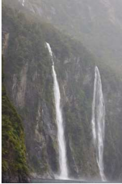
Top of mile-high water fall + bottom of same waterfall