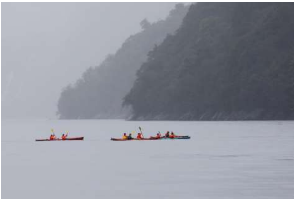
Colorful kayaks in monochrome setting

In spite of the inclement weather, overcast skies, and heavy rain, I manage to take some interesting photos. I find it amazing that many waterfalls are a mile high. Only a few times can I see the top of the waterfalls as clouds shroud them. To give perspective to the extreme heights, I try photographing some waterfalls with another ship at their base. At one waterfall, the ship captain drives into the edge of the downpour, drenching anyone standing at the bow. Rain washes dull color out of photographs, so a few brightly colored kayaks look like they are painted into a monochrome background.