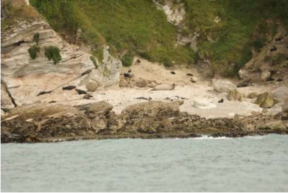
New Zealand Fur Seals