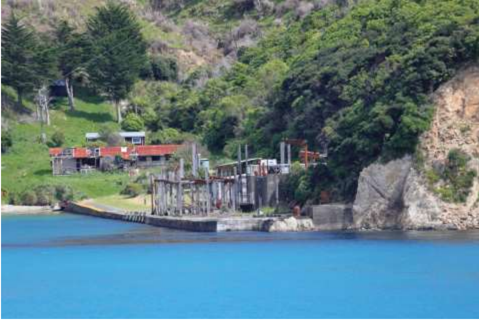
Ruins of old whaling station in foreground