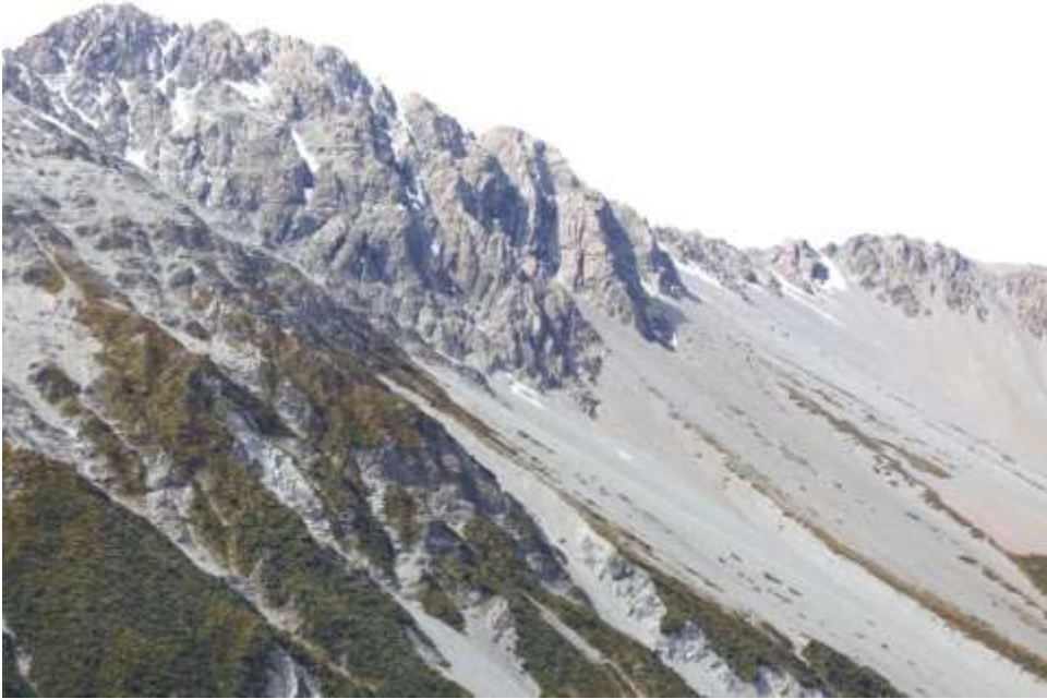
Near Mount Cook