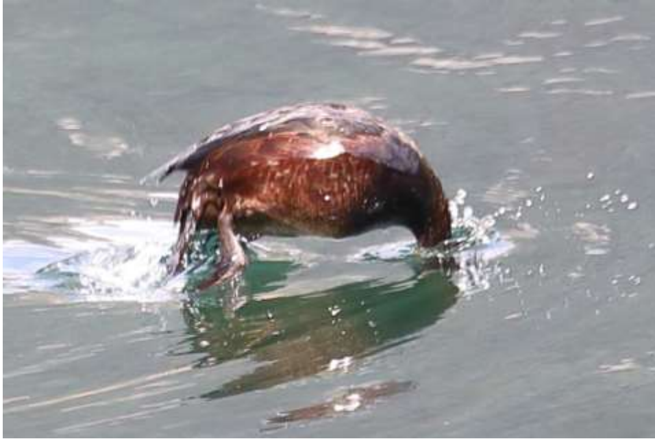
Diving New Zealand Scaup