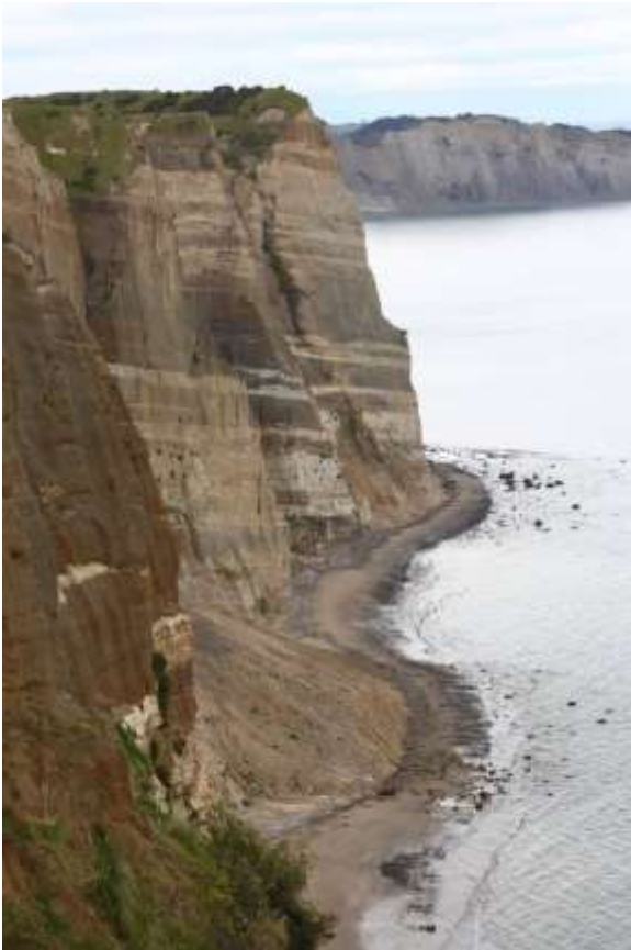
Cliffs and shoreline, showing landslide at Cape Kidnappers

Two years ago, we visited the gannet colony by riding on a wagon pulled by a tractor along the gravel, boulder-strewn shoreline. This time when I attempted to make reservations, I found out that the tide was too high at the time we needed. I made other arrangements. Meantime, early this year there was an avalanche caught on photos. Two Japanese tourists were walking the beach when the landslide occurred. They narrowly escaped with cuts and bruises. Subsequently, the government closed the beach for walking or vehicles. Today, we can see the landslide.